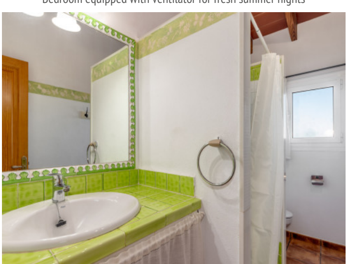
2nd bathroom en suite with shower Great outdoor area All information is correct to the best of our knowledge. Errors and prior sale excepted. This prospectus is purely for information purposes. Only the notarized deed of sale is legally binding.

PORTA MALLORQUINA • C./ CONQUISTADOR 8, 07001 PALMA TEL. +34 971 698 242 • INFO@PORTAMALLORQUINA.COM