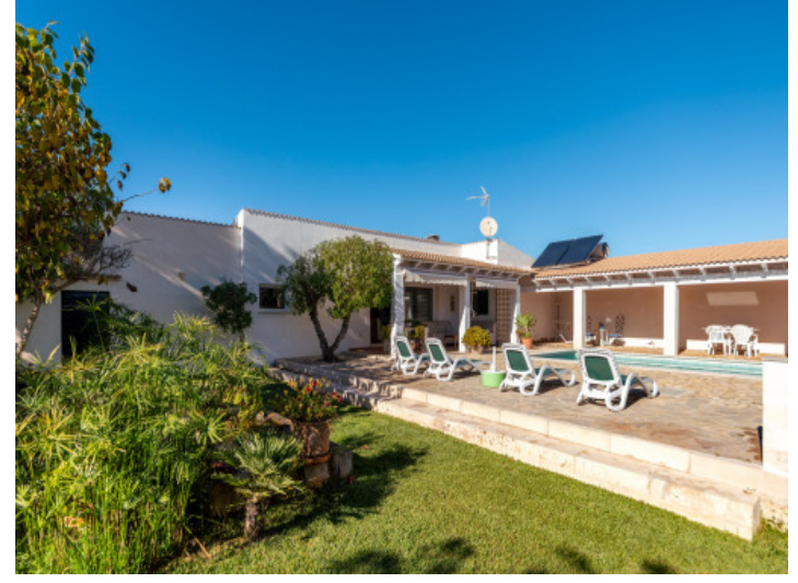
Well mantained garden

PORTA MALLORQUINA® Your home. Our passion.