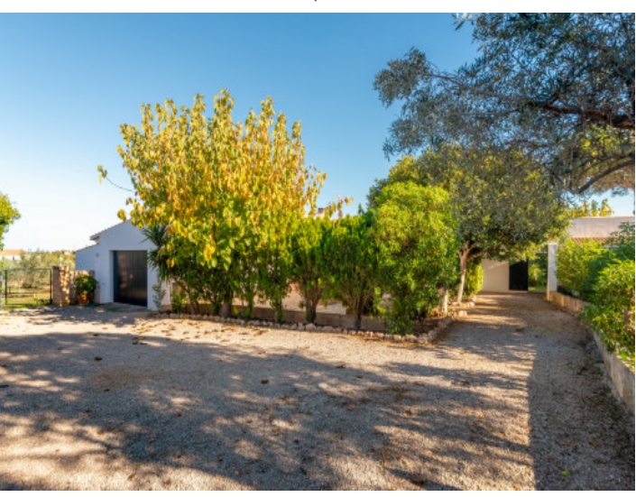
Garage and outdoor parking spaces

All information is correct to the best of our knowledge. Errors and prior sale excepted. This prospectus is purely for information purposes. Only the notarized deed of sale is legally binding.