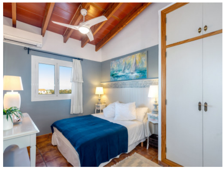
Bedroom equipped with ventilator for fresh summer nights