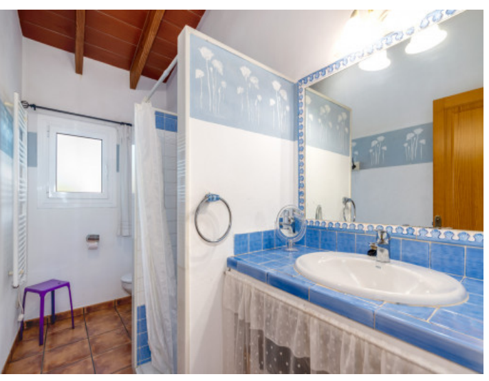
Country style bathroom with shower