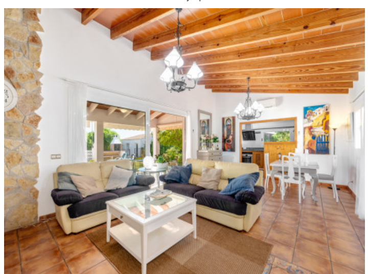
Open living and dining area Adjoins the kitchen The dining area adjoins the kitchen All information is correct to the best of our knowledge. Errors and prior sale excepted. This prospectus is purely for information purposes. Only the notarized deed of sale is legally binding.

PORTA MALLORQUINA • C./ CONQUISTADOR 8, 07001 PALMA TEL. +34 971 698 242 • INFO@PORTAMALLORQUINA.COM