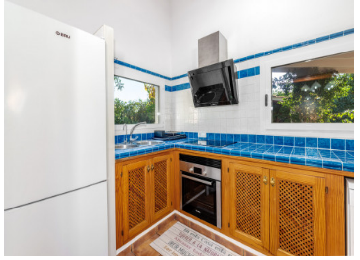
Country style kitchen

PORTA MALLORQUINA® Your home. Our passion.