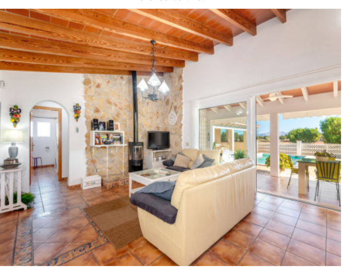
Cozy living area with fireplace