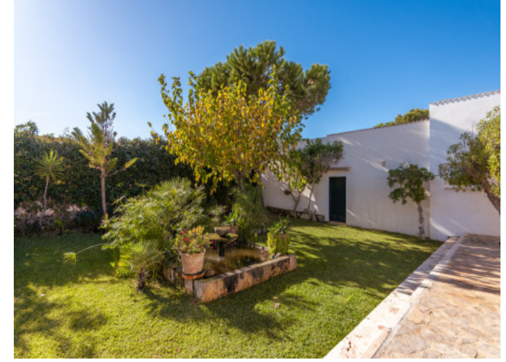
Mediterranean plants and trees