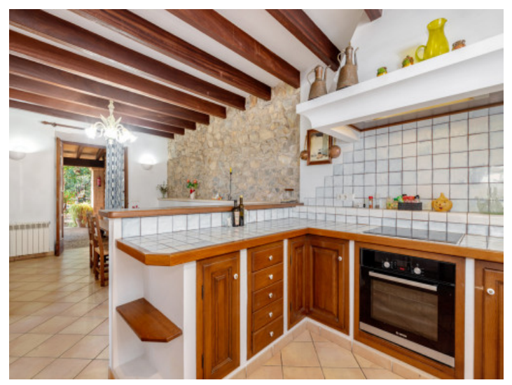
Fully equipped kitchen