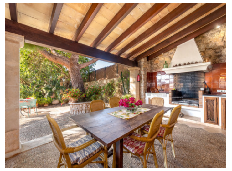
Covered terrace with barbecue area

PORTA MALLORQUINA® Your home. Our passion.