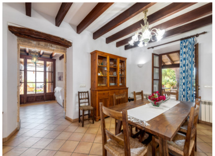
Rustic, open dining area Open kitchen and dining area All information is correct to the best of our knowledge. Errors and prior sale excepted. This prospectus is purely for information purposes. Only the notarized deed of sale is legally binding.