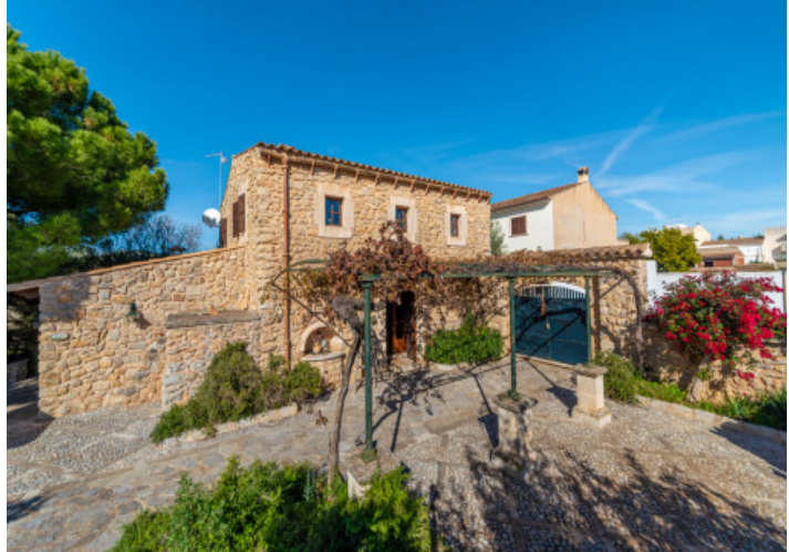
Exterior view of the finca