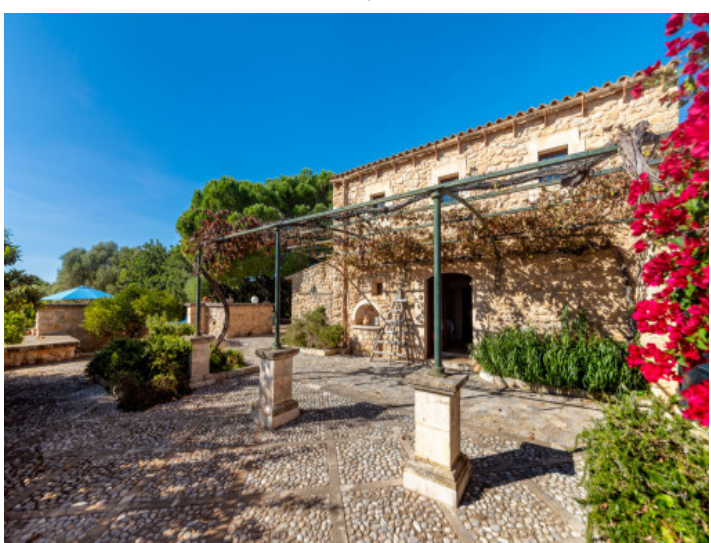
Terrace and finca