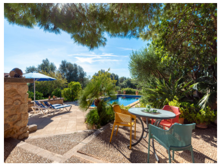
Idyllic pool terrace