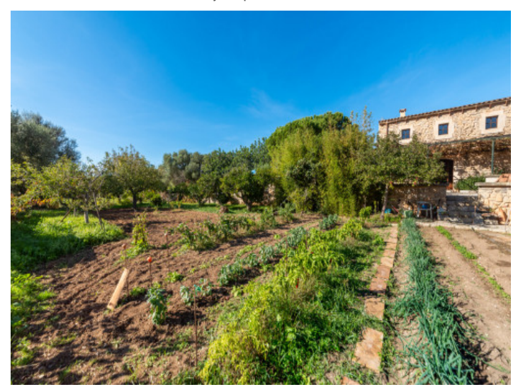
Spacious vegetable garden All information is correct to the best of our knowledge. Errors and prior sale excepted. This prospectus is purely for information purposes. Only the notarized deed of sale is legally binding.