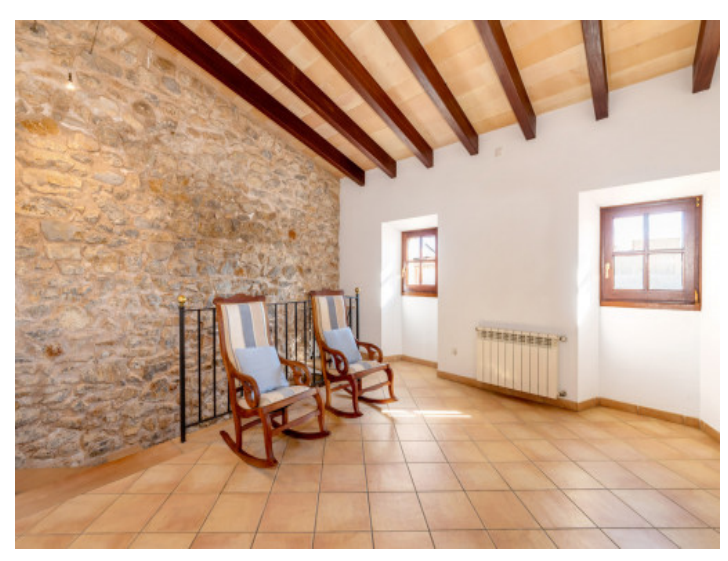
Open room on the upper floor