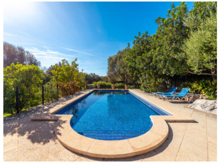
Mediterran pool area