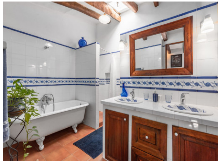
Bathroom with bathtub