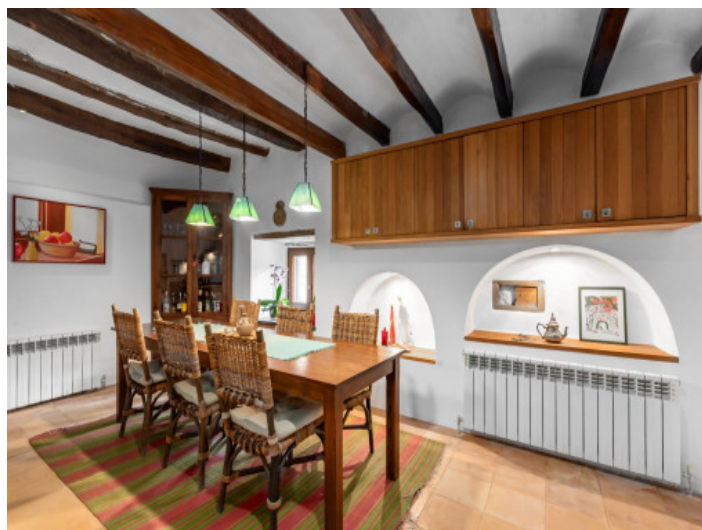
Mallorquin dining area

All information is correct to the best of our knowledge. Errors and prior sale excepted. This prospectus is purely for information purposes. Only the notarized deed of sale is legally binding.