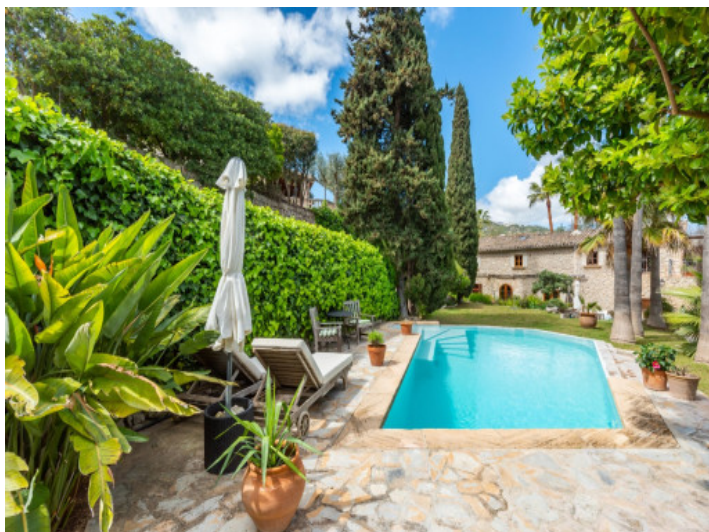
Well-tended pool area