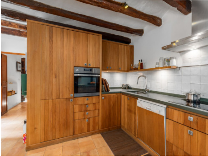
Fully equipped kitchen