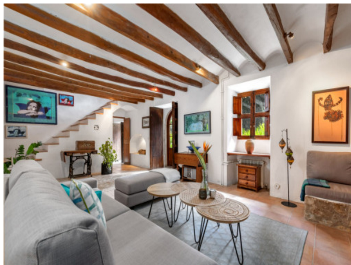
Living area and entrance area