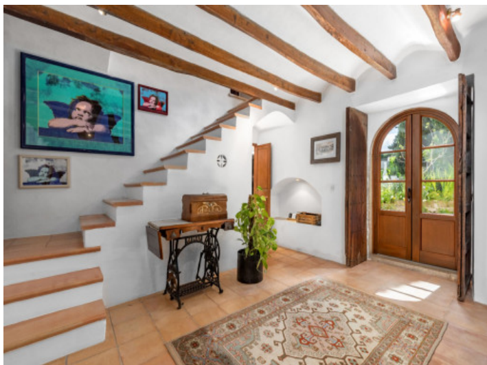
Entrance from the finca