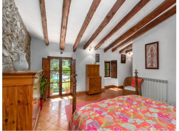
Bedroom with floor-to-ceiling windows