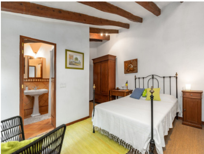
Bedroom with bathroom en suite