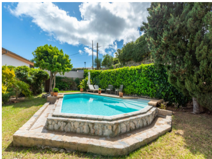
Pool is surrounded by the garden