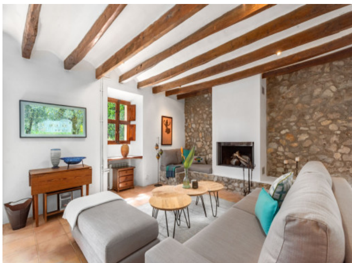
Cosy living area