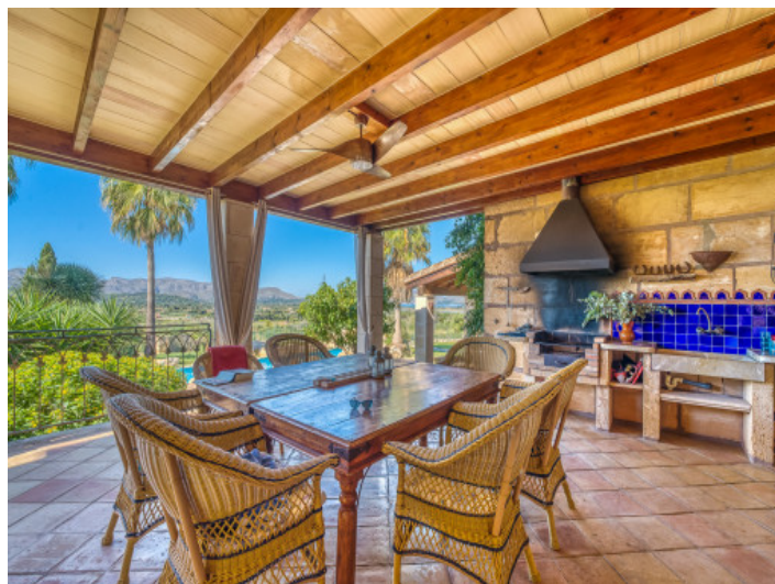
Covered terrace with outdoor kitchen