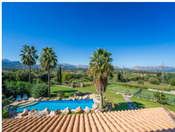
Unique landscape views from the balcony

All information is correct to the best of our knowledge. Errors and prior sale excepted. This prospectus is purely for information purposes. Only the notarized deed of sale is legally binding.