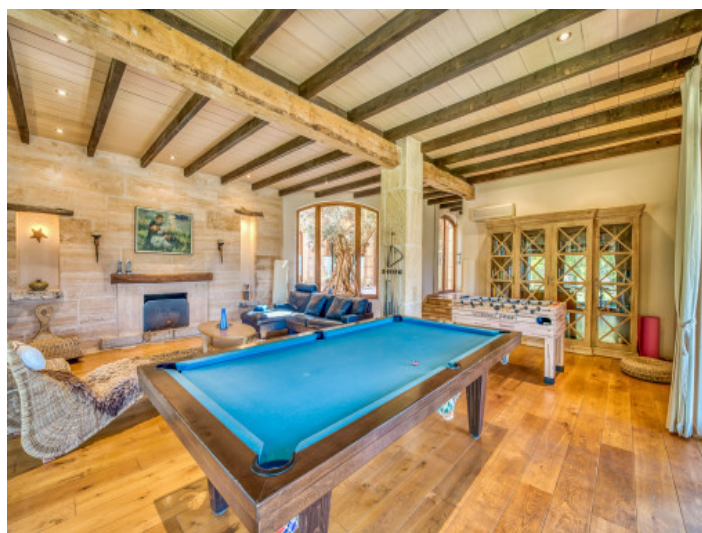
Impressive living area