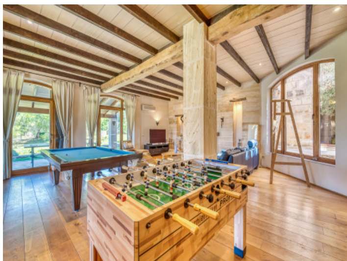
Living area with billiard table and table kicker