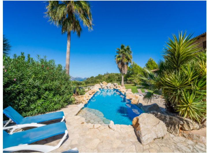
Mediterran pool area