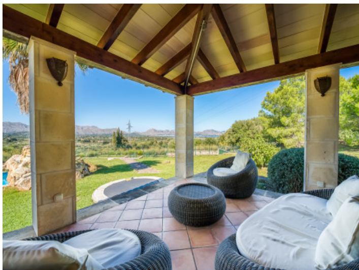
Covered terrace with lounge area