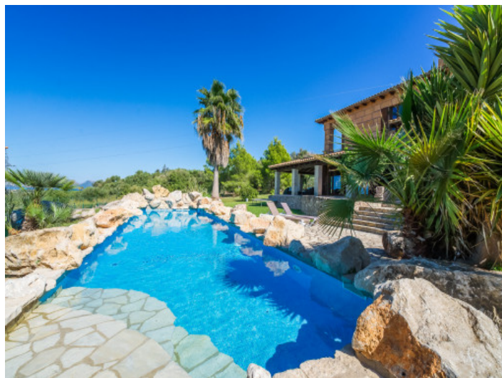
Mediterran finca with pool and tennis court in Alcudia