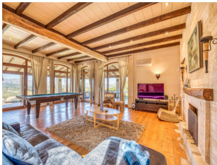
Living area with floor to ceiling windows