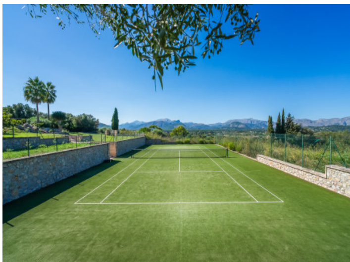
Fantastic tennis court