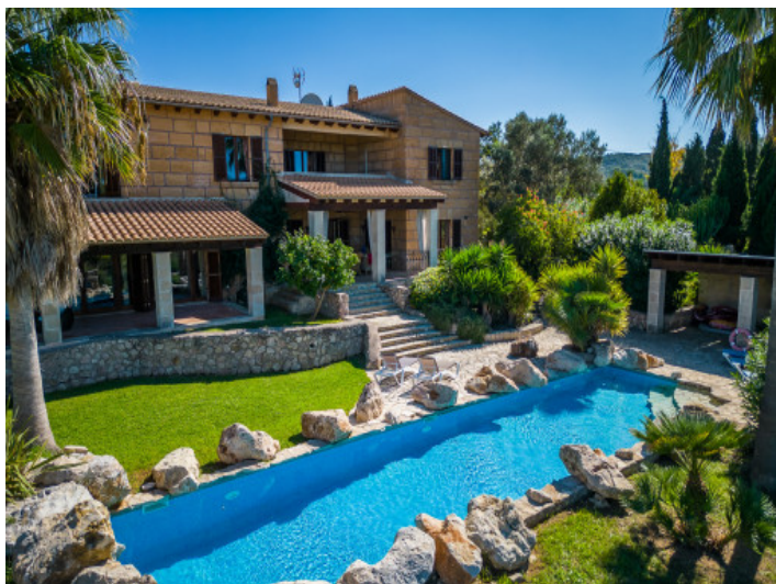
Mediterran garden with pool