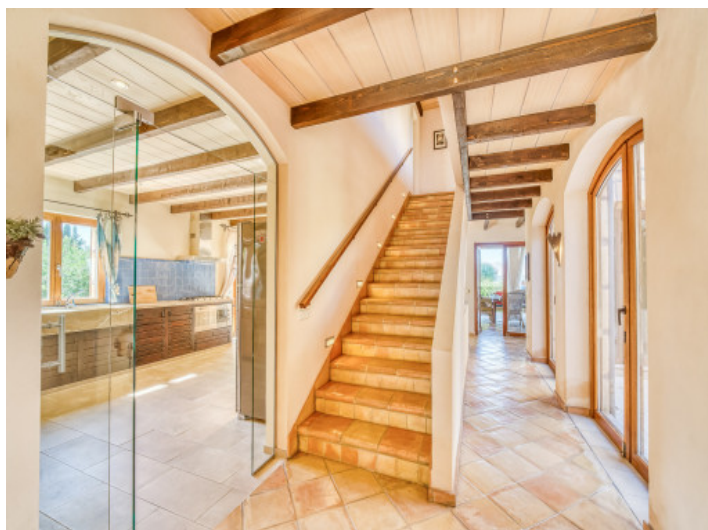
Floor from the finca