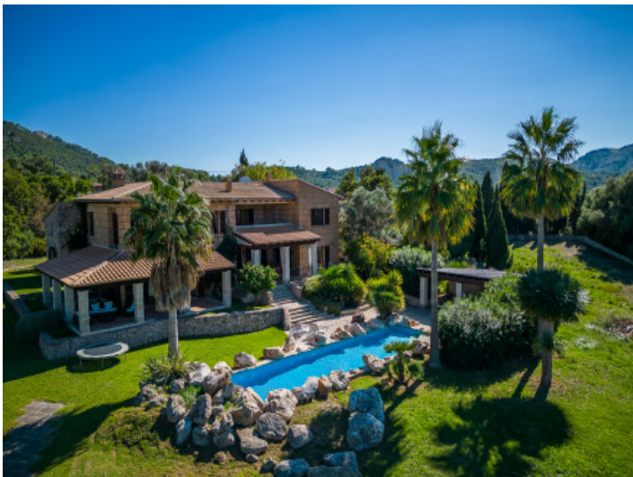
Views to the finca