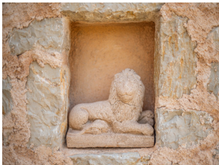
Wall with details

All information is correct to the best of our knowledge. Errors and prior sale excepted. This prospectus is purely for information purposes. Only the notarized deed of sale is legally binding.