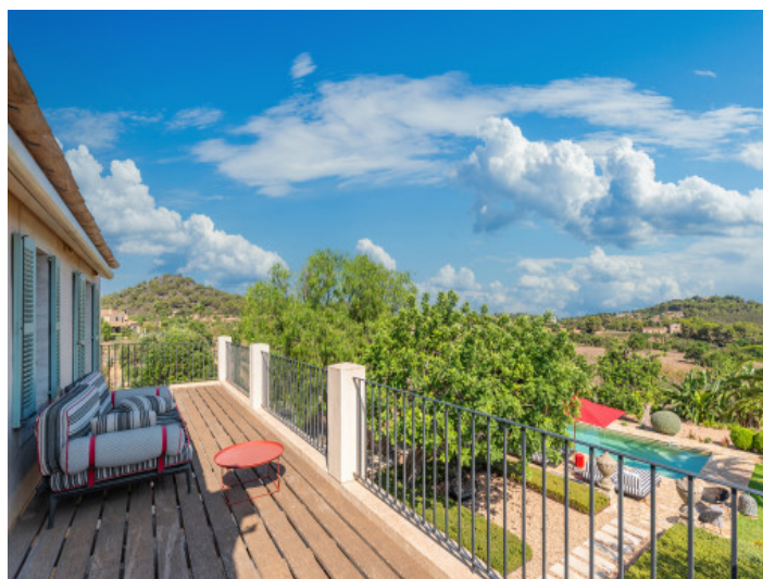
Balcony with pool views