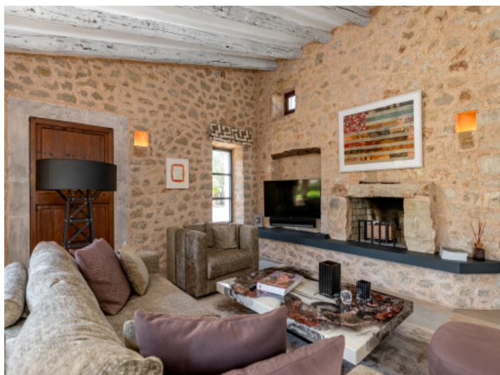
Cosy living area