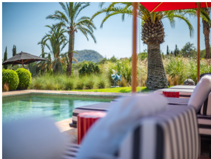
Idyllic pool area