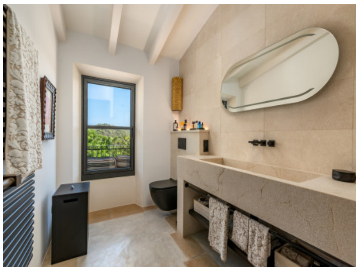
Bathroom with garden views