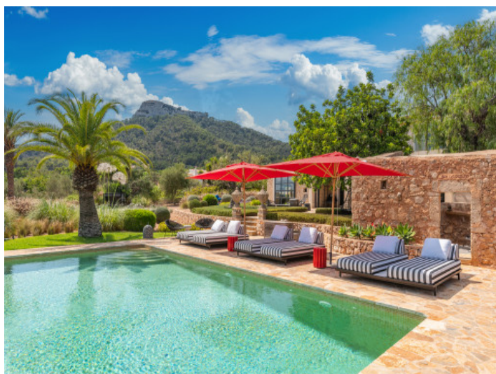
Sunny pool area