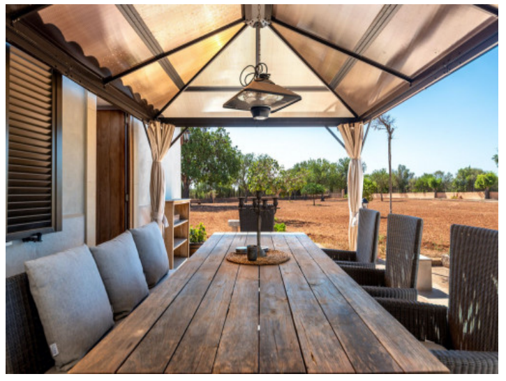
Additional outdoor dining area