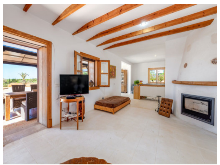
Spacious living area with fireplace Open kitchen All information is correct to the best of our knowledge. Errors and prior sale excepted. This prospectus is purely for information purposes. Only the notarized deed of sale is legally binding.

PORTA MALLORQUINA • C./ CONQUISTADOR 8, 07001 PALMA TEL. +34 971 698 242 • INFO@PORTAMALLORQUINA.COM