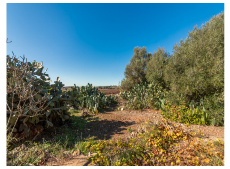
Finca in Santa Margalida

All information is correct to the best of our knowledge. Errors and prior sale excepted. This prospectus is purely for information purposes. Only the notarized deed of sale is legally binding.