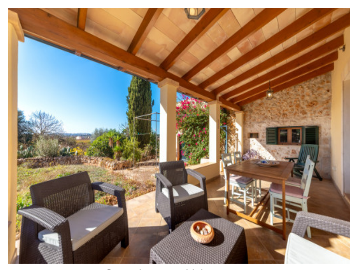
Covered terrace with lounge area