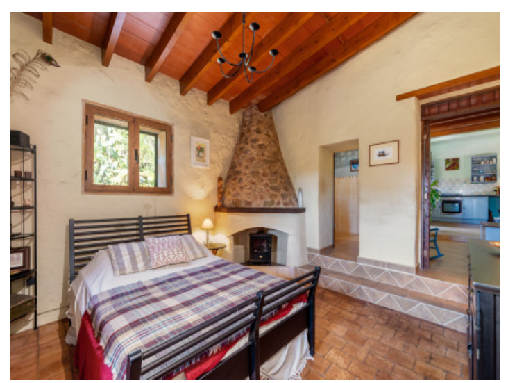
Bedroom with firepalce