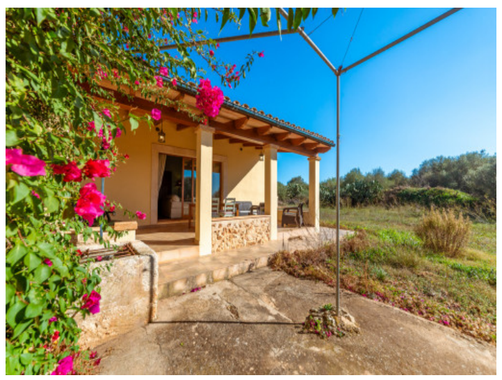
Views from the garden to the finca