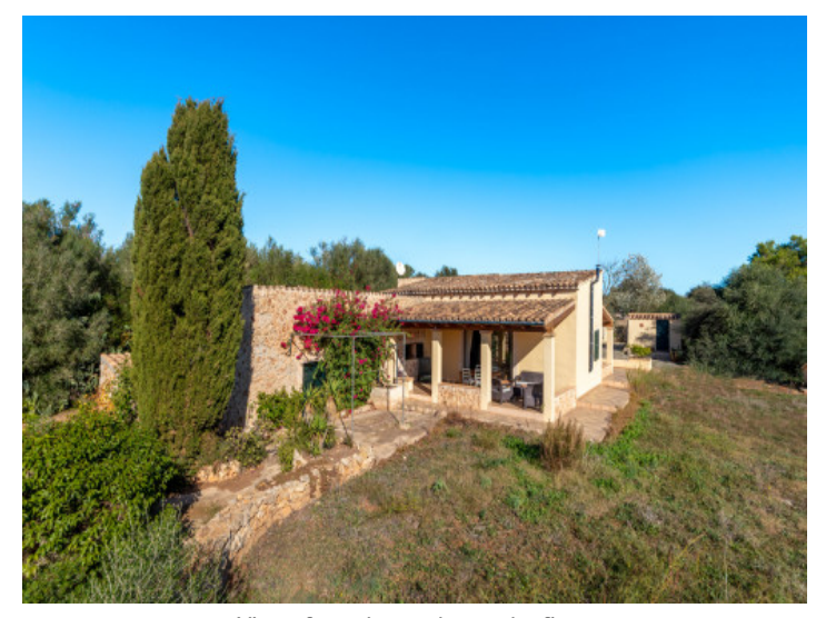
Views from the garden to the finca