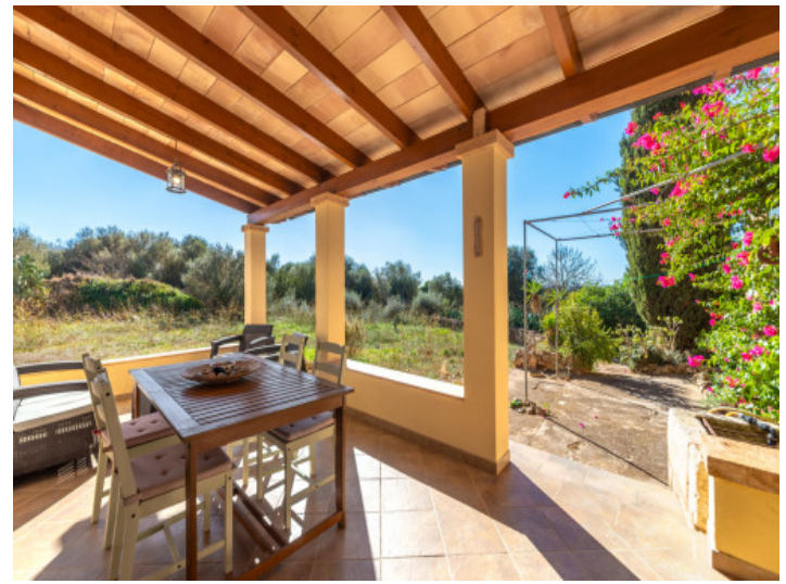
Views to the garden from the covered terrace