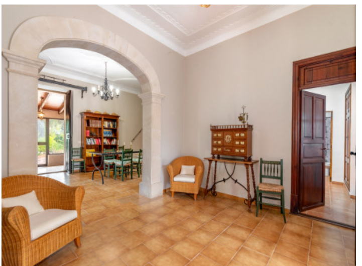
Hall with stone arch Open living and dining area All information is correct to the best of our knowledge. Errors and prior sale excepted. This prospectus is purely for information purposes. Only the notarized deed of sale is legally binding.