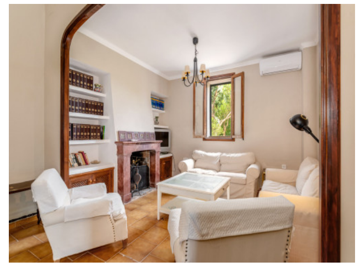
Living area with fireplaxe