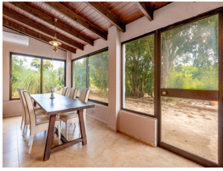
Wintergarden-like dining area