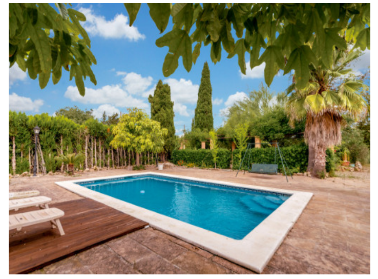
Idyllic pool area