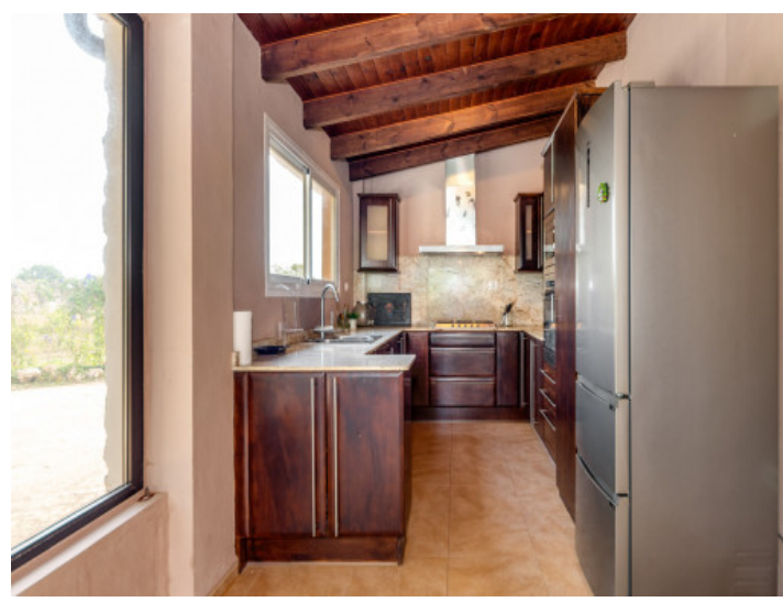
Wooden country house kitchen