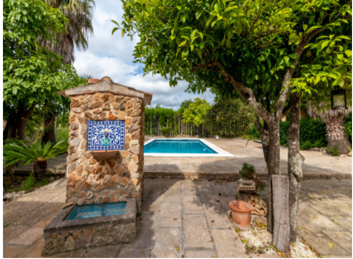
Large terraces Pool area All information is correct to the best of our knowledge. Errors and prior sale excepted. This prospectus is purely for information purposes. Only the notarized deed of sale is legally binding.