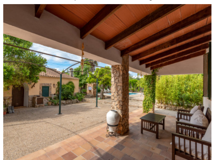
Covered terrace with seating area