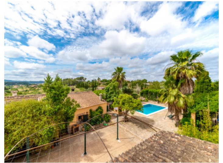
Lovely views over the surroundings