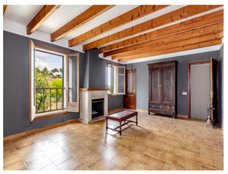
Further room with fireplace