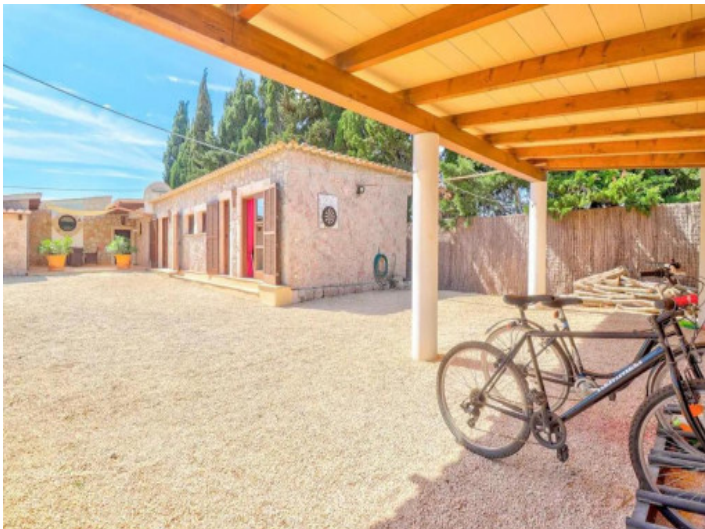
Separate guest apartments

All information is correct to the best of our knowledge. Errors and prior sale excepted. This prospectus is purely for information purposes. Only the notarized deed of sale is legally binding.