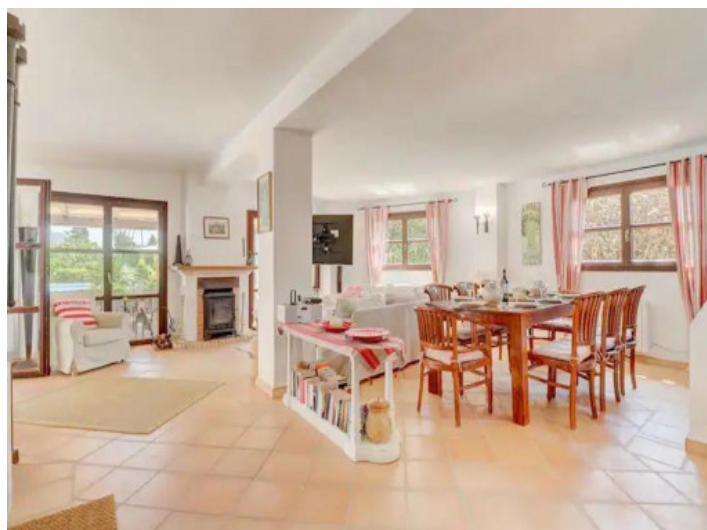
Spacious living and dining area with fireplace

All information is correct to the best of our knowledge. Errors and prior sale excepted. This prospectus is purely for information purposes. Only the notarized deed of sale is legally binding.