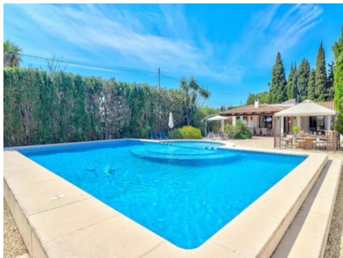
Very large pool