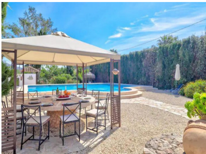
Lovely pool area