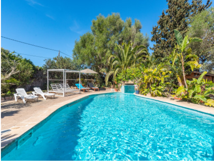
Pool area with waterfall