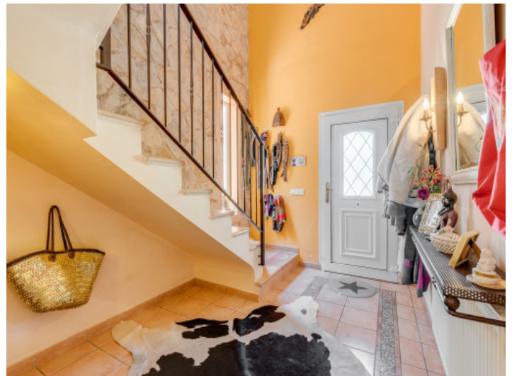
Noble entrance area