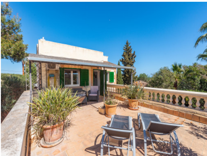
Roof terrace with sun loungers