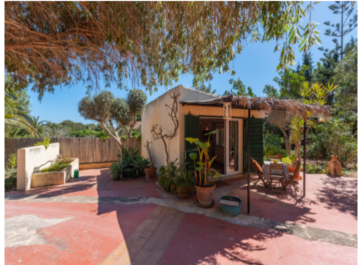
Practical guest house