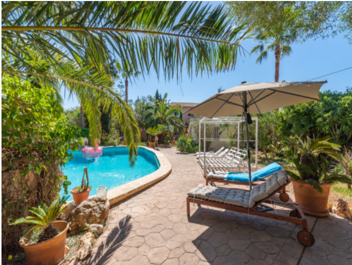
Pool area with sun loungers