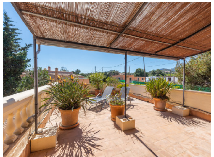
Partly covered roof top terrace

All information is correct to the best of our knowledge. Errors and prior sale excepted. This prospectus is purely for information purposes. Only the notarized deed of sale is legally binding.