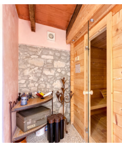
Spa with sauna