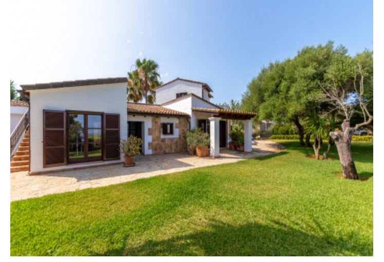
Exterior view and garden

PORTA MALLORQUINA® Your home. Our passion.