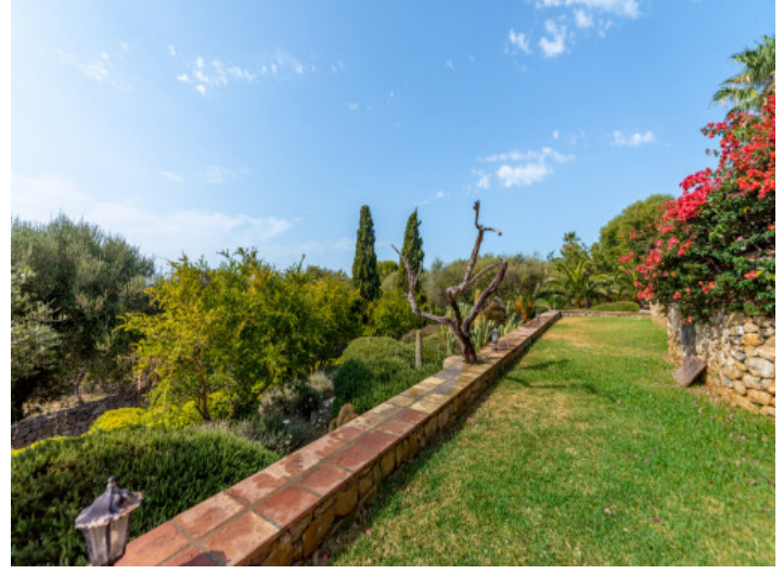
Garden area All information is correct to the best of our knowledge. Errors and prior sale excepted. This prospectus is purely for information purposes. Only the notarized deed of sale is legally binding.