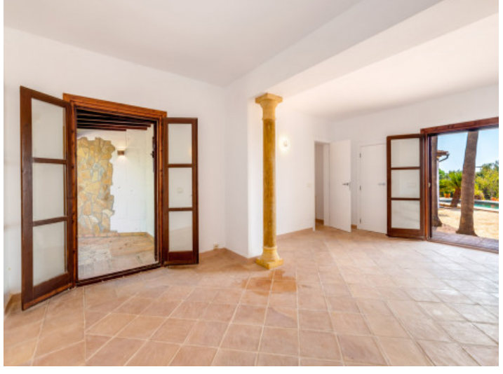
Alternative view of the bedroom