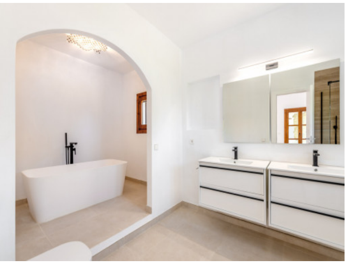
Bathroom with bath tub