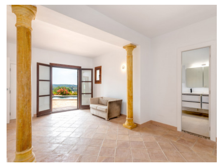
Bedroom suite with bathroom en sutie