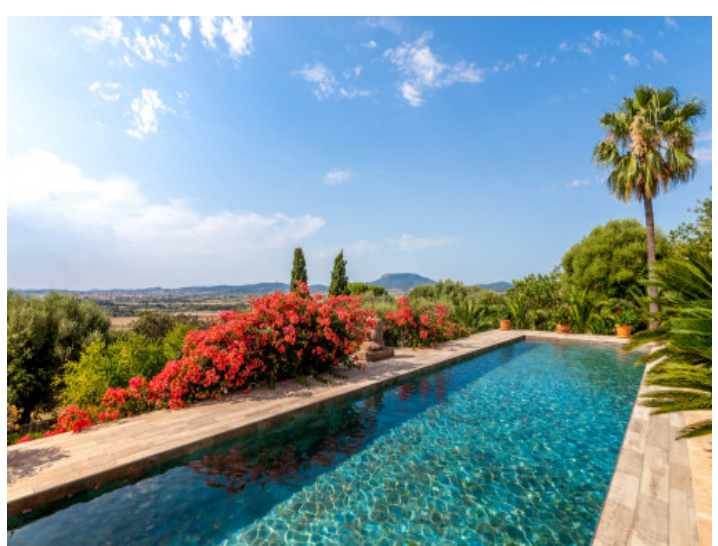
Pool area with a view