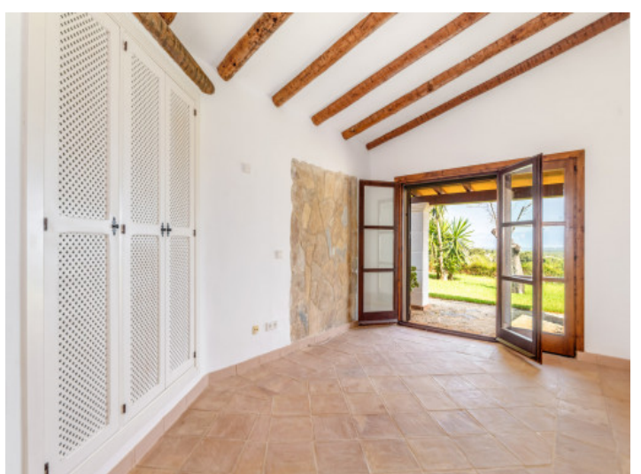
Bedroom with built-in wardrobes