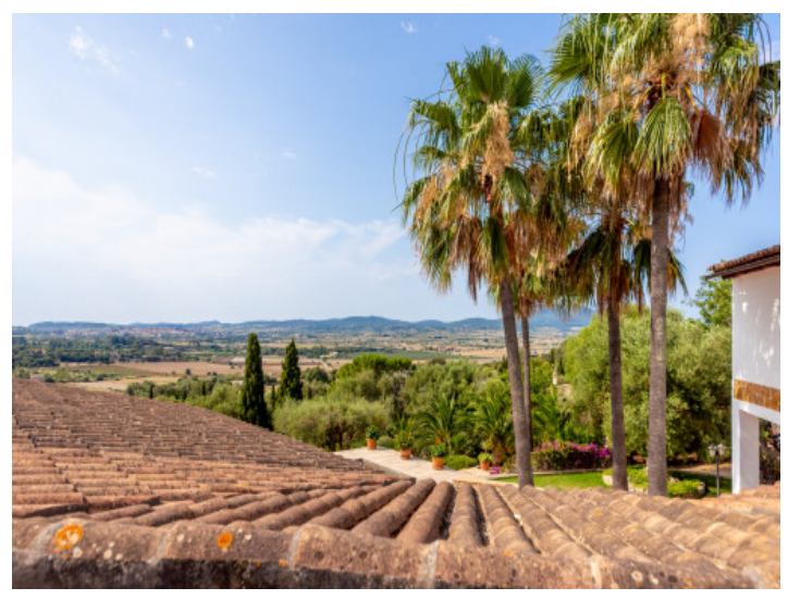
View into the landscape