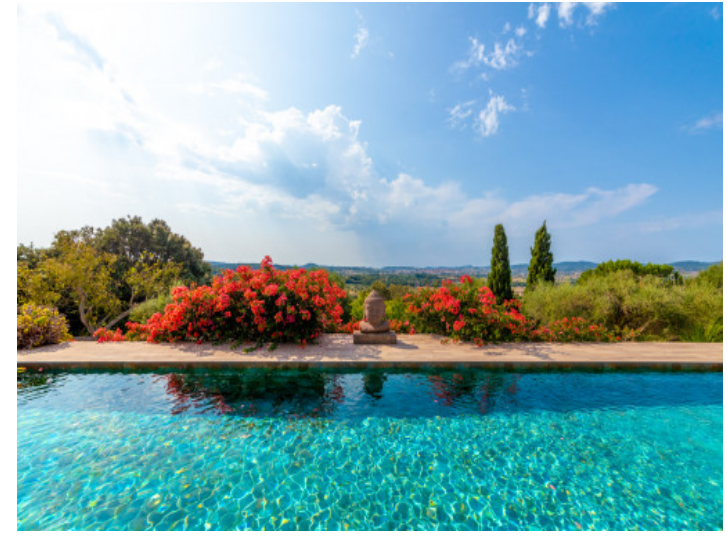
Pool with fantastic landscape views

PORTA MALLORQUINA® Your home. Our passion.