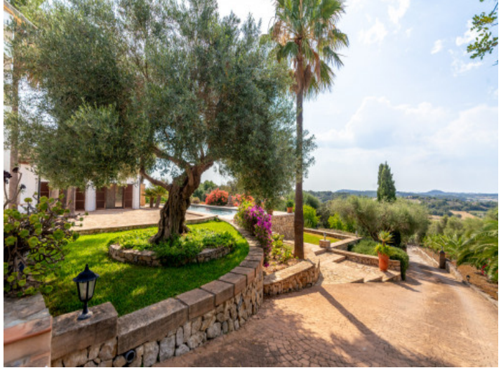
Entrance area All information is correct to the best of our knowledge. Errors and prior sale excepted. This prospectus is purely for information purposes. Only the notarized deed of sale is legally binding.