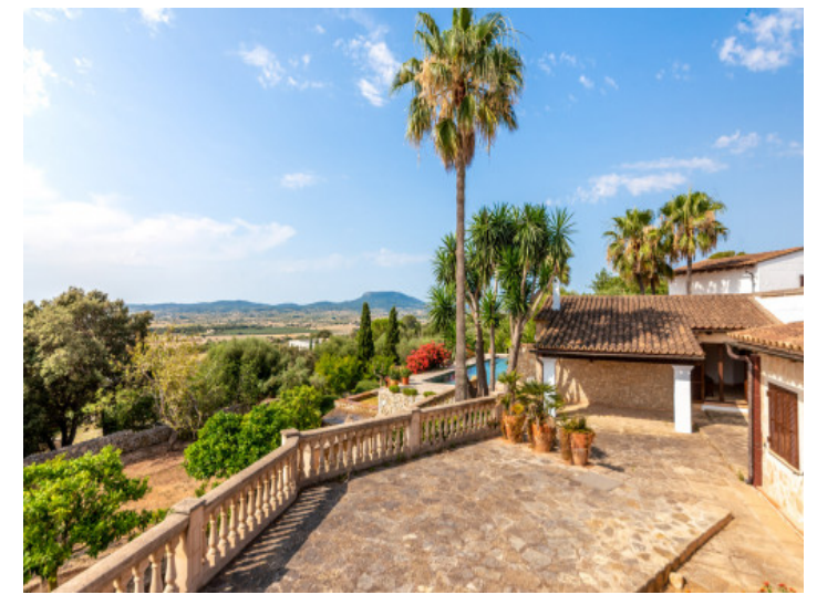
Terrace and landscape views