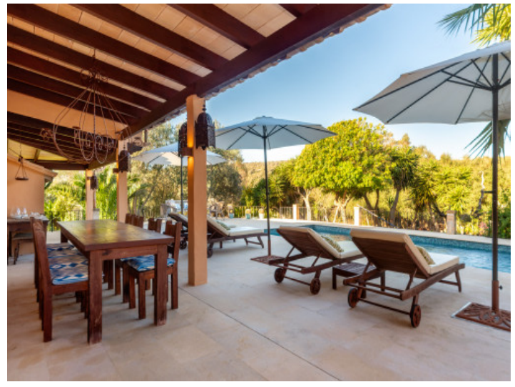
Covered terrace with pool views