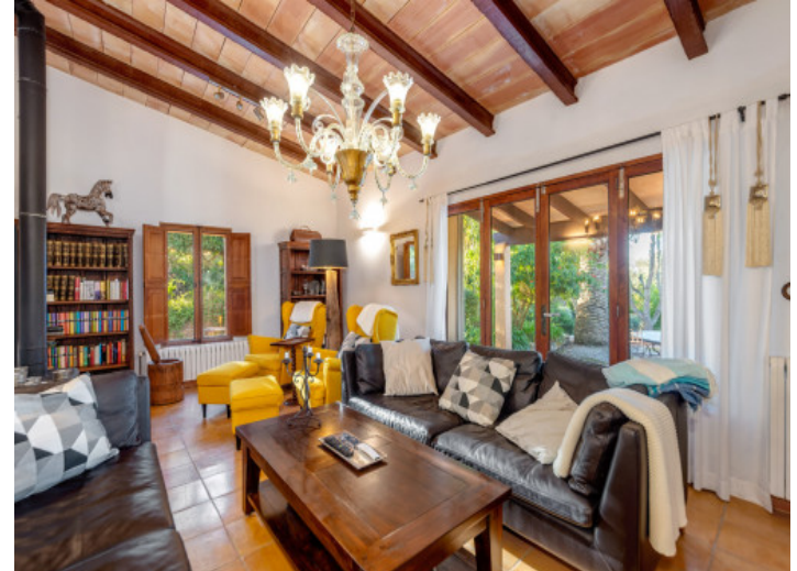
Cosy living area Modern kitchen All information is correct to the best of our knowledge. Errors and prior sale excepted. This prospectus is purely for information purposes. Only the notarized deed of sale is legally binding.

PORTA MALLORQUINA • C./ CONQUISTADOR 8, 07001 PALMA TEL. +34 971 698 242 • INFO@PORTAMALLORQUINA.COM