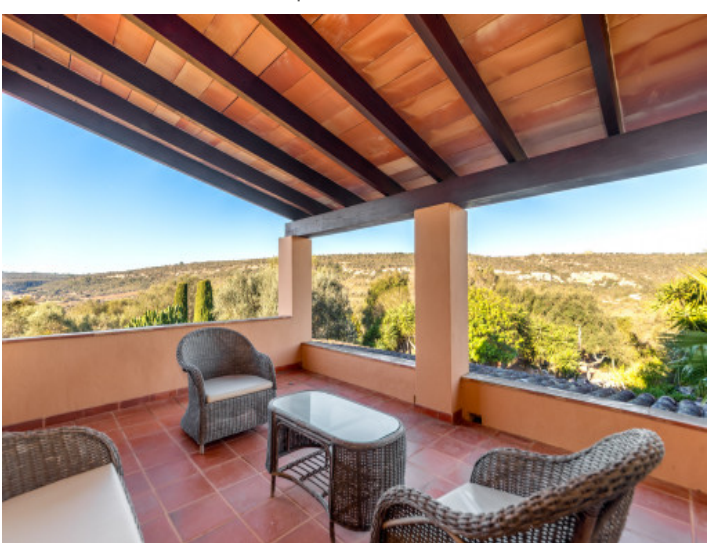
Unique landscape views from the balcony