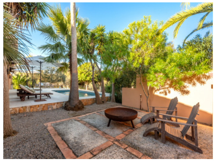
This area invites for cosy nights at the dire bowl

All information is correct to the best of our knowledge. Errors and prior sale excepted. This prospectus is purely for information purposes. Only the notarized deed of sale is legally binding.