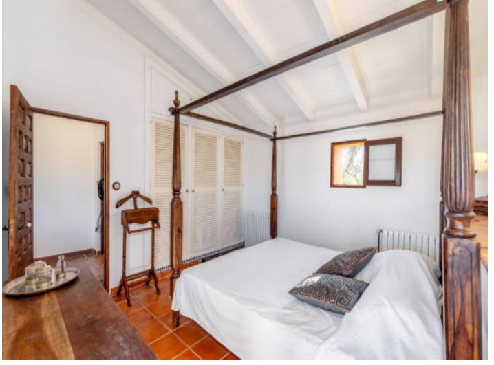
Bedroom with built-in wardrobe