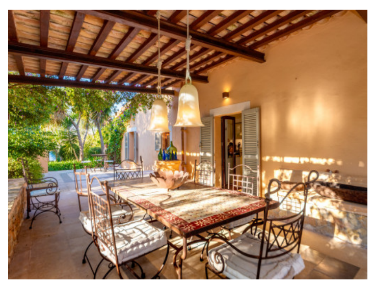
Mallorquin covered terrace