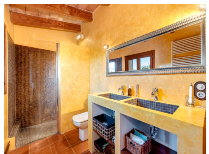
Bathroom with two washbasin Pool is surrounded by a terrace All information is correct to the best of our knowledge. Errors and prior sale excepted. This prospectus is purely for information purposes. Only the notarized deed of sale is legally binding.

PORTA MALLORQUINA • C./ CONQUISTADOR 8, 07001 PALMA TEL. +34 971 698 242 • INFO@PORTAMALLORQUINA.COM