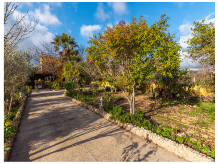
View into the landscape