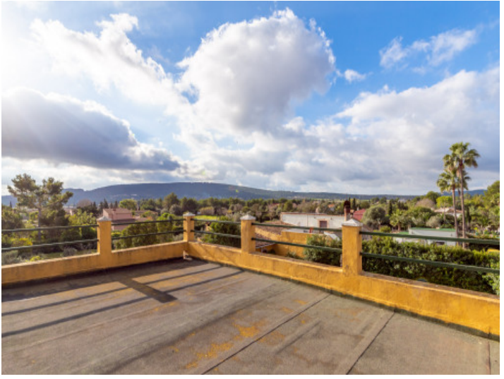
Terrace with a view