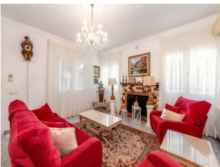
Living area with fire place