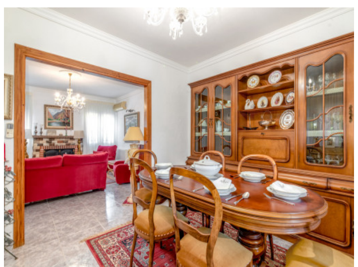
Dining and living area Dining and living area All information is correct to the best of our knowledge. Errors and prior sale excepted. This prospectus is purely for information purposes. Only the notarized deed of sale is legally binding.

PORTA MALLORQUINA • C./ CONQUISTADOR 8, 07001 PALMA TEL. +34 971 698 242 • INFO@PORTAMALLORQUINA.COM