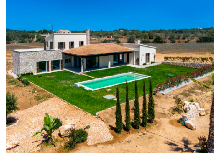
Aerial view to the property