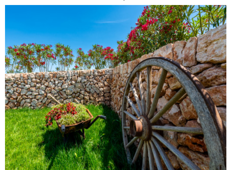
Natural stone walls Living area with fireplace All information is correct to the best of our knowledge. Errors and prior sale excepted. This prospectus is purely for information purposes. Only the notarized deed of sale is legally binding.

PORTA MALLORQUINA • C./ CONQUISTADOR 8, 07001 PALMA TEL. +34 971 698 242 • INFO@PORTAMALLORQUINA.COM