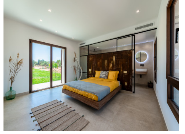
Bedroom on the groundfloor