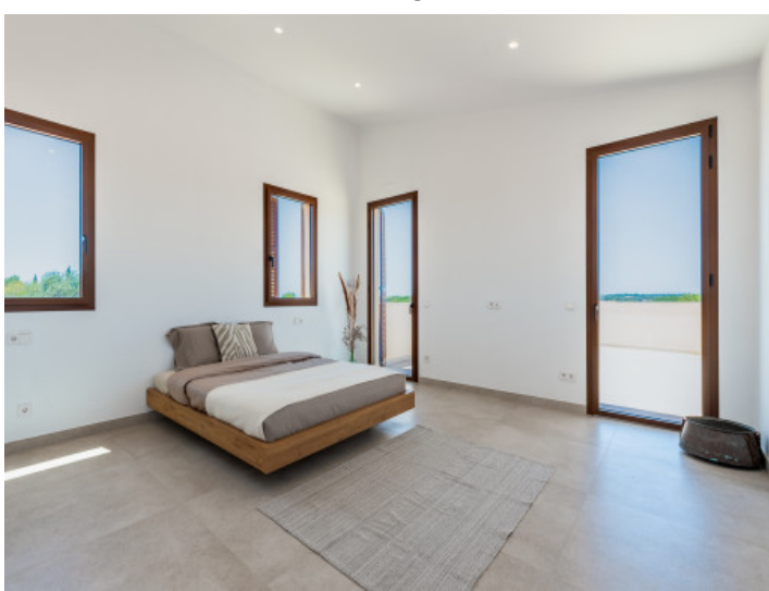
Bedroom on the first floor