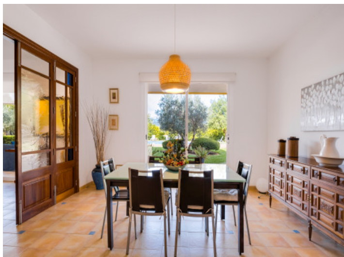
Bright dining area with terrace access