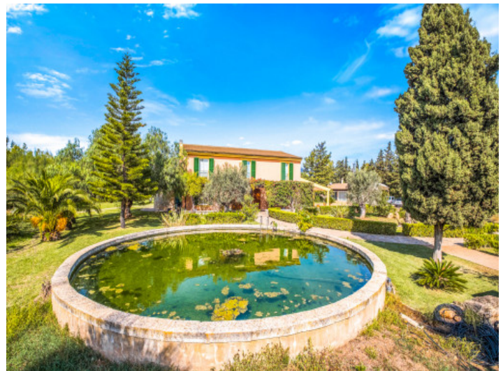
Wonderfully laid-out garden with ponds