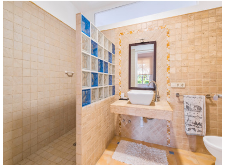
One of 4 bathrooms