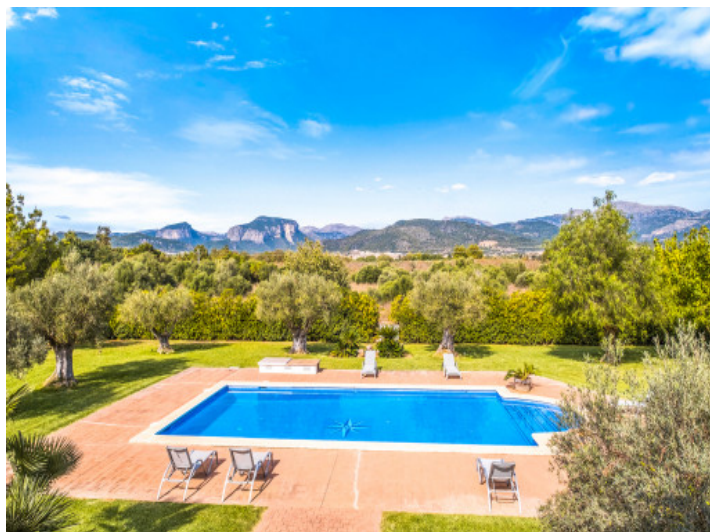
Dreamlike panorama views