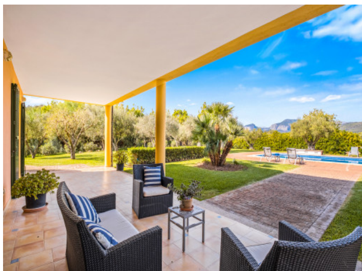
Covered lounge terrace of the living area