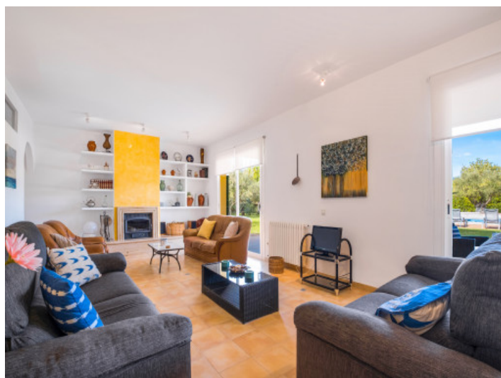
Large, light flooded living area