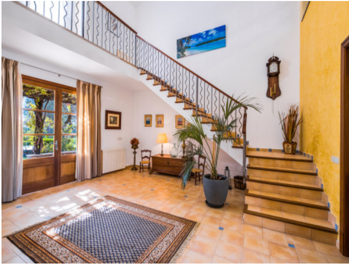
Inviting entrance hall