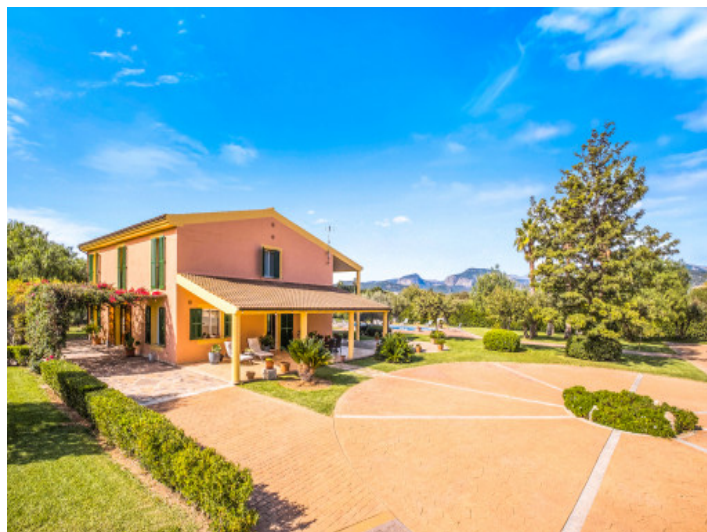
Extensive outdoor area with terraces