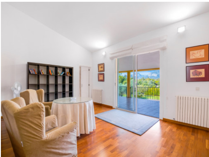
Further living room on the upper floor