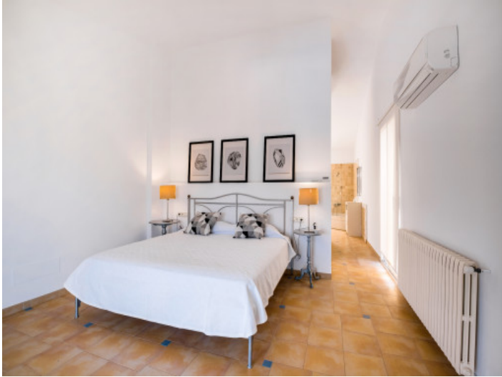
Bedroom with open en suite bathroom