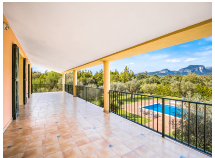
Covered upper terrace with mountain views

All information is correct to the best of our knowledge. Errors and prior sale excepted. This prospectus is purely for information purposes. Only the notarized deed of sale is legally binding.