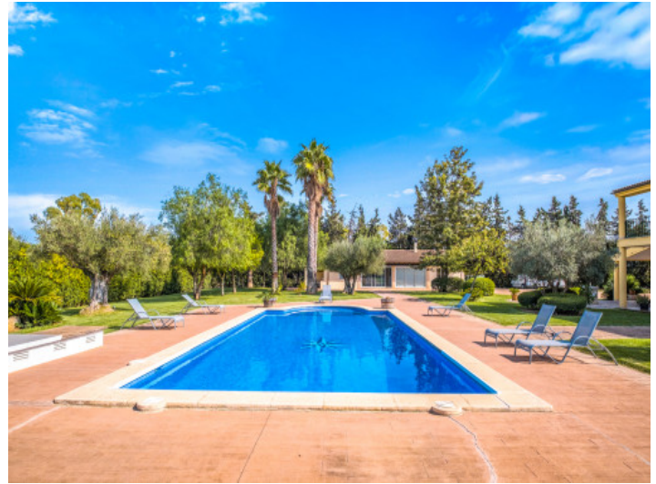
Luxurious, very private pool area