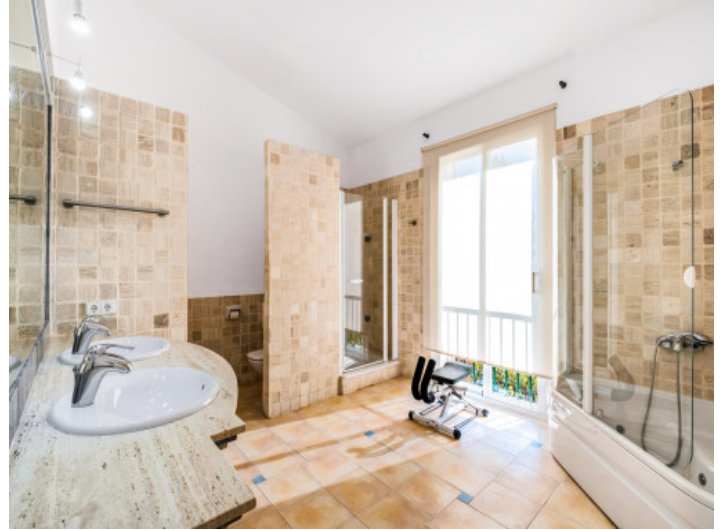
Modern en suite bathroom