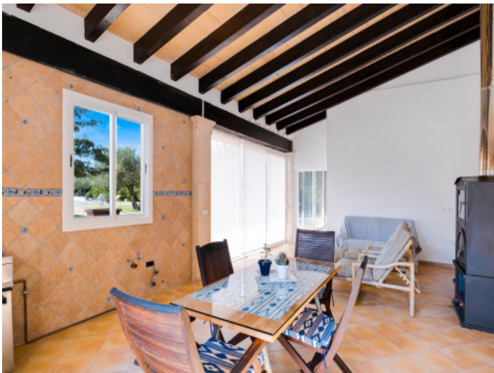
Separate guest house