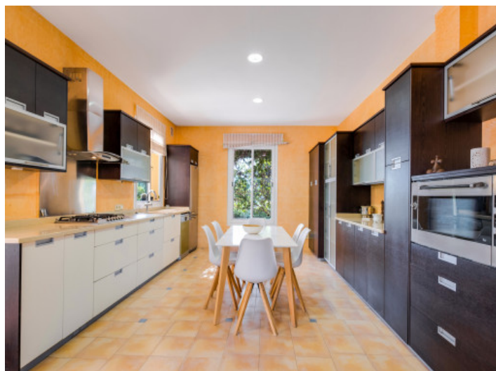
Large, modern kitchen

All information is correct to the best of our knowledge. Errors and prior sale excepted. This prospectus is purely for information purposes. Only the notarized deed of sale is legally binding.