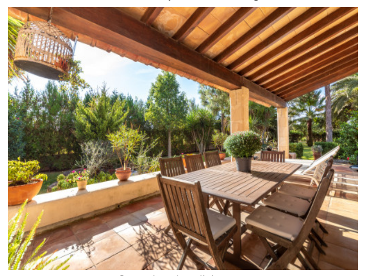
Covered outdoor dining area