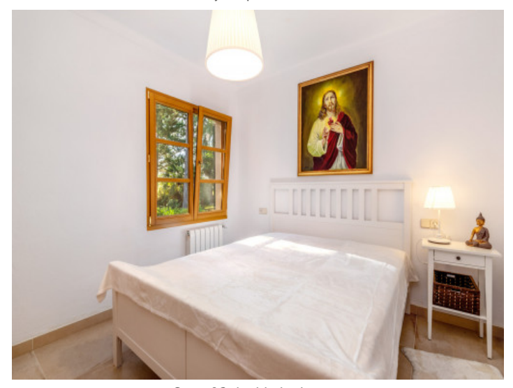
One of 2 double bedrooms