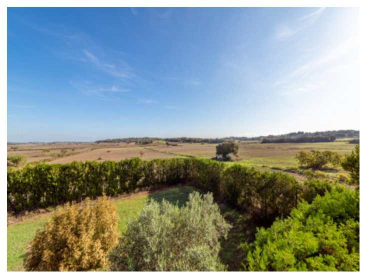
Wonderful sweeping views