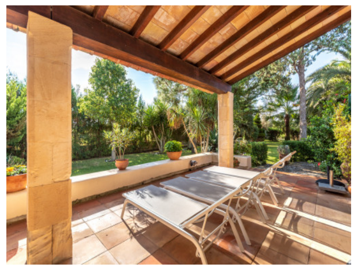
Idyllic sun terrace