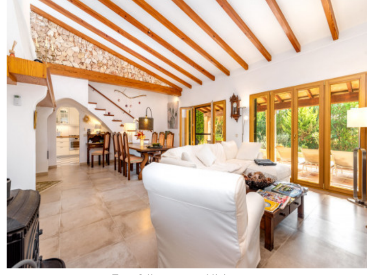
Tastefully renovated living area

All information is correct to the best of our knowledge. Errors and prior sale excepted. This prospectus is purely for information purposes. Only the notarized deed of sale is legally binding.