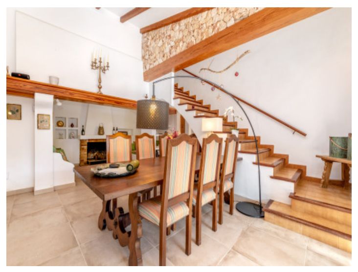
Dining area and access to the upper floor