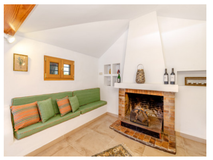
Cozy fireplace corner