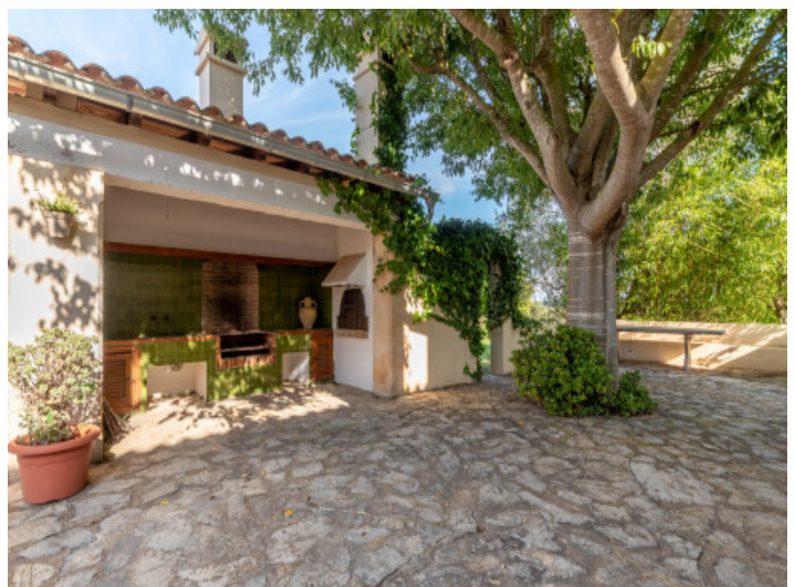
Covered bbg terrace