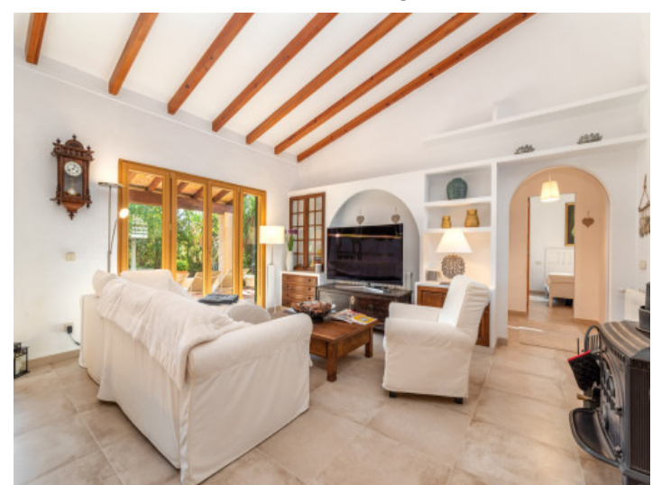
Lightflooded living area with terrace access