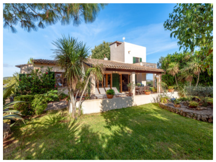
Finca surrounded by a mediterranean garden