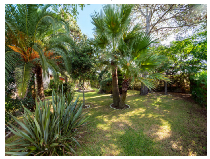
Wonderful garden with palm trees