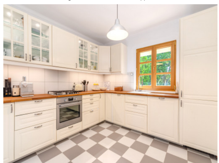
Modern kitchen in white