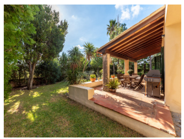
Enchanting terrace and garden