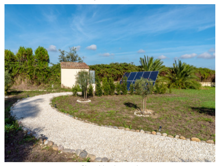
Plot with solar panel