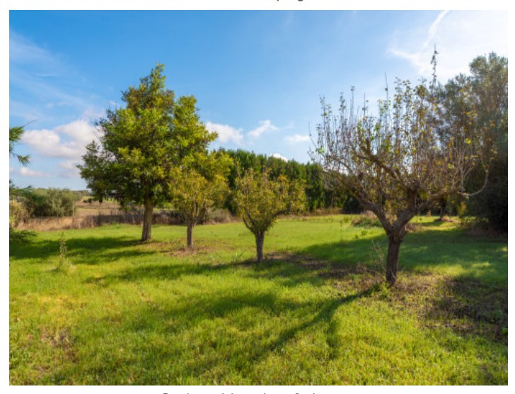
Garden with various fruit trees