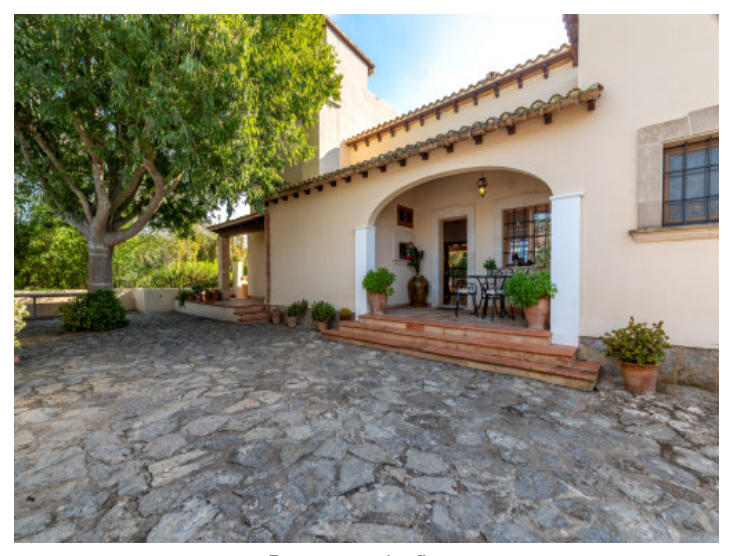
Entrance to the finca

All information is correct to the best of our knowledge. Errors and prior sale excepted. This prospectus is purely for information purposes. Only the notarized deed of sale is legally binding.