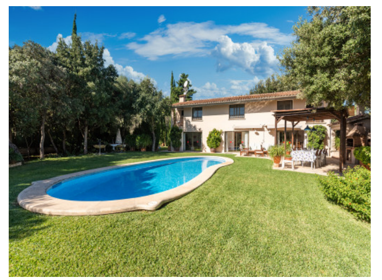
Exterior view and pool Beautiful fountain All information is correct to the best of our knowledge. Errors and prior sale excepted. This prospectus is purely for information purposes. Only the notarized deed of sale is legally binding.

PORTA MALLORQUINA • C./ CONQUISTADOR 8, 07001 PALMA TEL. +34 971 698 242 • INFO@PORTAMALLORQUINA.COM