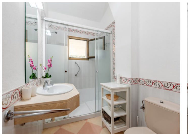
One of 3 bathrooms One of 3 bathrooms All information is correct to the best of our knowledge. Errors and prior sale excepted. This prospectus is purely for information purposes. Only the notarized deed of sale is legally binding.

PORTA MALLORQUINA • C./ CONQUISTADOR 8, 07001 PALMA TEL. +34 971 698 242 • INFO@PORTAMALLORQUINA.COM