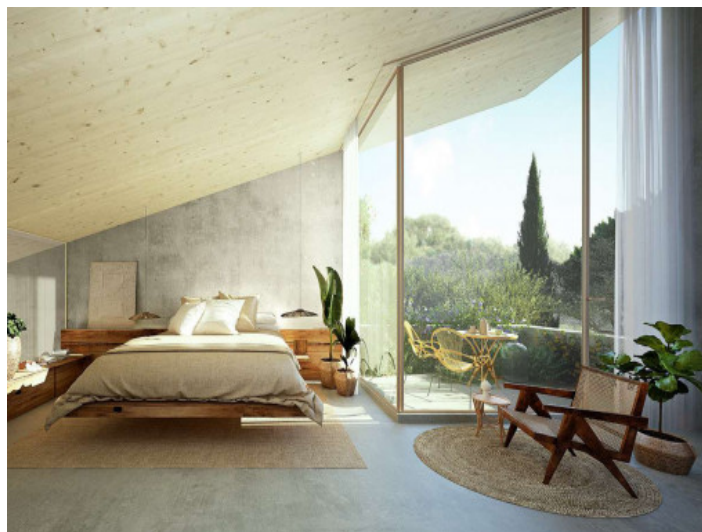
Large window fronts of the master bedroom on the upper floor