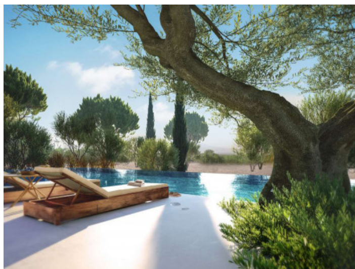
Oasis-like ambience. surrounding the pool