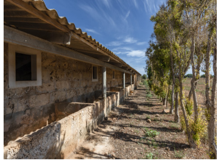
Exterior view of the property

PORTA MALLORQUINA® Your home. Our passion.