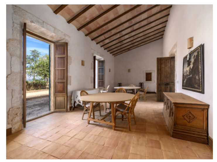
Living area Living area All information is correct to the best of our knowledge. Errors and prior sale excepted. This prospectus is purely for information purposes. Only the notarized deed of sale is legally binding.