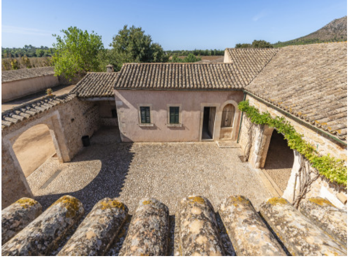
View of the patio