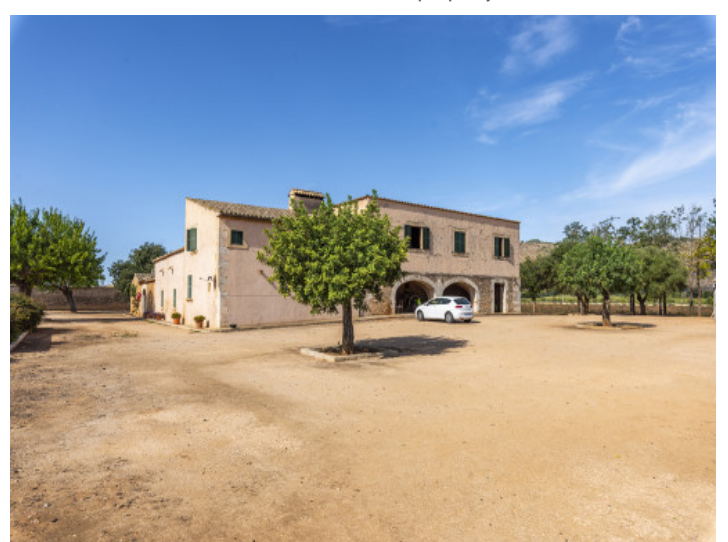
Exterior view of the property Exterior view of the property All information is correct to the best of our knowledge. Errors and prior sale excepted. This prospectus is purely for information purposes. Only the notarized deed of sale is legally binding.