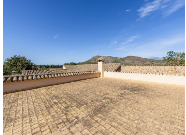
Sunny roof terrace