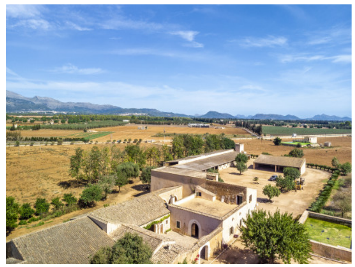
Exterior view of the property