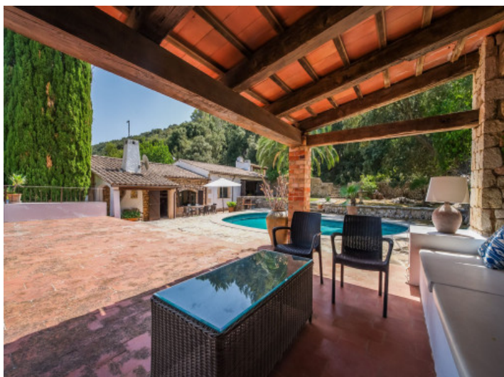
Pool area with cozy seating