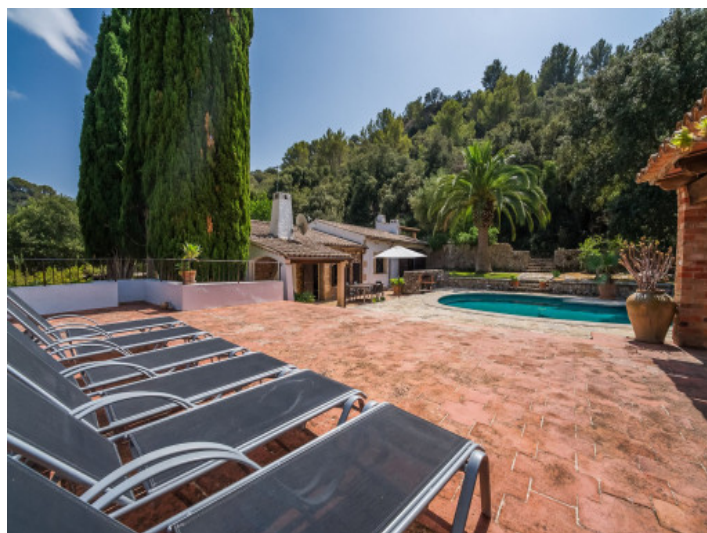
Large pool area with sun loungers

All information is correct to the best of our knowledge. Errors and prior sale excepted. This prospectus is purely for information purposes. Only the notarized deed of sale is legally binding.