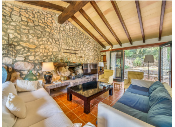
Living area with access to a terrace