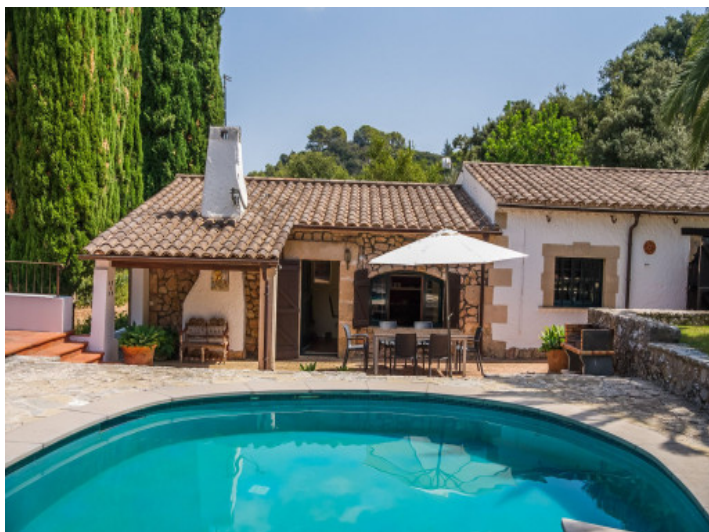
View of the finca with pool