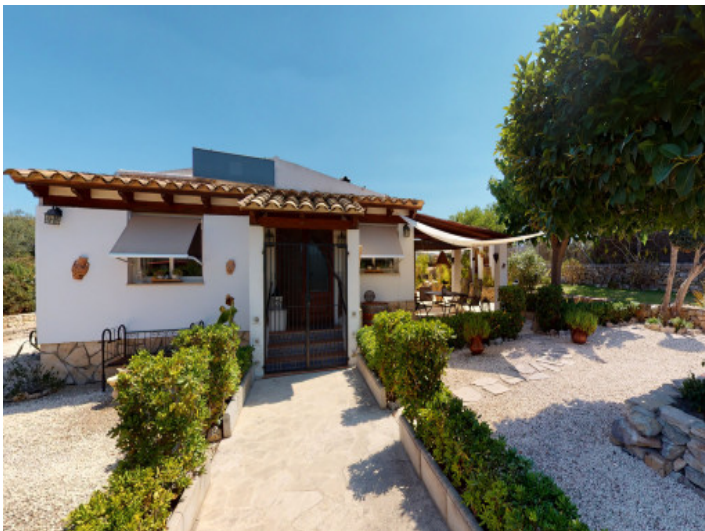
Front view of the house