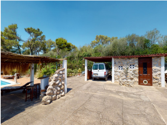
Covered parking space