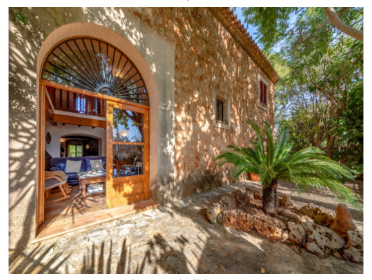
Access to the living area