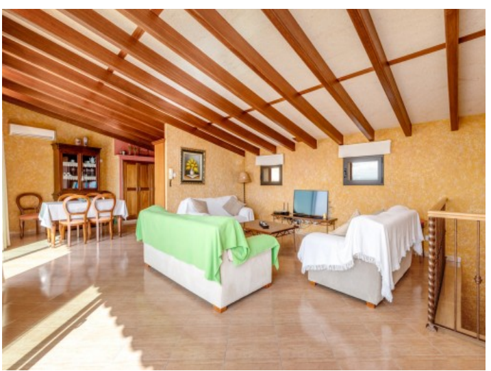
Living and dining area Open kitchen integrating the dining area All information is correct to the best of our knowledge. Errors and prior sale excepted. This prospectus is purely for information purposes. Only the notarized deed of sale is legally binding.