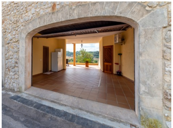
Sunny terrace with views to the countryside