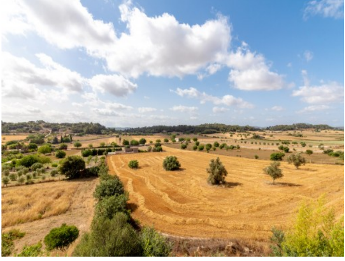
Views from the house

All information is correct to the best of our knowledge. Errors and prior sale excepted. This prospectus is purely for information purposes. Only the notarized deed of sale is legally binding.