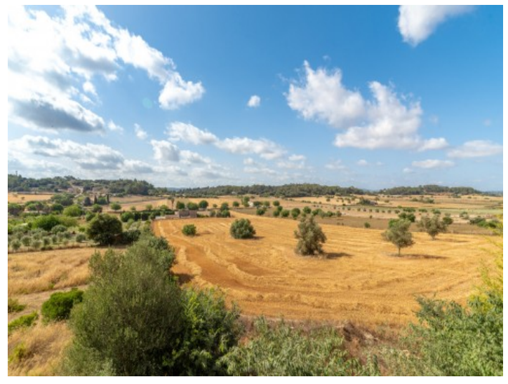
Views to the countryside