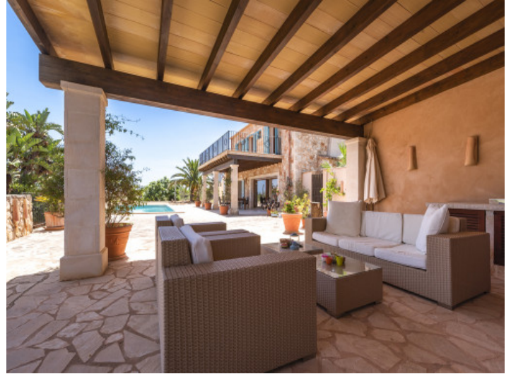
Covered chill out area