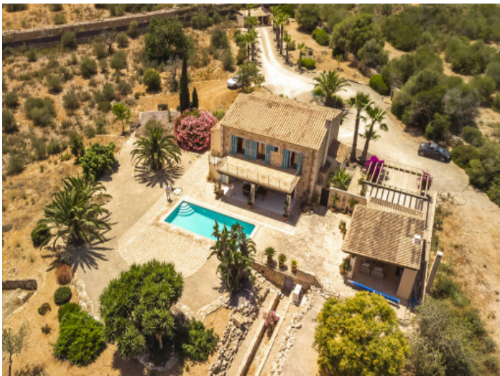
The finca from a birds-eye view