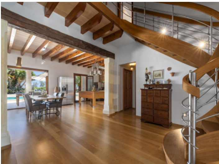
Open living area and floor