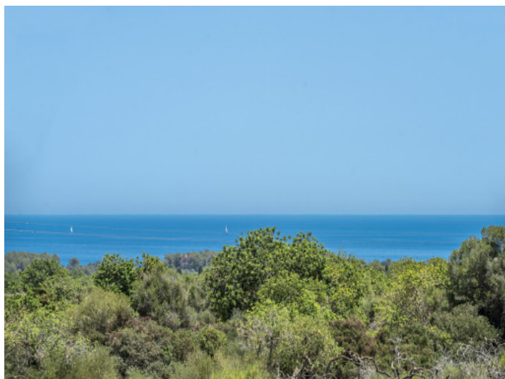
View to the sea