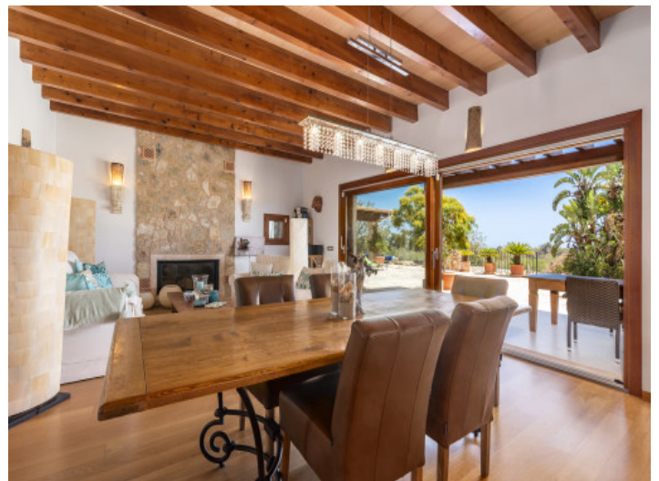
Dining and living area

All information is correct to the best of our knowledge. Errors and prior sale excepted. This prospectus is purely for information purposes. Only the notarized deed of sale is legally binding.