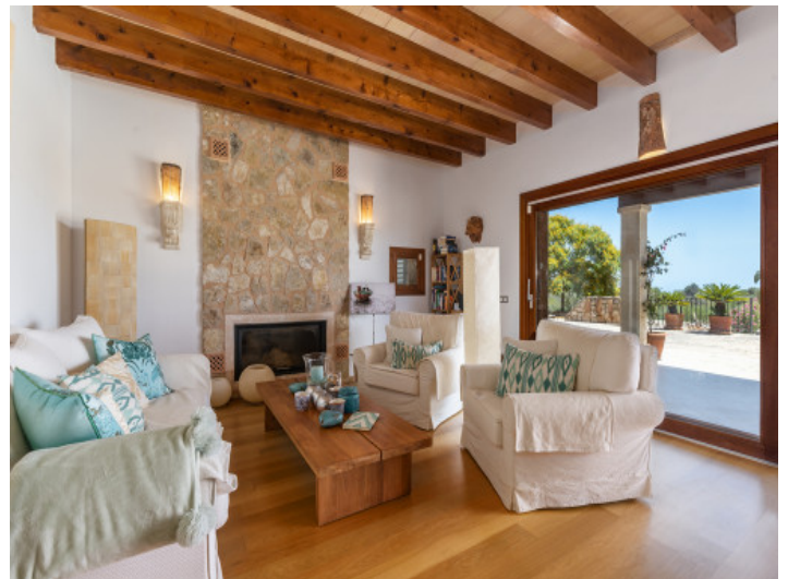
Cozy living area