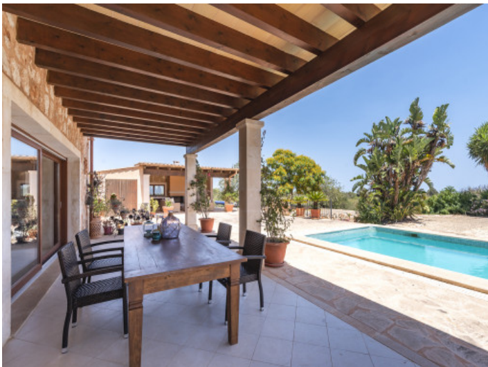
Dining area by the pool