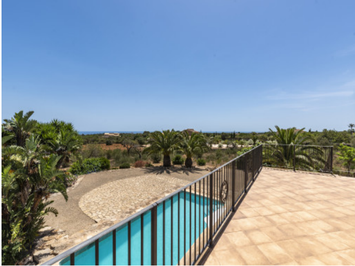
Romantic finca with pool in S'Espinagar