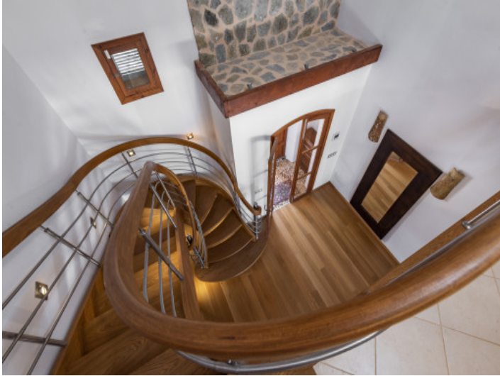
Spacious entrance area