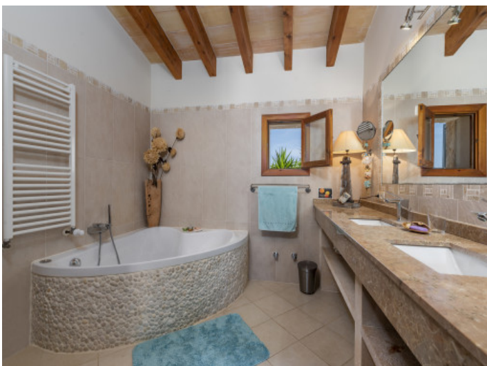
Bathroom with bath tub