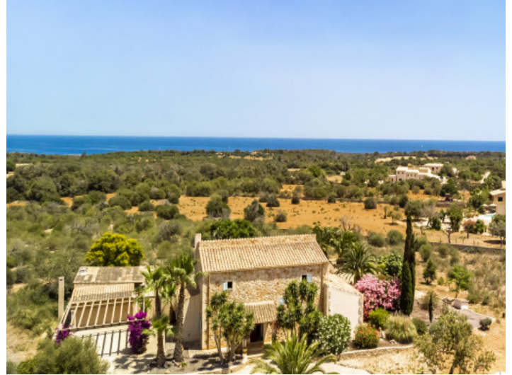
Close to the sea