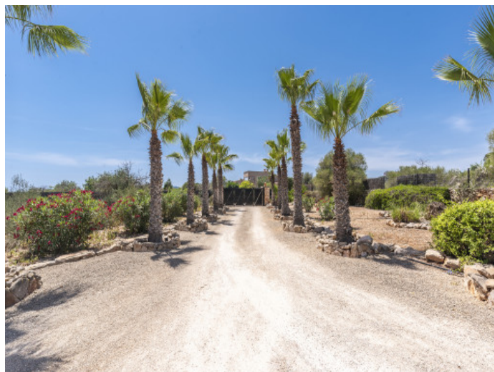
Access to the finca