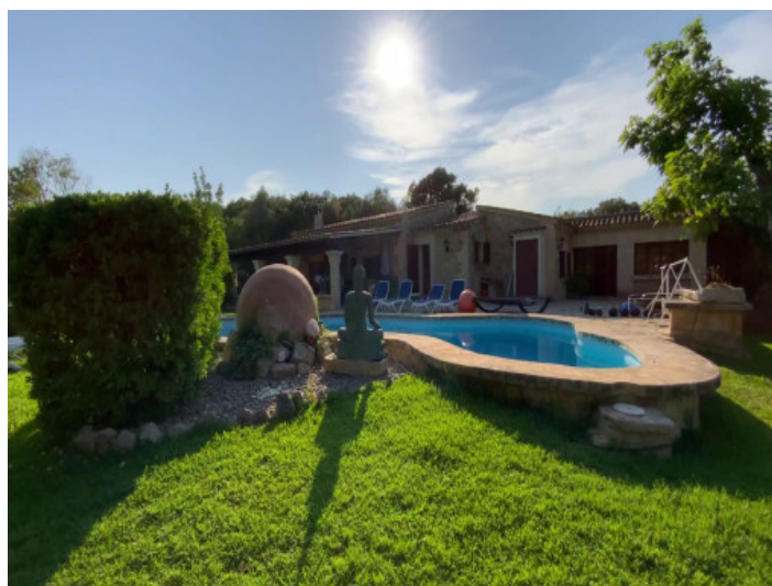
View to the pool