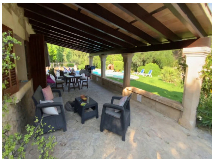
Large covered terrace