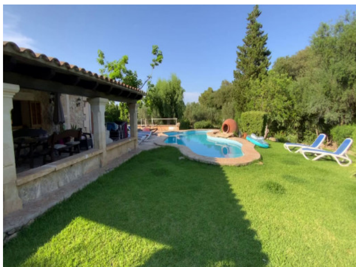
With holiday rental license