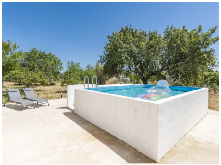
Pool and sun terrace