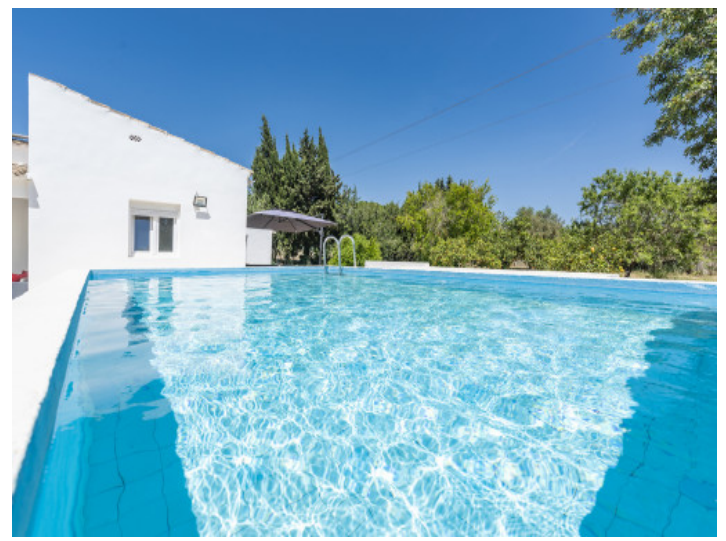
Sunny 6 x 4 metre pool