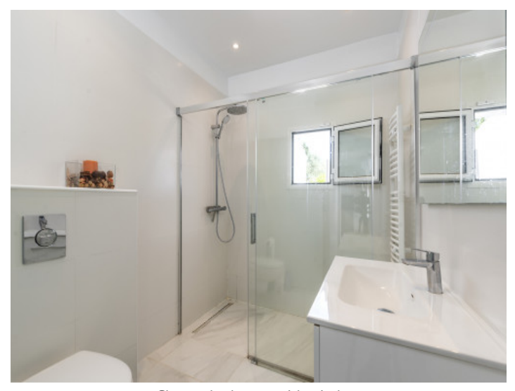
Shower bathroom with window