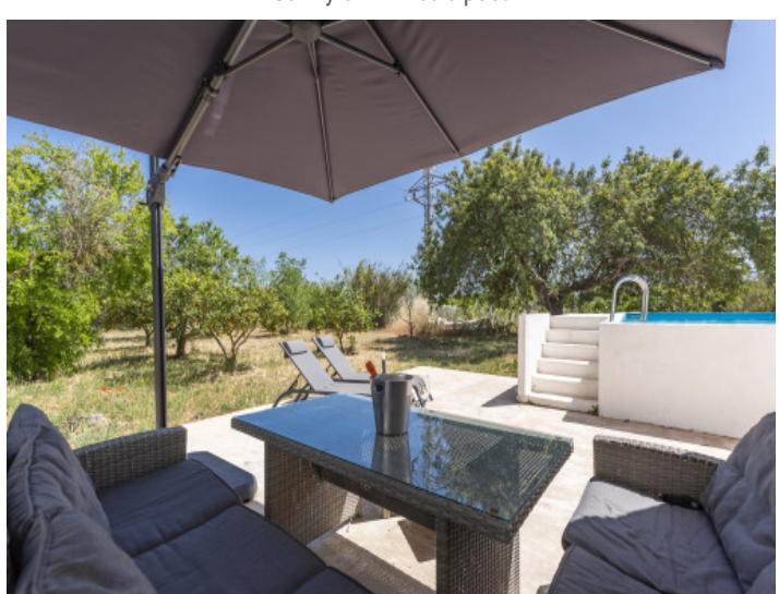
Lounge area next to the pool