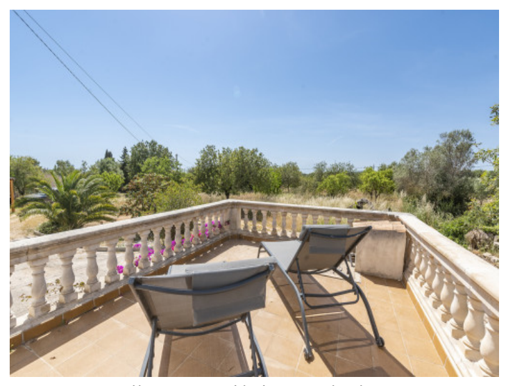
Upper terrace with views over the plot

All information is correct to the best of our knowledge. Errors and prior sale excepted. This prospectus is purely for information purposes. Only the notarized deed of sale is legally binding.