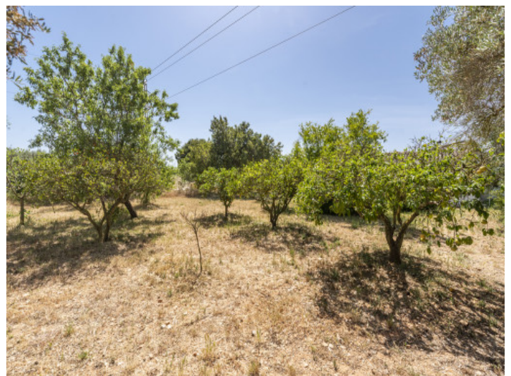
Plot with various trees