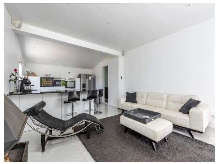
Bright, open living area