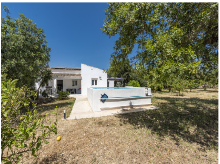
View of the finca with pool