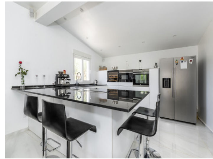
Modern kitchen in white