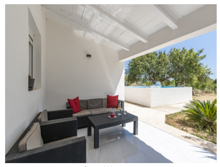
Covered bbq terrace