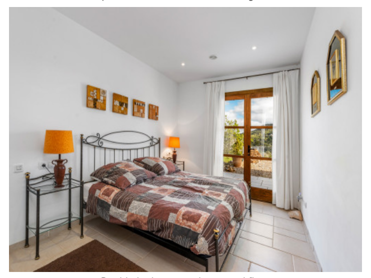
Double bedroom on the ground floor