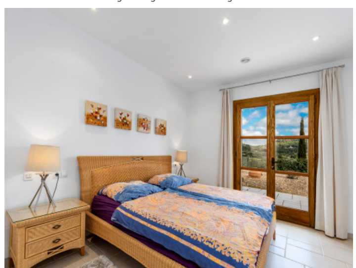
Further ground floor bedroom