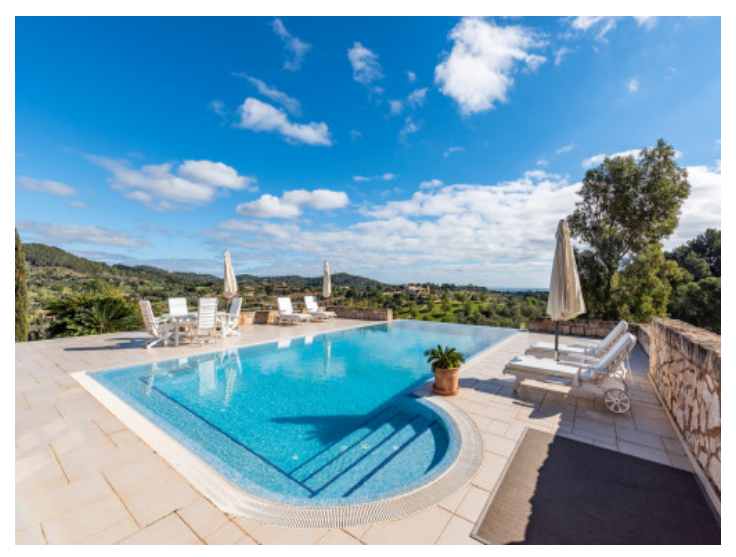
Sunny pool area