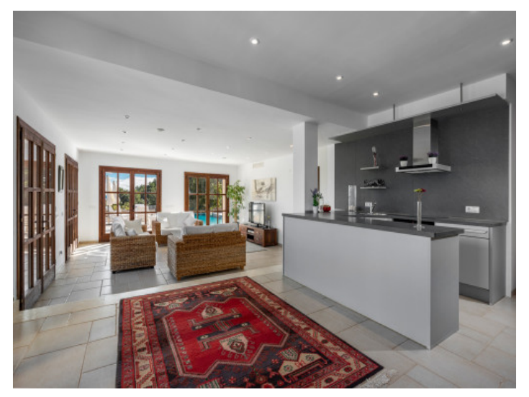
Open, modern kitchen in the living area