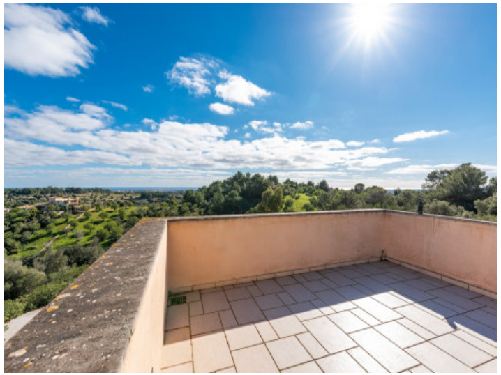
Sunny roof terrace