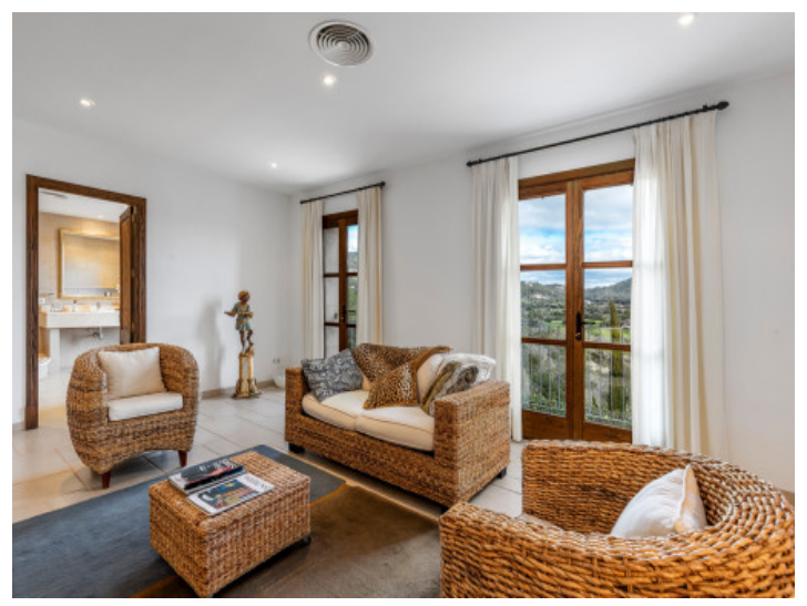
Master suite with lounge area