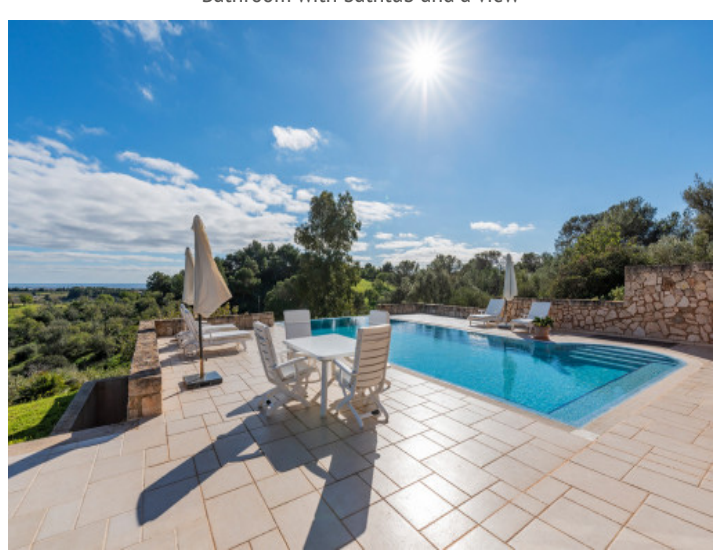
Pool area with absolute privacy