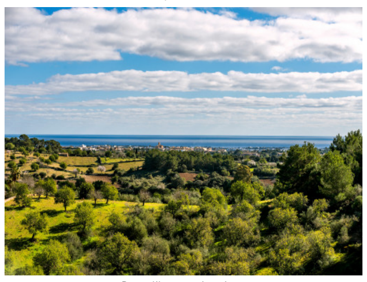
Dreamlike sweeping views