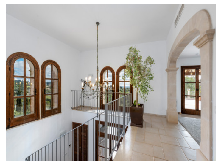
Elegant access to the upper floor