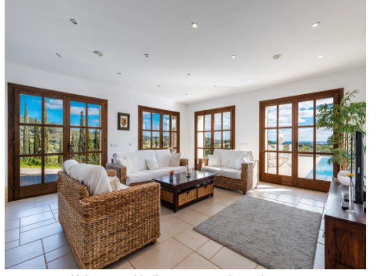
Living area with direct access to the pool terrace