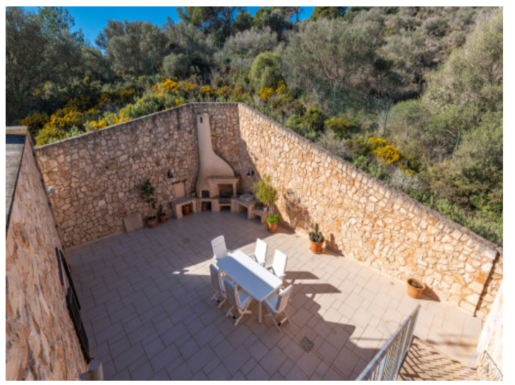
View into the indoor patio