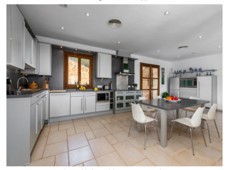
Large kitchen with access to a patio