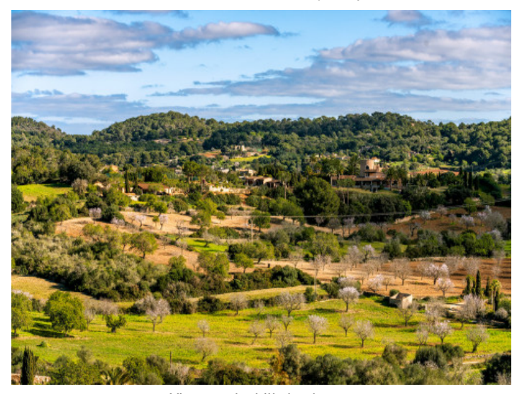
Views to the hilly landscape