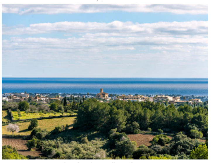
Stunning views as far as the sea