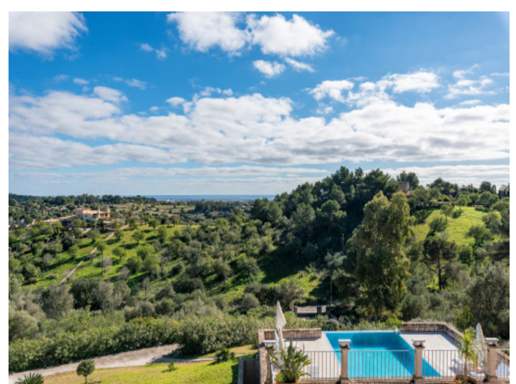
Enchanting panoramic views over the landscape