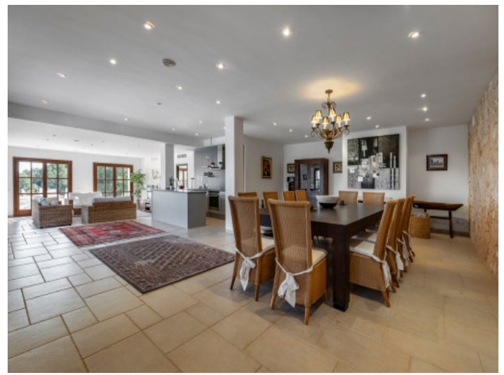
Large living area with dining area