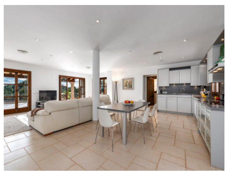
Open kitchen and dining area