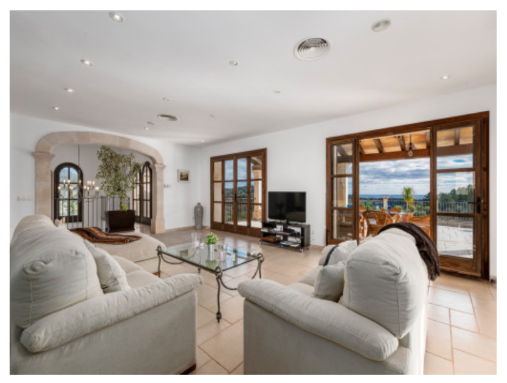
Generous living area on the upper floor