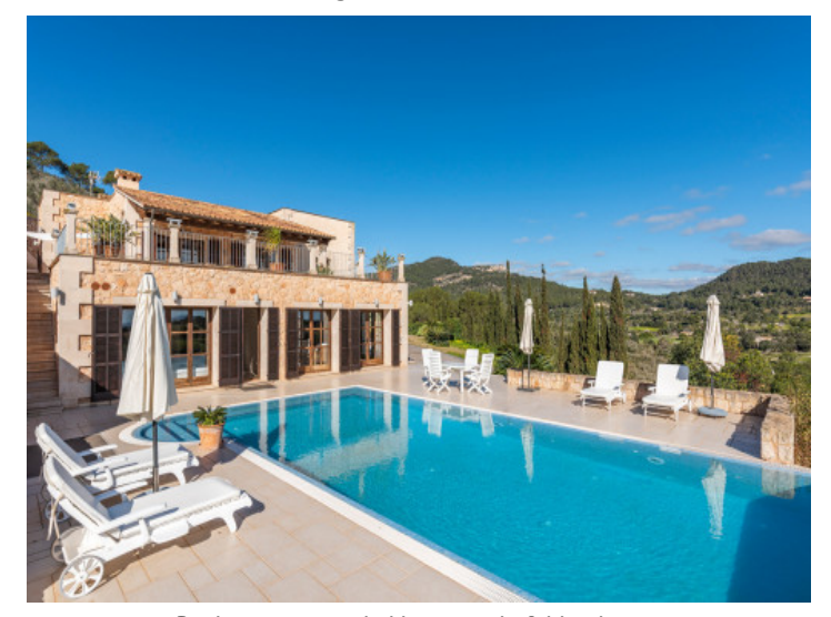
Pool area surrounded by a wonderful landscape