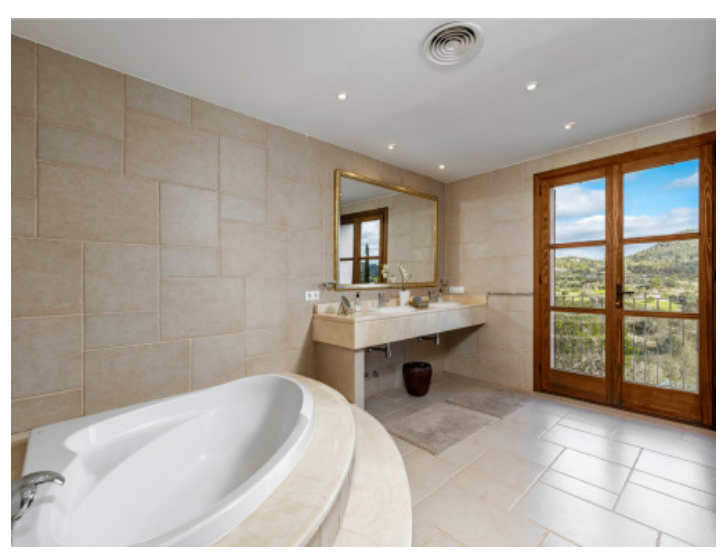
Bathroom with bathtub and a view