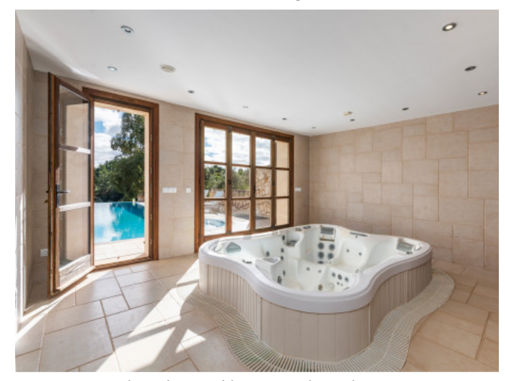
Jacuzzi room with access ot the pool area