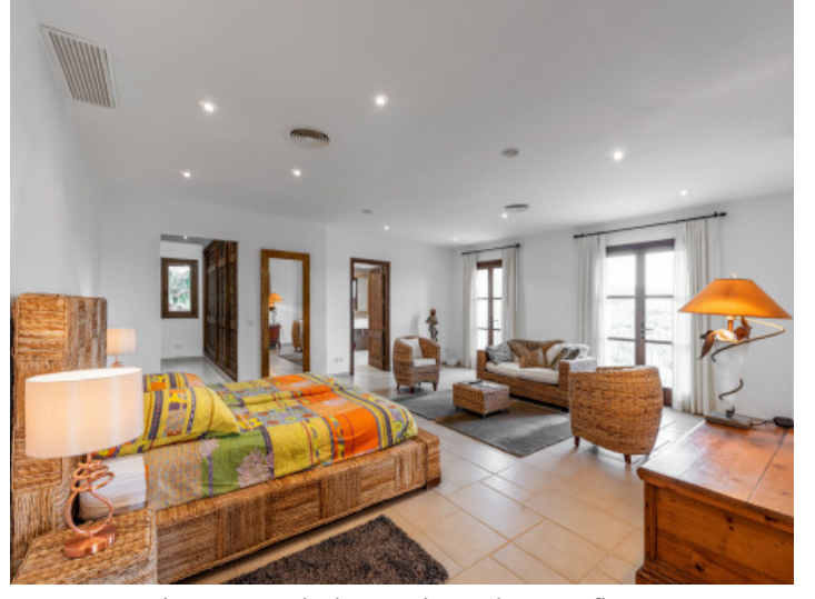
Large master bedroom suite on the upper floor