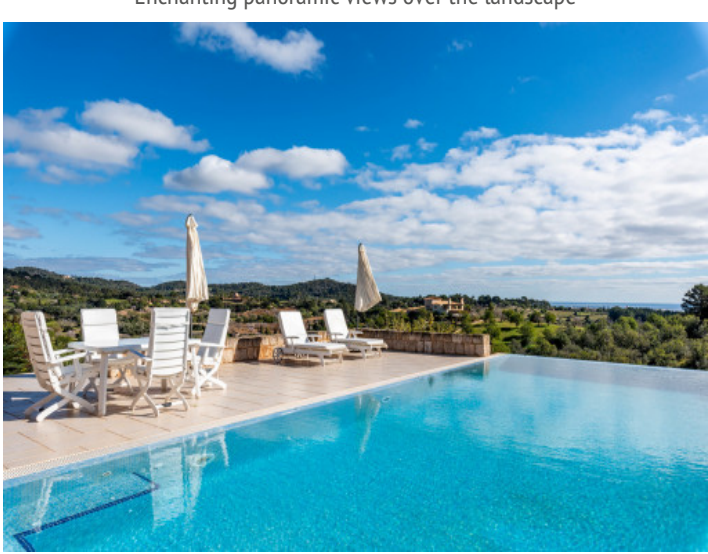
Infinity pool with views as far as the sea