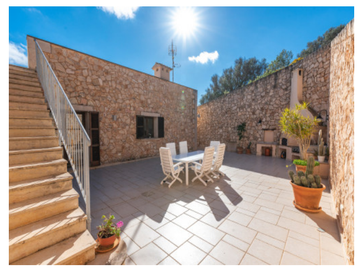
Mallorcan patio with bbq area