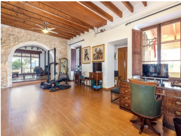
Spacious office / gym area