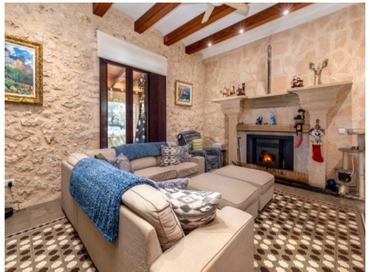
Cozy living area with fire place