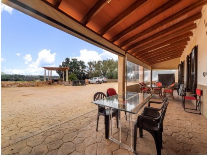
Covered sitting area