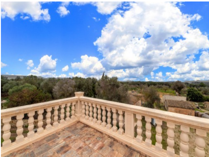
Idyllic landscape views