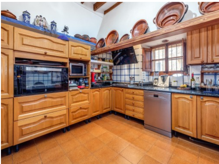
Fully equipped wooden kitchen