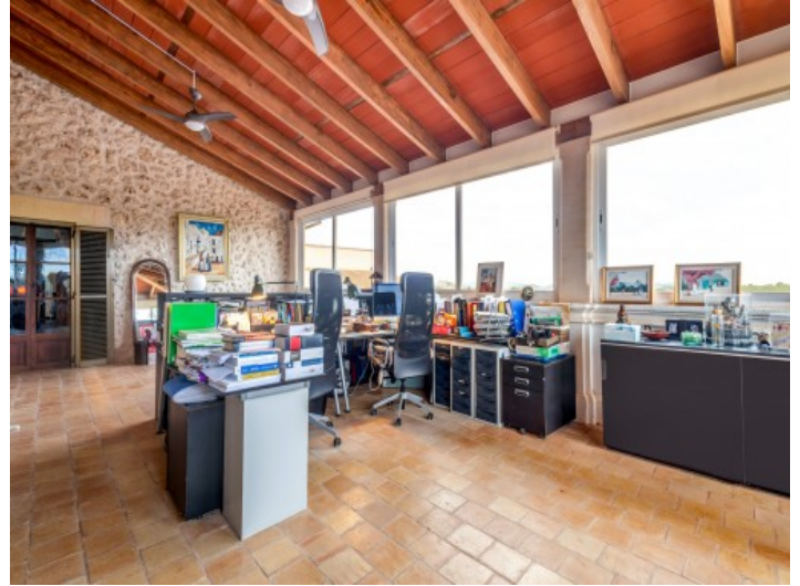
Light flooded office area