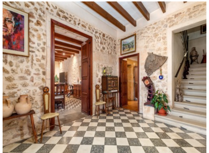
View of the floor