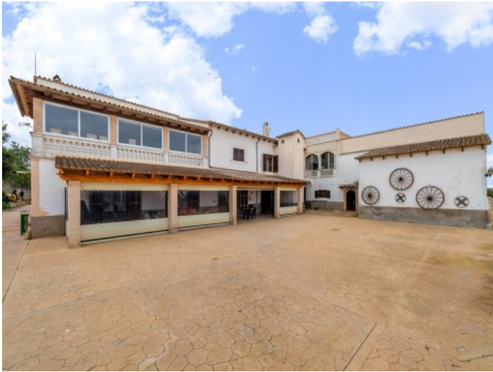
Exterior view and large outdoor area