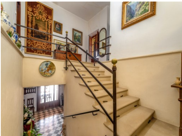
View of the floor