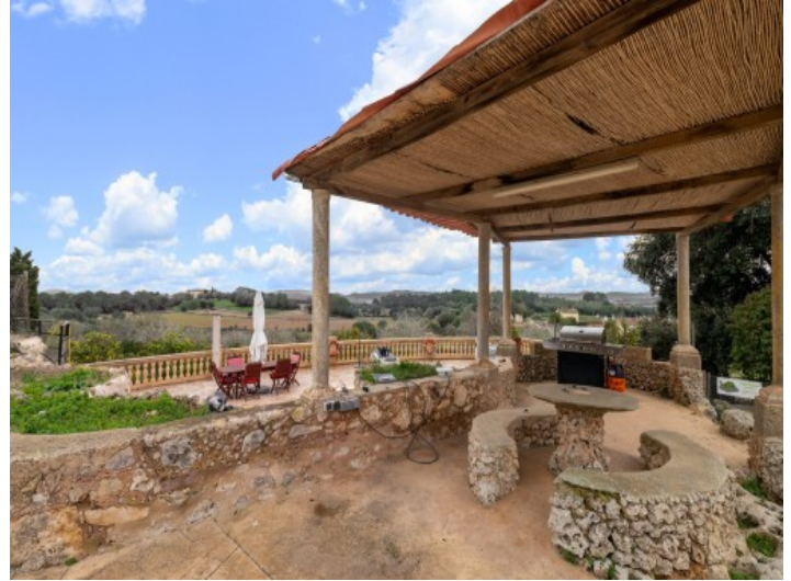
Fantastic barbecue area