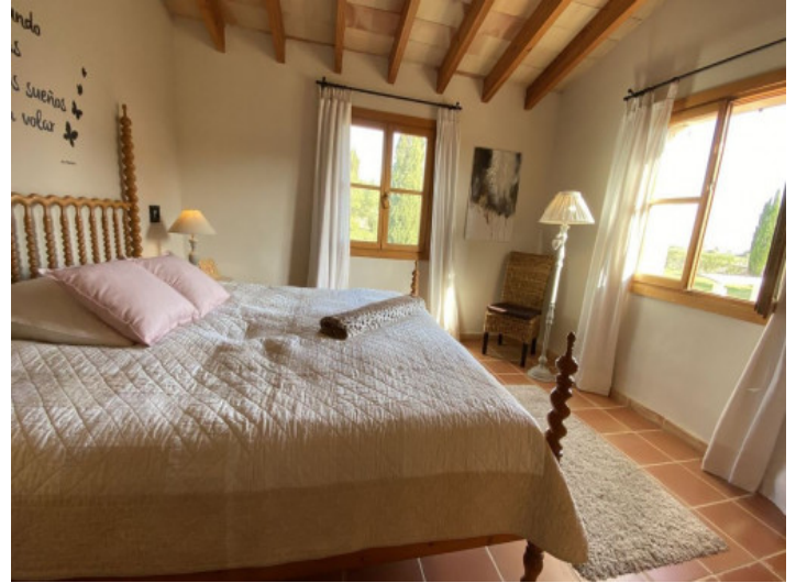
One of 11 bedrooms