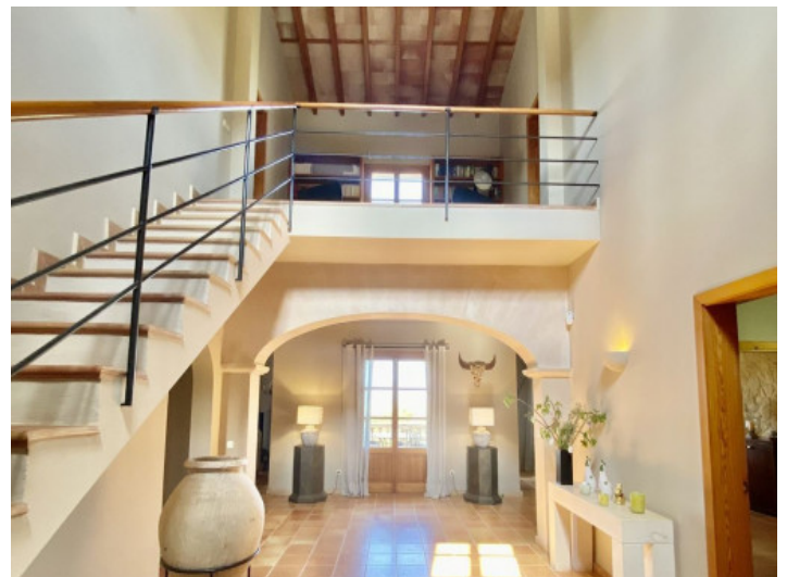
Impressive entrance area

All information is correct to the best of our knowledge. Errors and prior sale excepted. This prospectus is purely for information purposes. Only the notarized deed of sale is legally binding.