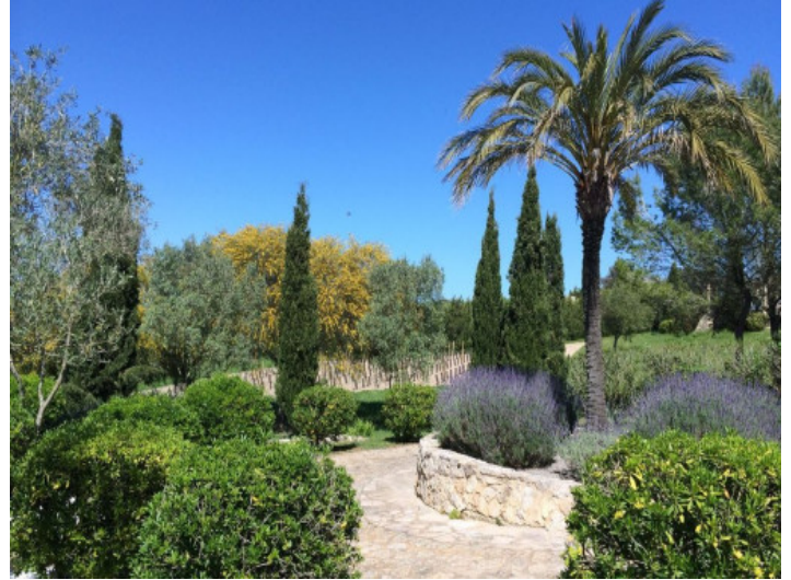
View of the garden