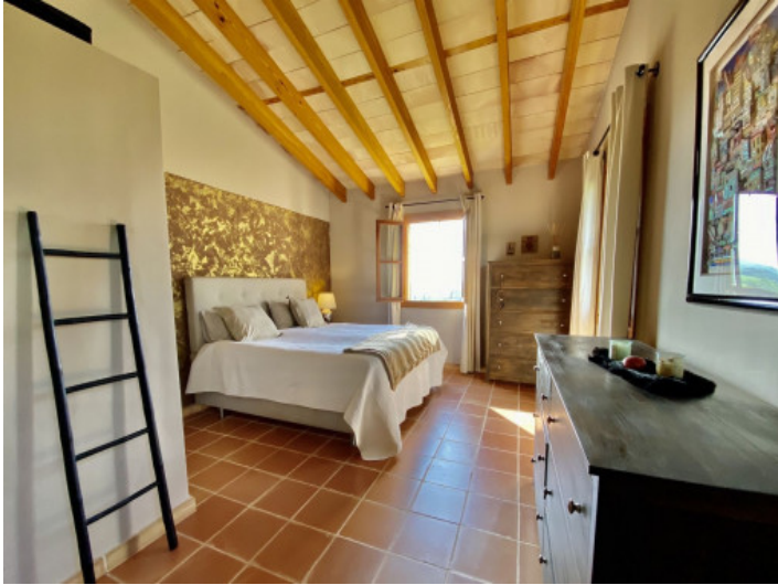
Noble double bedroom