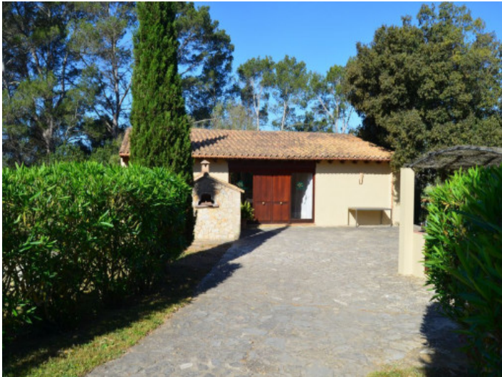
View of the garden