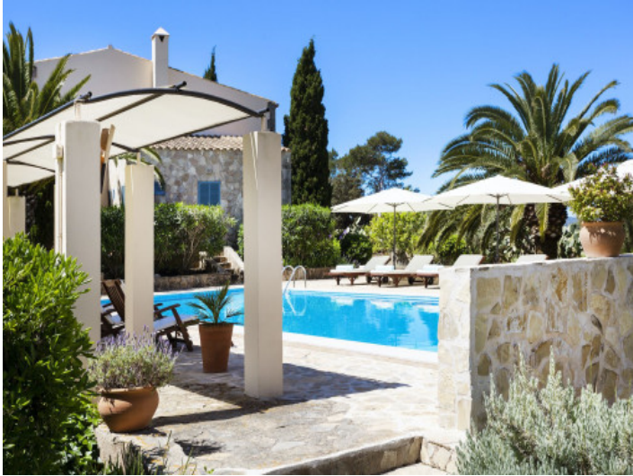
Inviting pool area with sun loungers