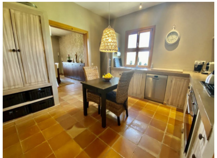
View of the kitchen

All information is correct to the best of our knowledge. Errors and prior sale excepted. This prospectus is purely for information purposes. Only the notarized deed of sale is legally binding.