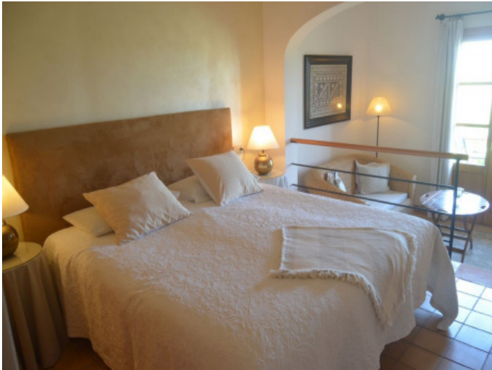
One of 11 bedrooms