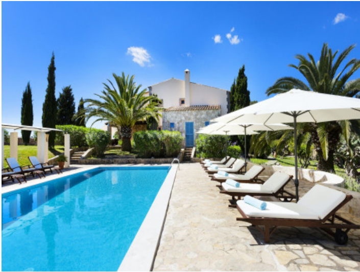
Inviting pool area with sun loungers