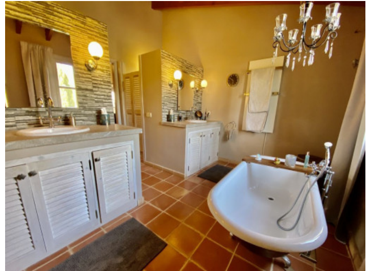
Bathroom with bath tub