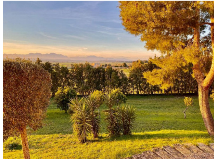
Idyllic landscape views

All information is correct to the best of our knowledge. Errors and prior sale excepted. This prospectus is purely for information purposes. Only the notarized deed of sale is legally binding.