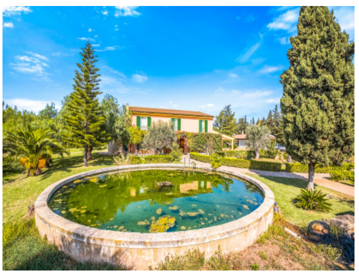
Wonderfully laid-out garden with ponds

All information is correct to the best of our knowledge. Errors and prior sale excepted. This prospectus is purely for information purposes. Only the notarized deed of sale is legally binding.