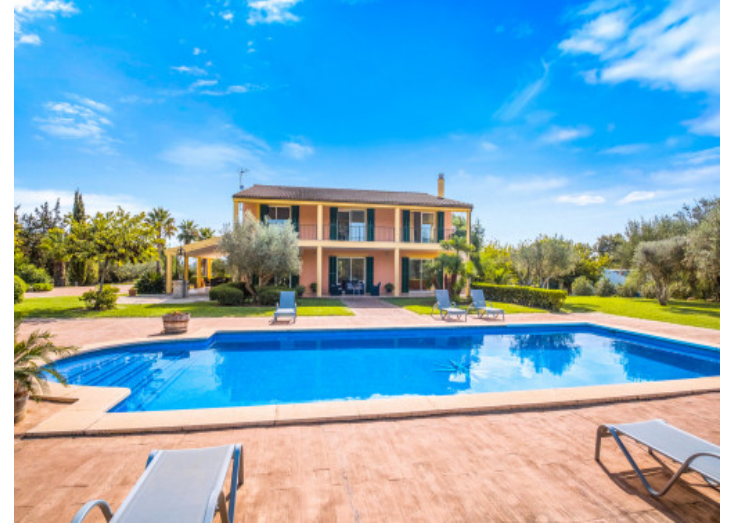
Exterior view and beautiful pool area

PORTA MALLORQUINA® Your home. Our passion.