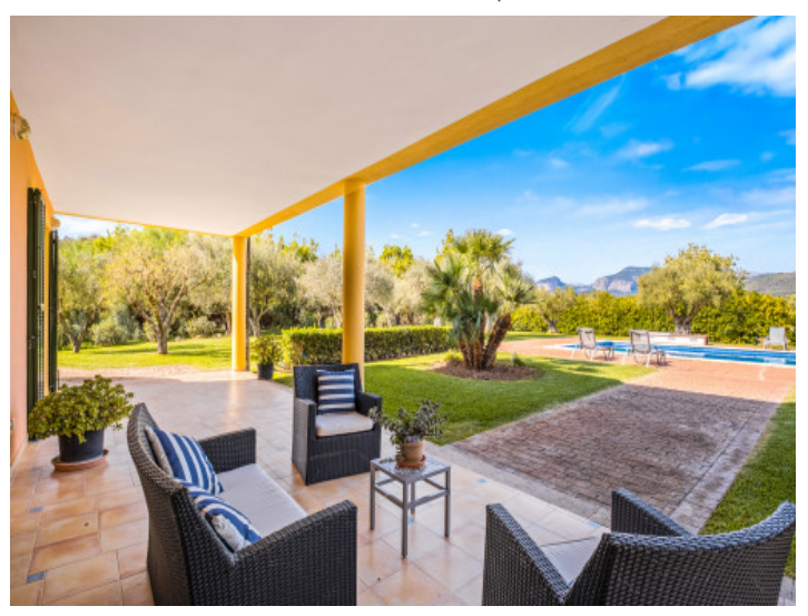
Covered lounge terrace of the living area