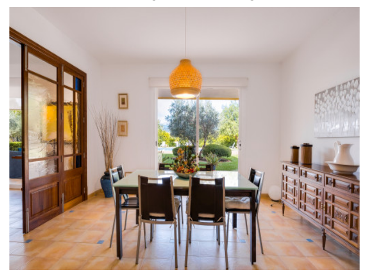
Bright dining area with terrace access Large, modern kitchen All information is correct to the best of our knowledge. Errors and prior sale excepted. This prospectus is purely for information purposes. Only the notarized deed of sale is legally binding.

PORTA MALLORQUINA • C./ CONQUISTADOR 8, 07001 PALMA TEL. +34 971 698 242 • INFO@PORTAMALLORQUINA.COM