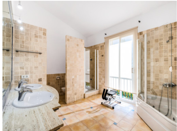
Modern en suite bathroom