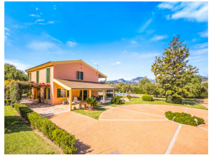
Extensive outdoor area with terraces