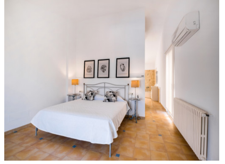
Bedroom with open en suite bathroom

PORTA MALLORQUINA® Your home. Our passion.