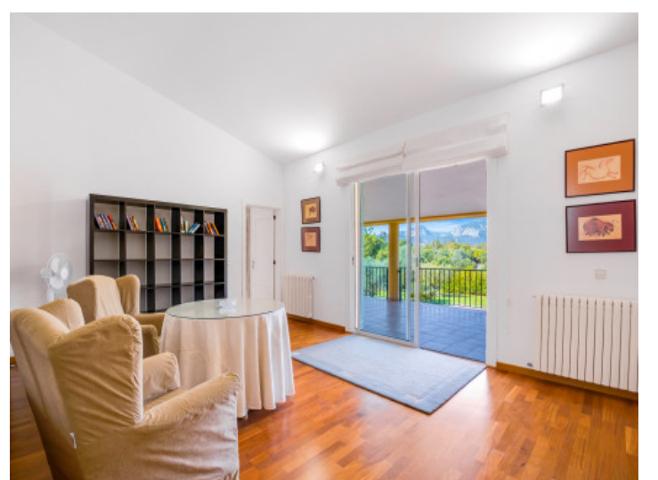
Further living room on the upper floorCovered upper terrace with mountain viewsAll information is correct to the best of our knowledge. Errors and prior sale excepted. This prospectus is purely for information purposes. Only the notarized deed of sale is legally binding.

PORTA MALLORQUINA • C./ CONQUISTADOR 8, 07001 PALMA TEL. +34 971 698 242 • INFO@PORTAMALLORQUINA.COM