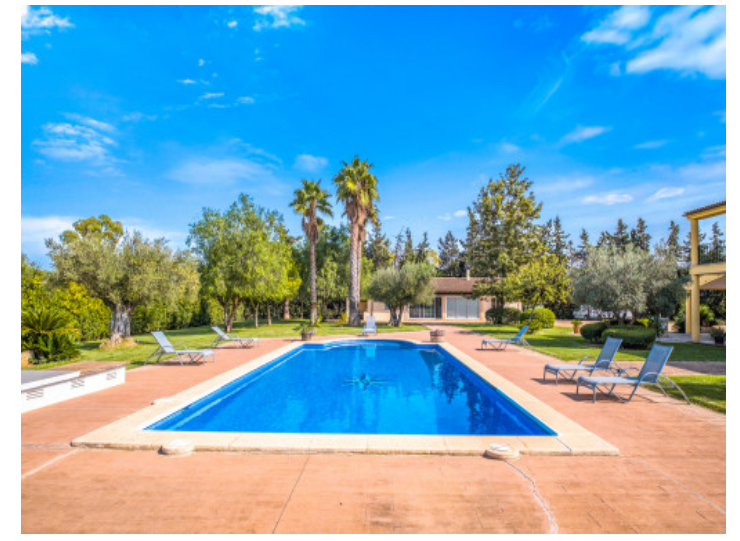
Luxurious, very private pool area