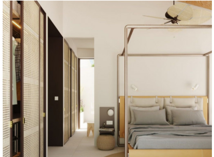
Inviting double bedroom