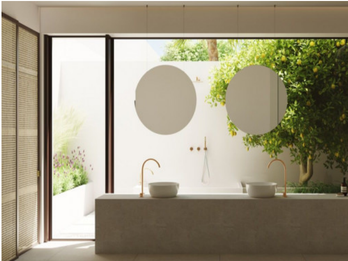
View into the patio