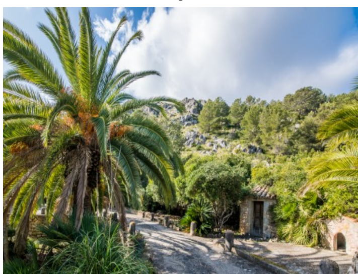
Mediterranean green plot