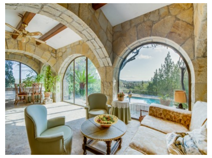
Lightflooded wintergarden with a view