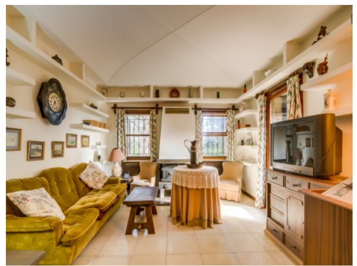
Rustic living area with terrace access