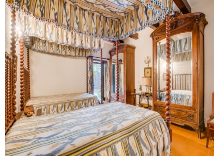
One of in total 11 bedrooms