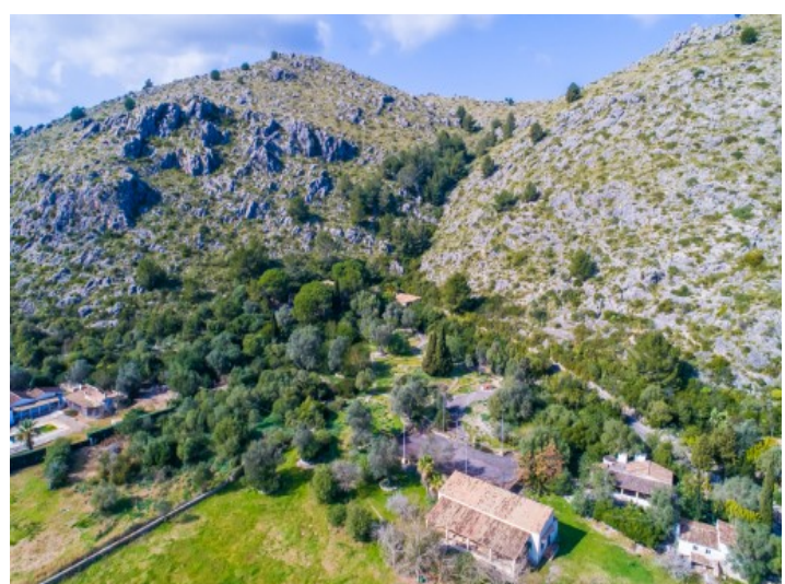
Porperty with tennis court from above View from above All information is correct to the best of our knowledge. Errors and prior sale excepted. This prospectus is purely for information purposes. Only the notarized deed of sale is legally binding.

PORTA MALLORQUINA • C./ CONQUISTADOR 8, 07001 PALMA TEL. +34 971 698 242 • INFO@PORTAMALLORQUINA.COM