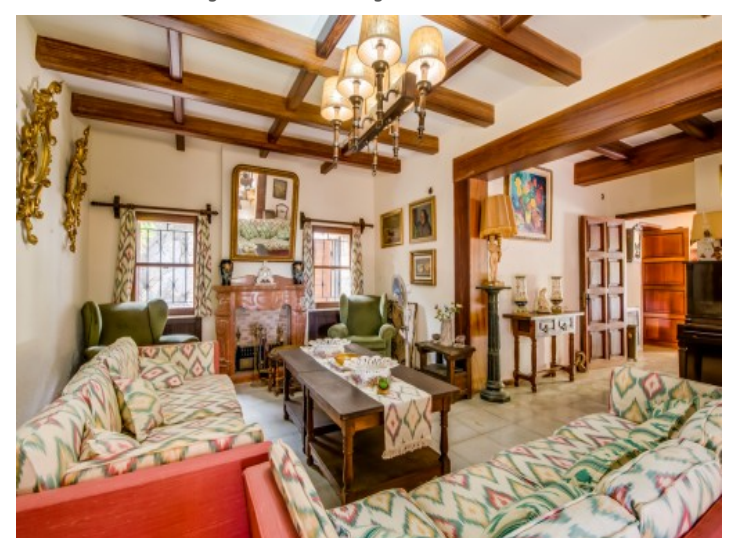
Further living area with wooden ceiling beams Rustic dining area on the upper floor All information is correct to the best of our knowledge. Errors and prior sale excepted. This prospectus is purely for information purposes. Only the notarized deed of sale is legally binding.

PORTA MALLORQUINA • C./ CONQUISTADOR 8, 07001 PALMA TEL. +34 971 698 242 • INFO@PORTAMALLORQUINA.COM