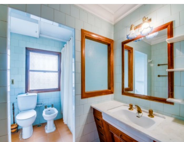
One of in total 9 bathrooms