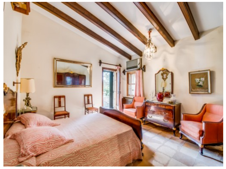
One of in total 11 bedrooms