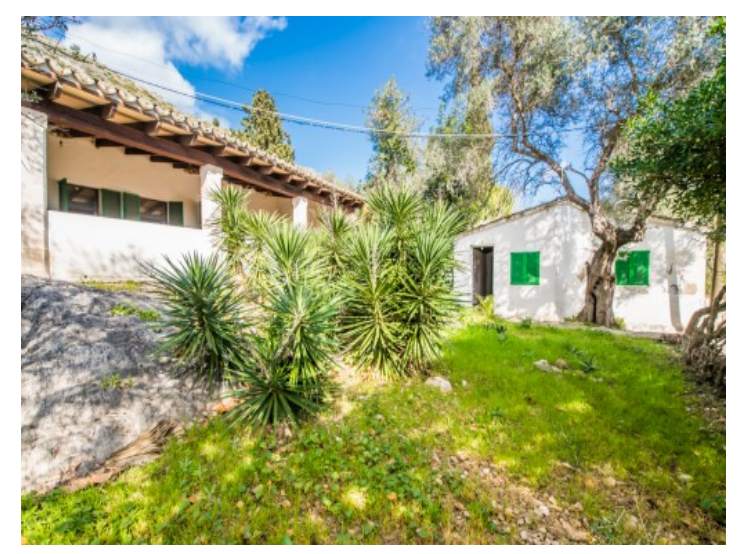
View of the guest houses