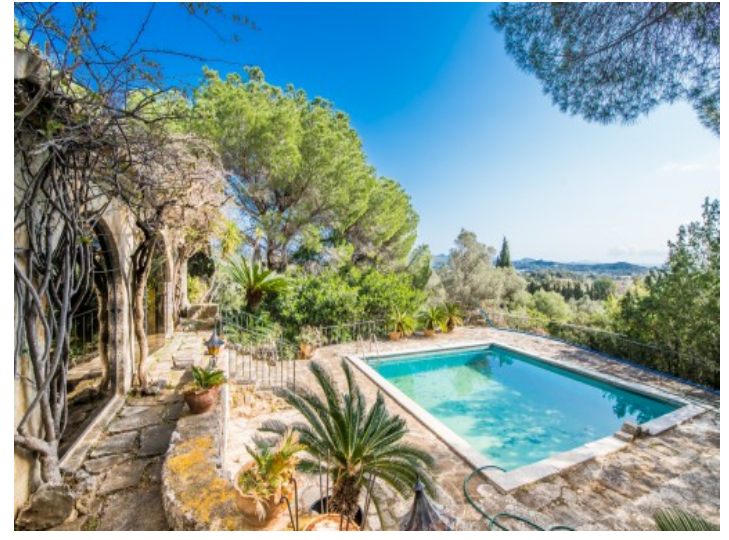
Pool area in absolute privacy with distant views

PORTA MALLORQUINA® Your home. Our passion.