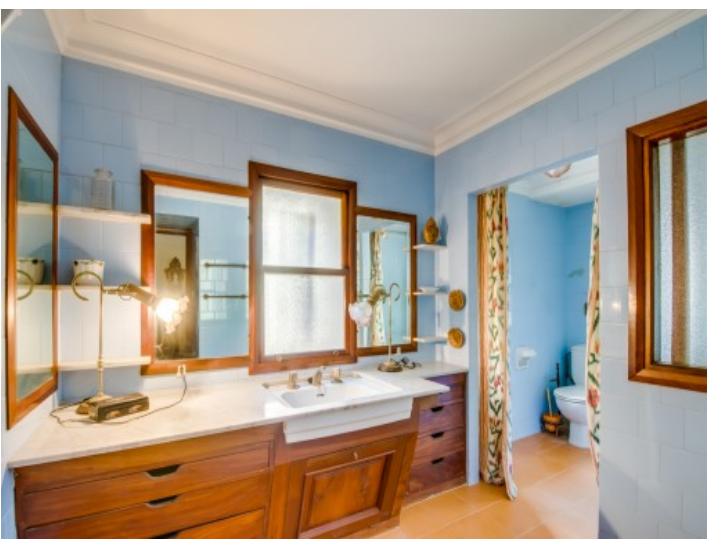
One of in total 9 bathrooms