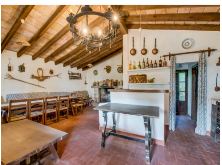
Rustic bbq house with wooden beams Pool area in the middle of nature All information is correct to the best of our knowledge. Errors and prior sale excepted. This prospectus is purely for information purposes. Only the notarized deed of sale is legally binding.

PORTA MALLORQUINA • C./ CONQUISTADOR 8, 07001 PALMA TEL. +34 971 698 242 • INFO@PORTAMALLORQUINA.COM