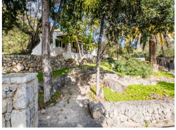
Access to a guest house

PORTA MALLORQUINA® Your home. Our passion.