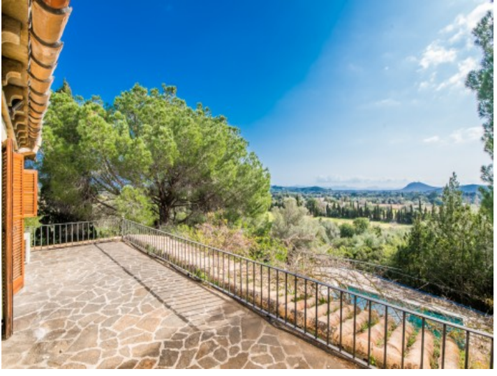
Stunnig panoramic views form the terrace