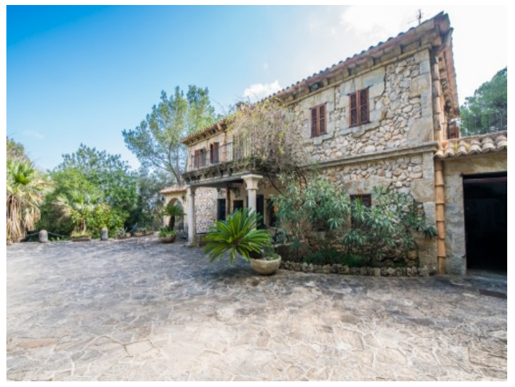
Front view of the main house with stone facade