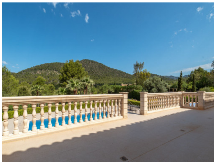
Large terrace with access to the pool

All information is correct to the best of our knowledge. Errors and prior sale excepted. This prospectus is purely for information purposes. Only the notarized deed of sale is legally binding.