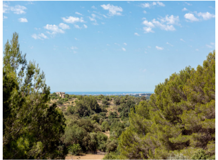
Wonderful panoramic views as far as the sea