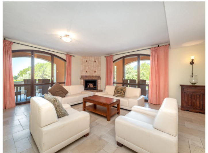
Large living area with fireplace