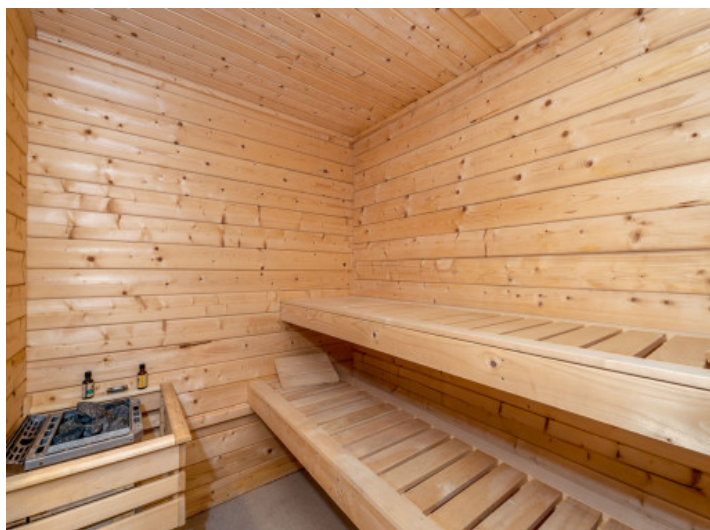
Own sauna and spa area