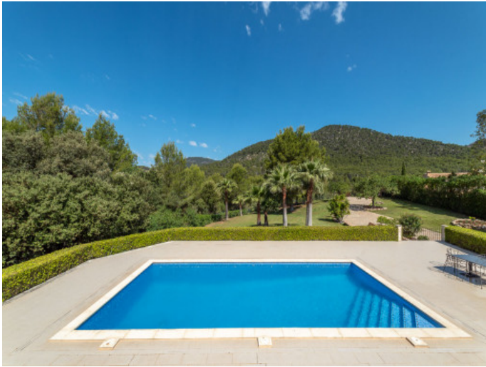
Pool in absolute privacy