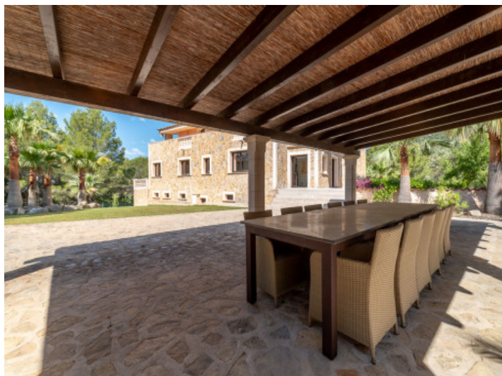
Covered outdoor dining area