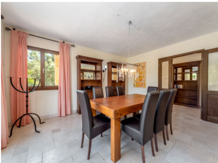
Open dining area