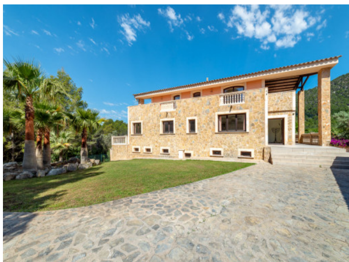
Exterior view and access