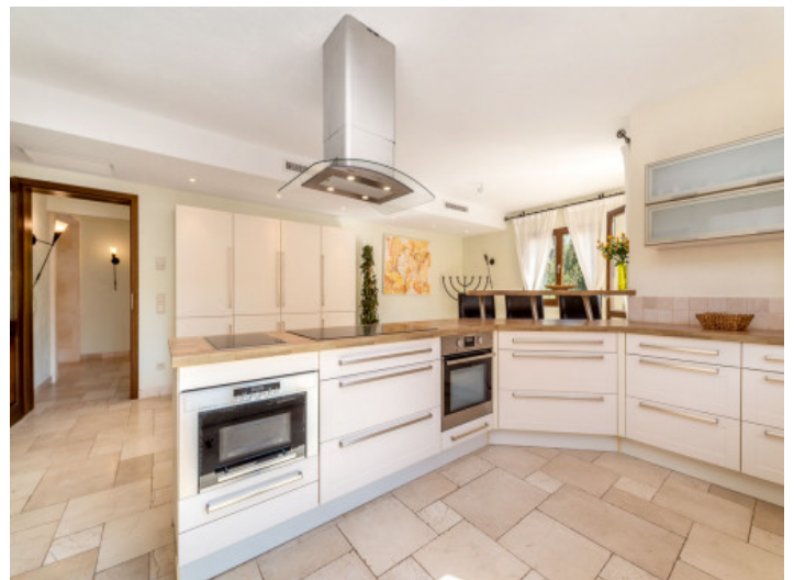
Spacious, modern kitchen

All information is correct to the best of our knowledge. Errors and prior sale excepted. This prospectus is purely for information purposes. Only the notarized deed of sale is legally binding.