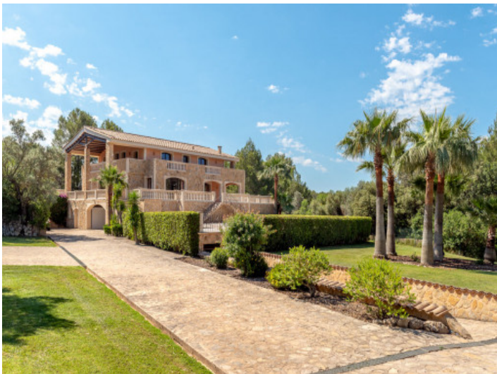
Driveway to the natural stone finca