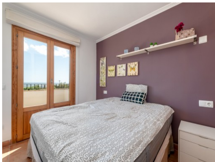
One of 3 bedrooms

All information is correct to the best of our knowledge. Errors and prior sale excepted. This prospectus is purely for information purposes. Only the notarized deed of sale is legally binding.