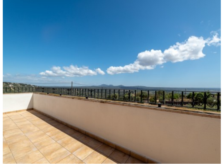
Upper terrace with sweeping views