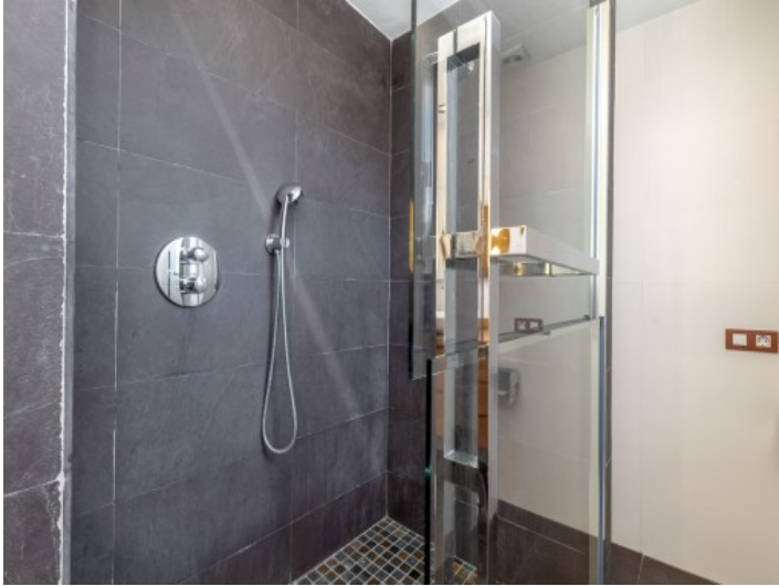
One of 2 bathrooms