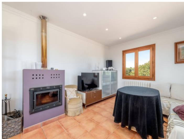
Fireplace for winter days