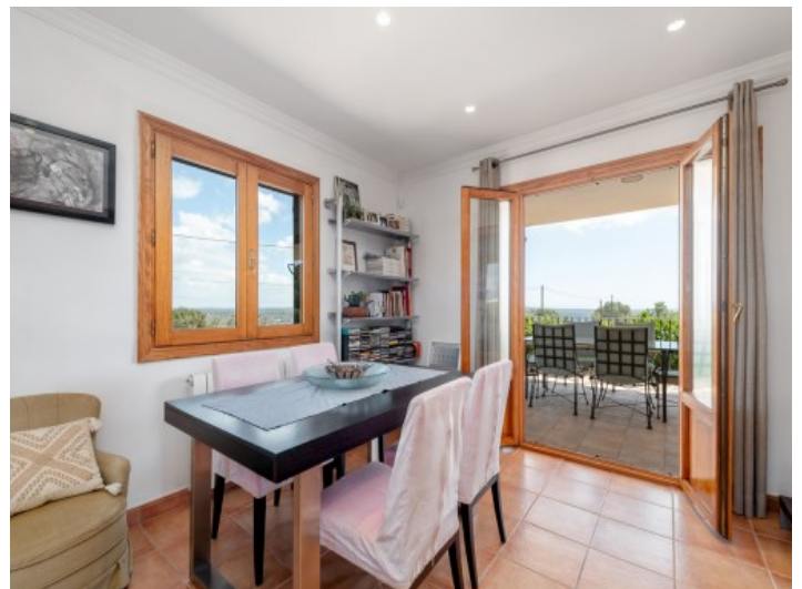
Dining area with terrace access

All information is correct to the best of our knowledge. Errors and prior sale excepted. This prospectus is purely for information purposes. Only the notarized deed of sale is legally binding.