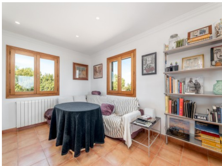
Bright living area