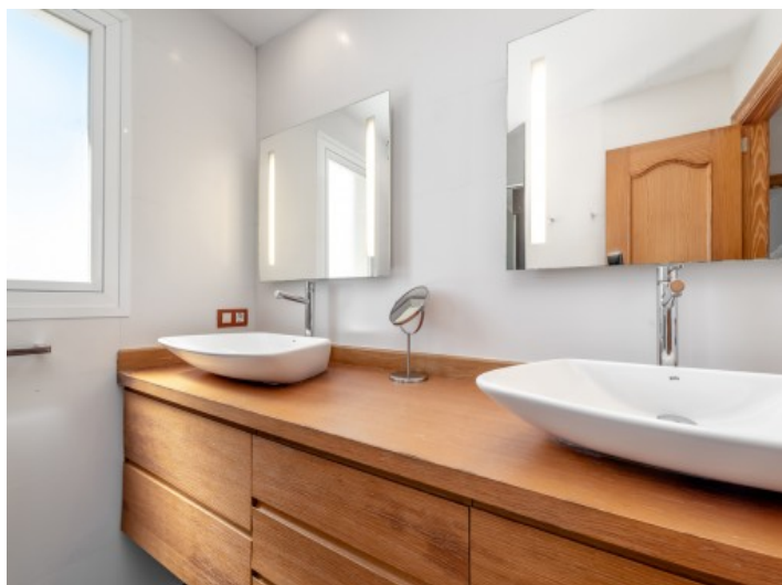
Modern en suite bathroom