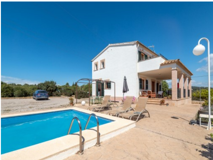
Spacious pool and outdoor area