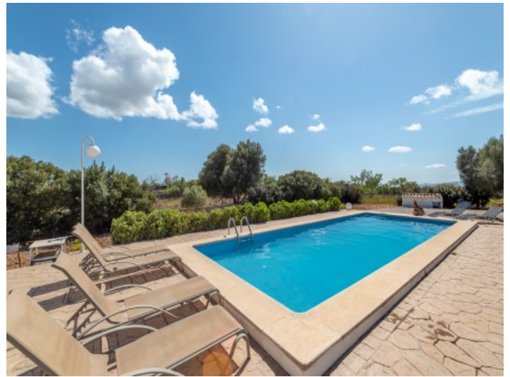
Beautiful pool area