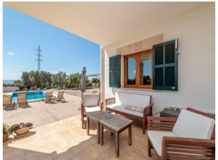
Covered seating area on the terrace