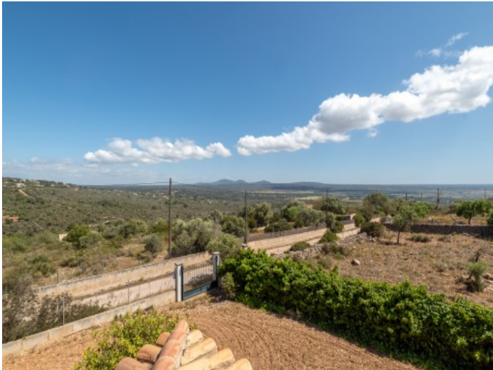
Views over the surrounding landscape