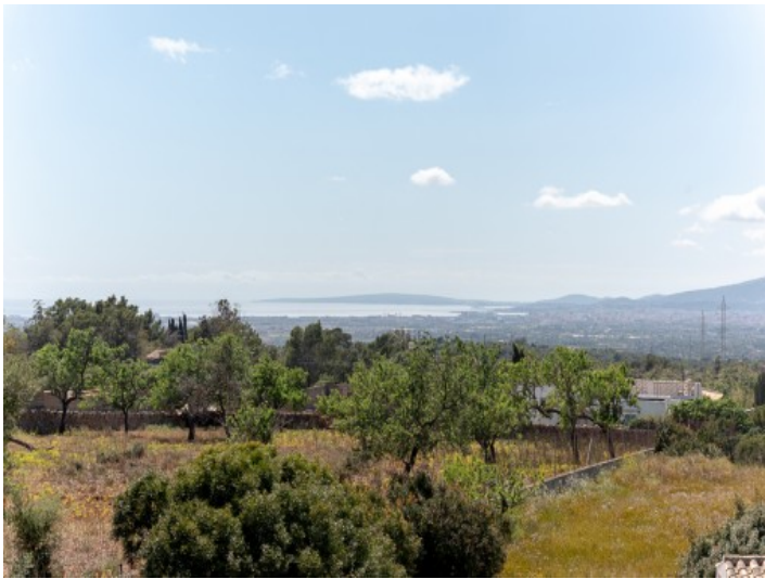
Panoramic views to the bay of Palma