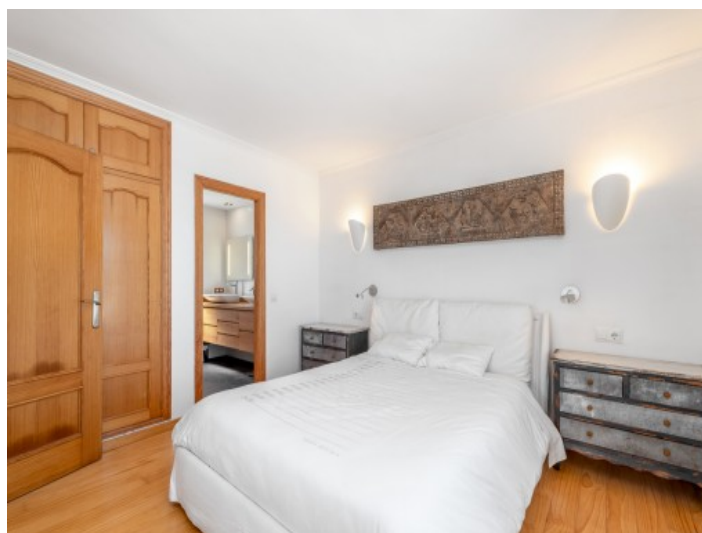
Master bedroom with bathroom