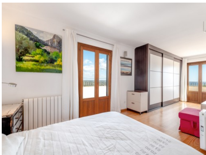
Master bedroom with terrace