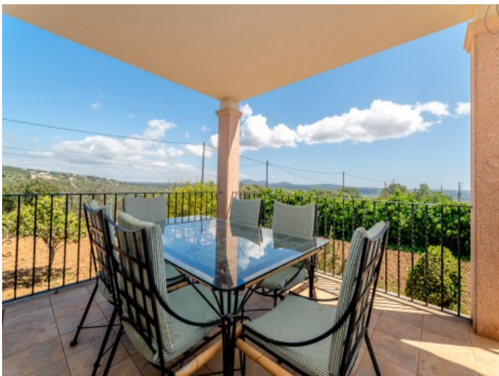
Outdoor dining area