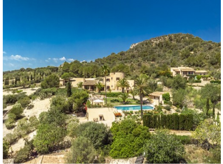
Bird's eye view