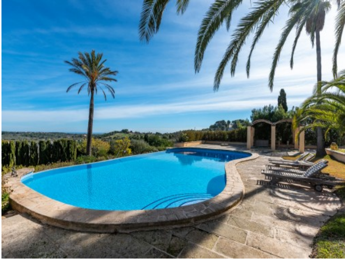
Very private pool area