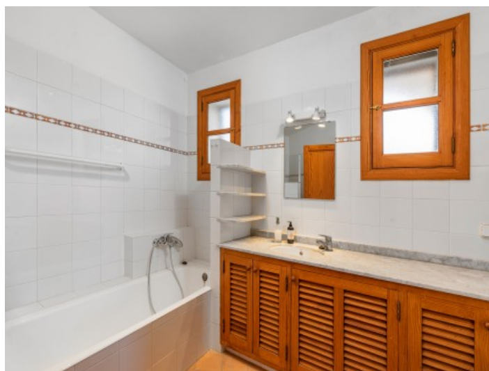
One of 5 bathrooms