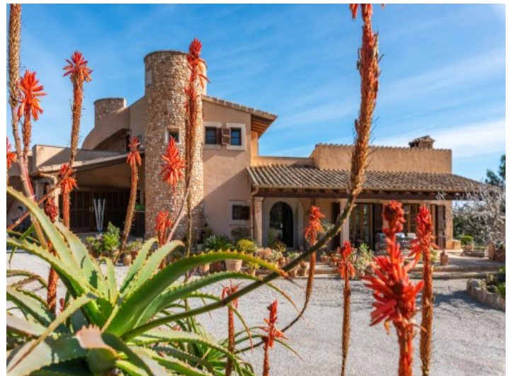
Front view and access