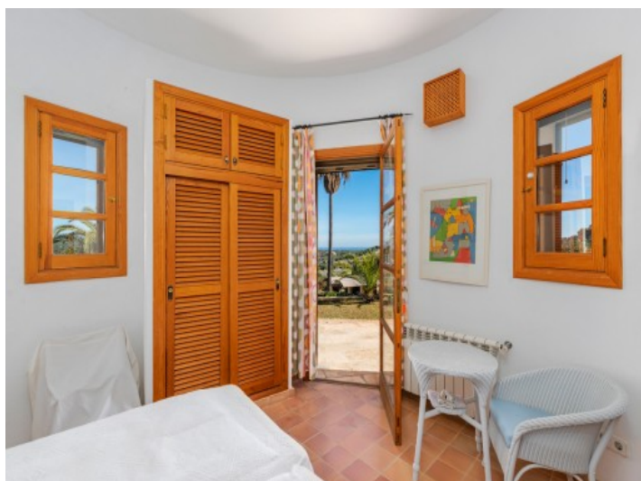
One of 6 bedrooms