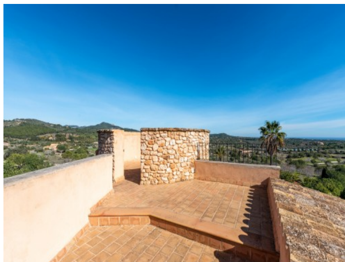
Large roof terrace

All information is correct to the best of our knowledge. Errors and prior sale excepted. This prospectus is purely for information purposes. Only the notarized deed of sale is legally binding.