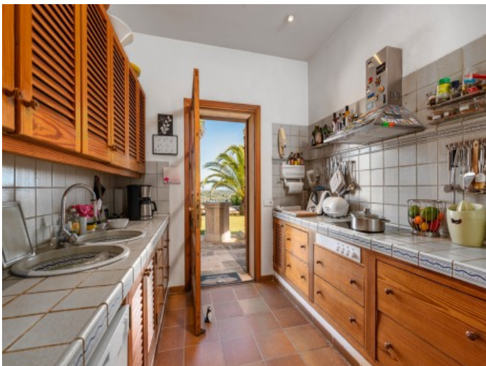
Kitchen with access to the outside