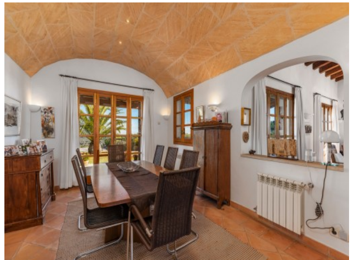
Dining area with vaulted stone ceiling