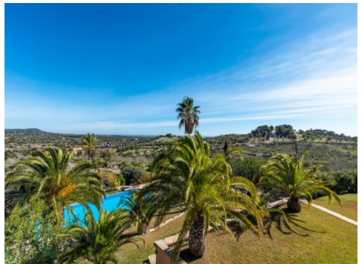
Dreamlike sweeping views

All information is correct to the best of our knowledge. Errors and prior sale excepted. This prospectus is purely for information purposes. Only the notarized deed of sale is legally binding.