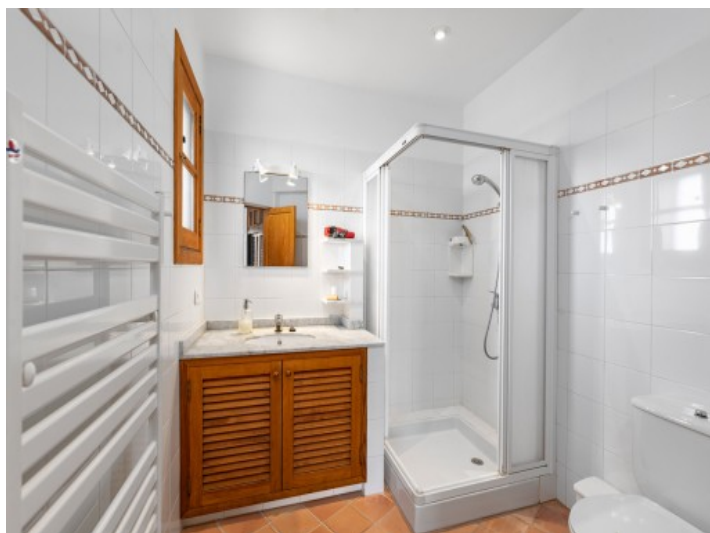
One of 5 bathrooms