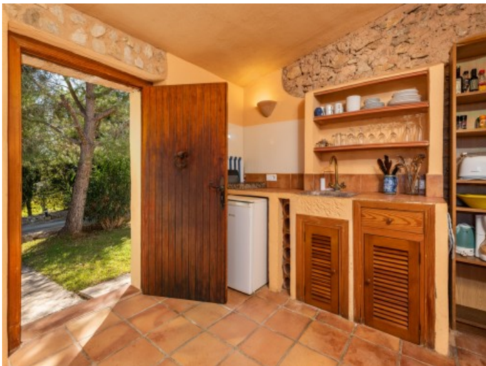
Entrance and small kitchen