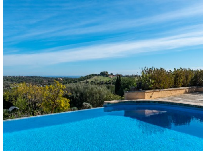
View from the pool