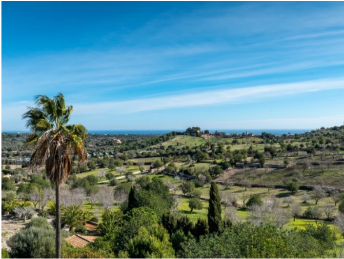
Picturesque surrounding landscape