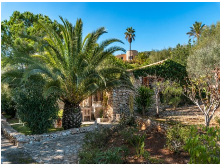
Stone-clad guest house