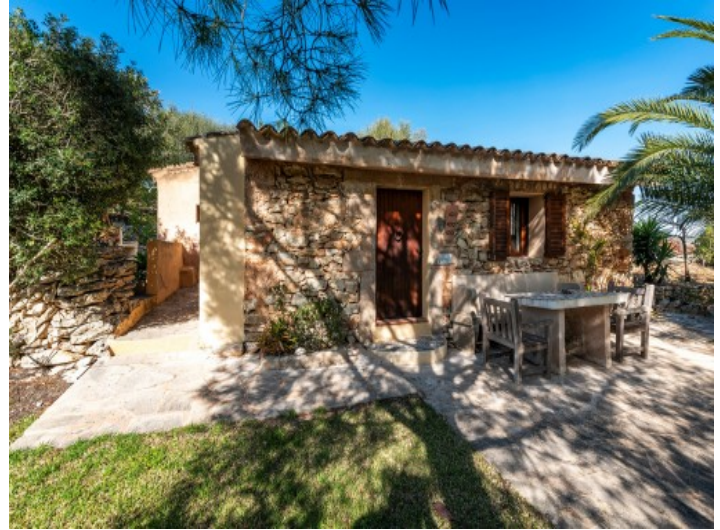
Separate guest house