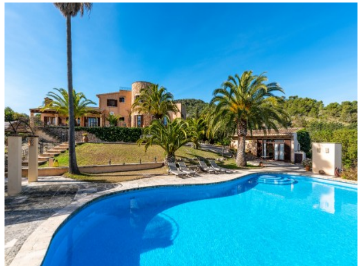
Large, tranquil pool area