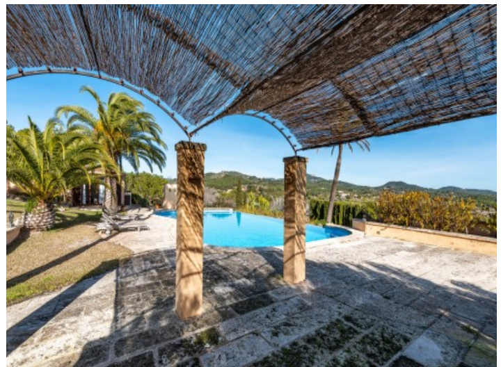
Covered pool terrace

All information is correct to the best of our knowledge. Errors and prior sale excepted. This prospectus is purely for information purposes. Only the notarized deed of sale is legally binding.