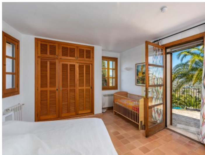
One of 6 bedrooms