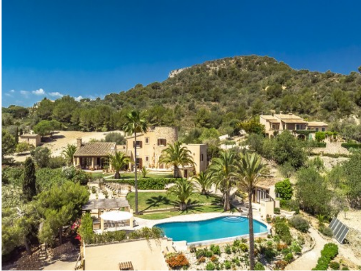
Wonderful garden and pool area