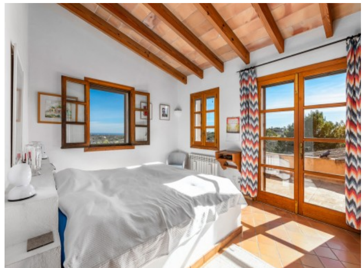
Bedroom with terrace access

All information is correct to the best of our knowledge. Errors and prior sale excepted. This prospectus is purely for information purposes. Only the notarized deed of sale is legally binding.