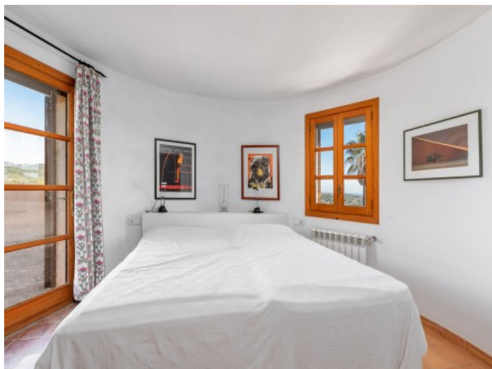
One of 6 bedrooms