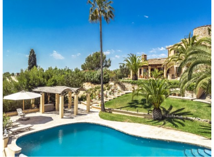
Mediterranean pool oasis