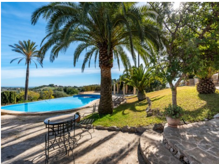
Pool with palm trees and a view