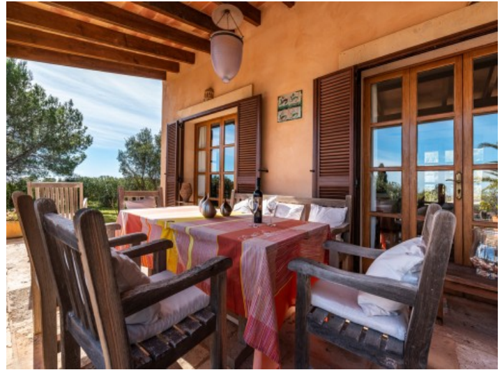
Covered outdoor dining area