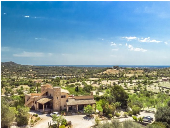
Driveway and front view of the finca