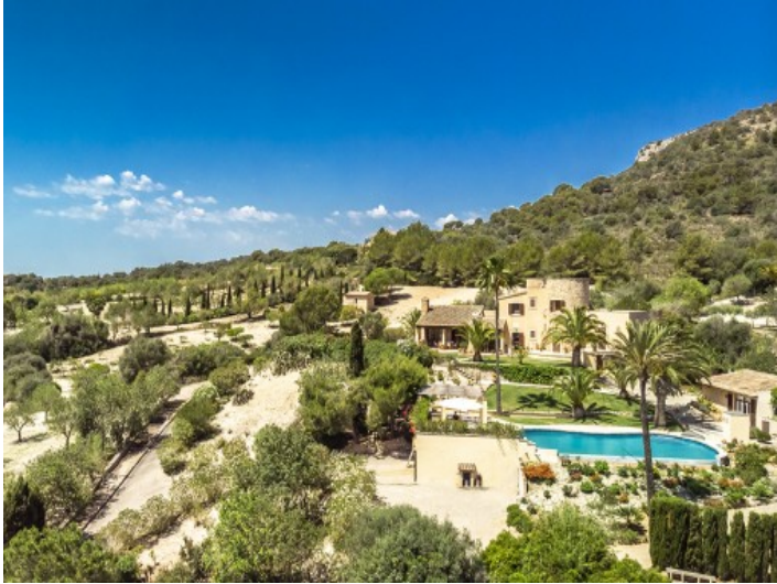
Bird's eye view