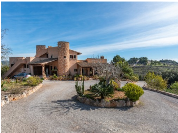
Driveway to the finca