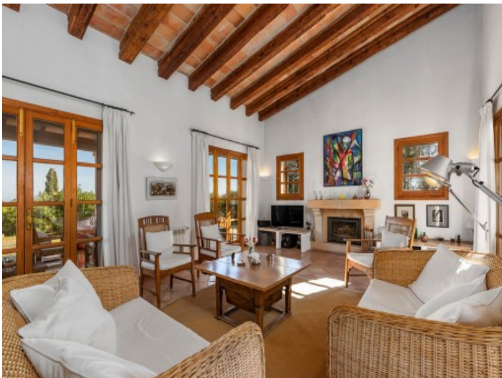
Living area with fireplace and wooden ceiling beams