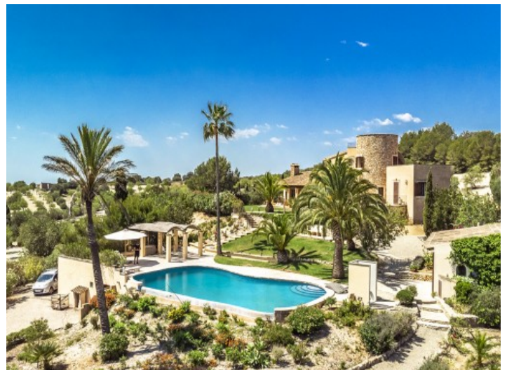
Bird's eye view

All information is correct to the best of our knowledge. Errors and prior sale excepted. This prospectus is purely for information purposes. Only the notarized deed of sale is legally binding.