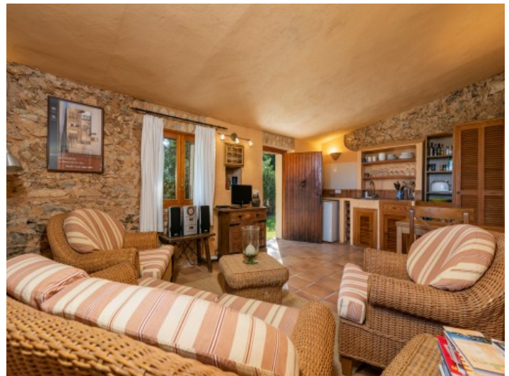
Cozy living room