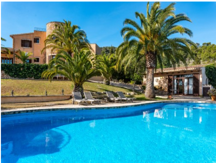
Finca, guest house and pool