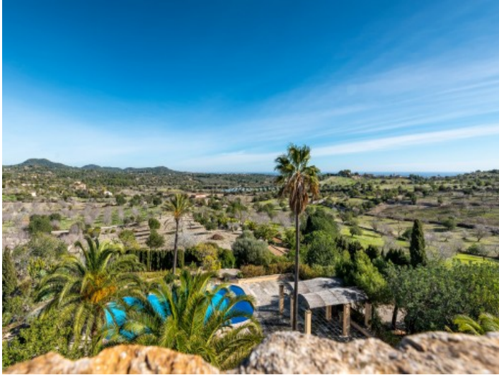
Stunning panoramic views