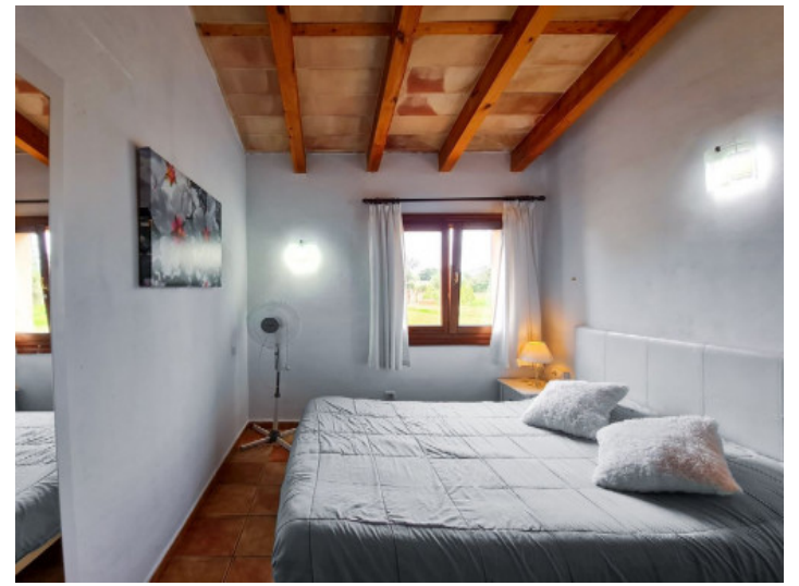
Bedroom house 2