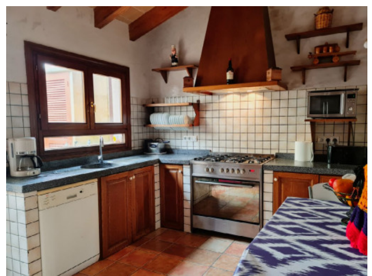
Kitchen house 2