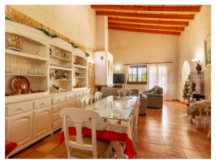
Dining area house 2