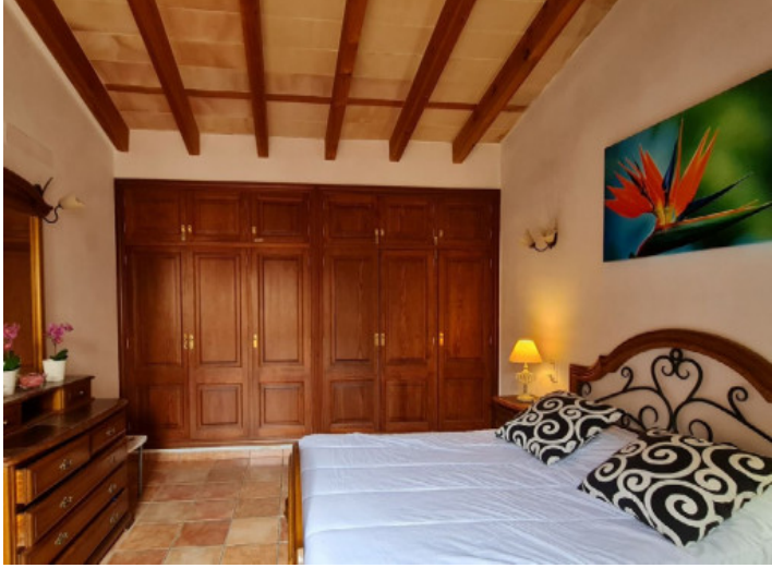
Bedroom house 2