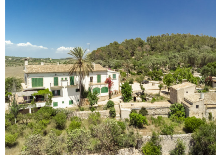
Exterior view of the property

PORTA MALLORQUINA® Your home. Our passion.