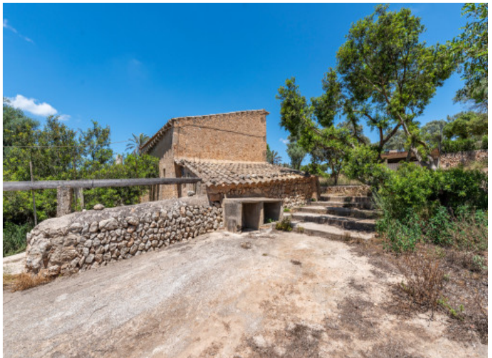
Outdoor area of the finca Exterior view of the property All information is correct to the best of our knowledge. Errors and prior sale excepted. This prospectus is purely for information purposes. Only the notarized deed of sale is legally binding.