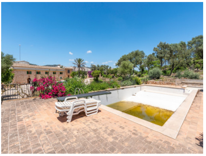
Pool with sun loungers