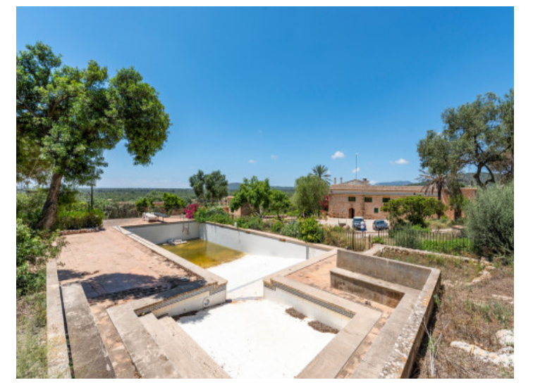
Large pool area View to the garden All information is correct to the best of our knowledge. Errors and prior sale excepted. This prospectus is purely for information purposes. Only the notarized deed of sale is legally binding.