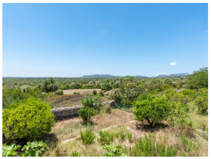
View from the finca