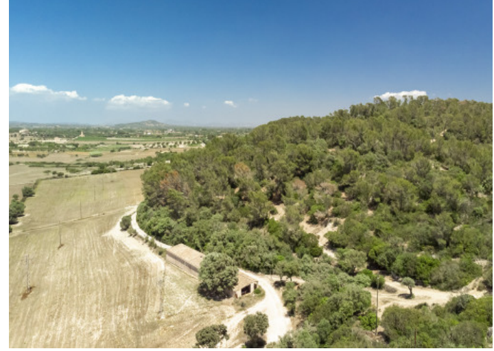
Idyllic surroundings Idyllic surroundings All information is correct to the best of our knowledge. Errors and prior sale excepted. This prospectus is purely for information purposes. Only the notarized deed of sale is legally binding.