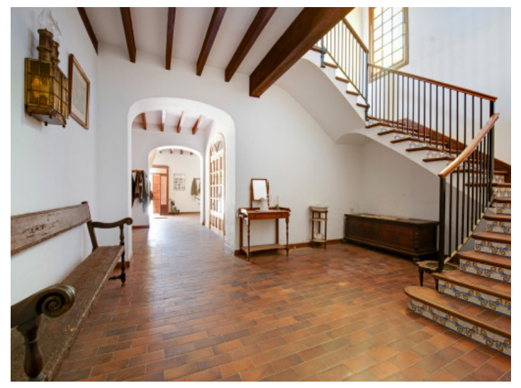
Large entrance hall

PORTA MALLORQUINA® Your home. Our passion.