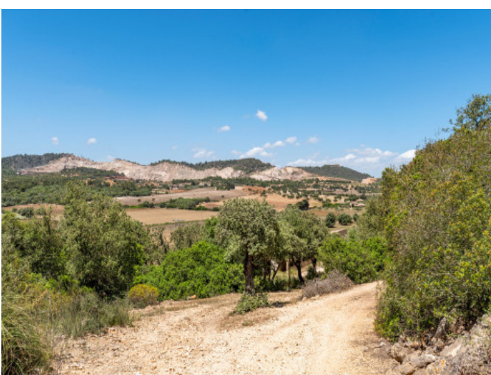
View from the finca