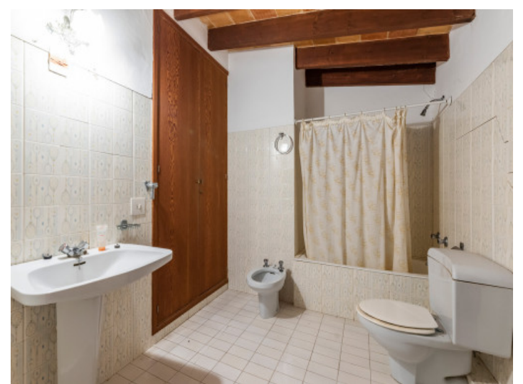
Bathroom with bath tub Another bedroom All information is correct to the best of our knowledge. Errors and prior sale excepted. This prospectus is purely for information purposes. Only the notarized deed of sale is legally binding.