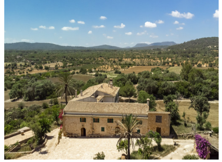
The finca from a bird's eye view

PORTA MALLORQUINA® Your home. Our passion.