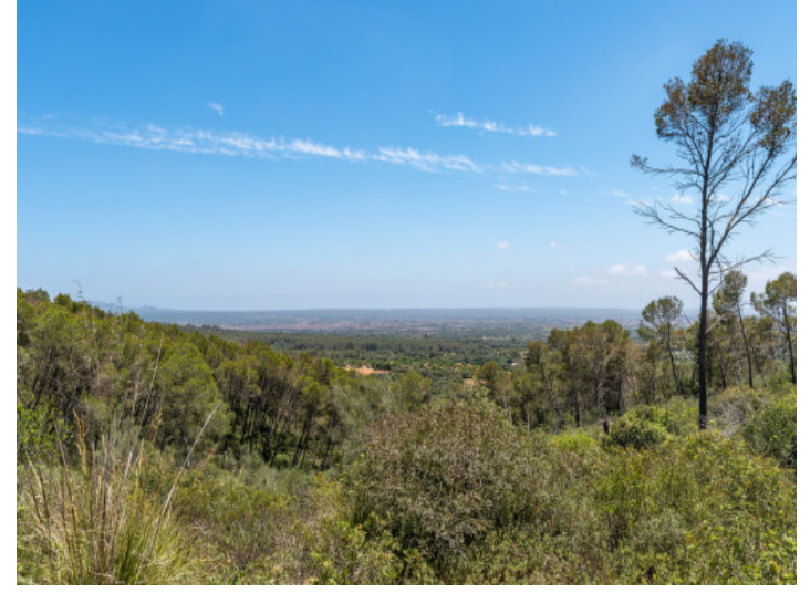
View from the finca