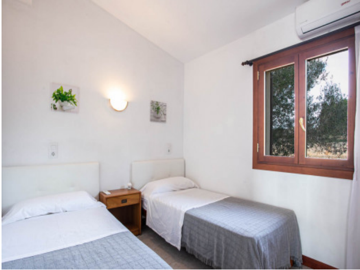
Second double bedroom