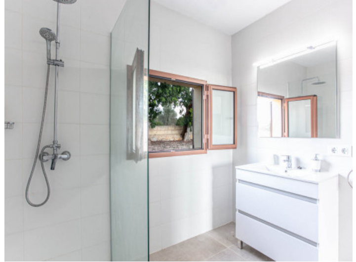
Bathroom with shower