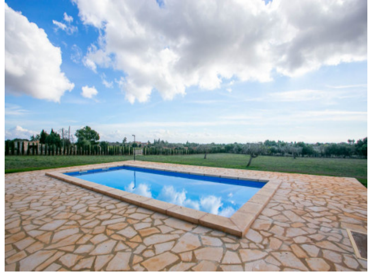
View of the pool