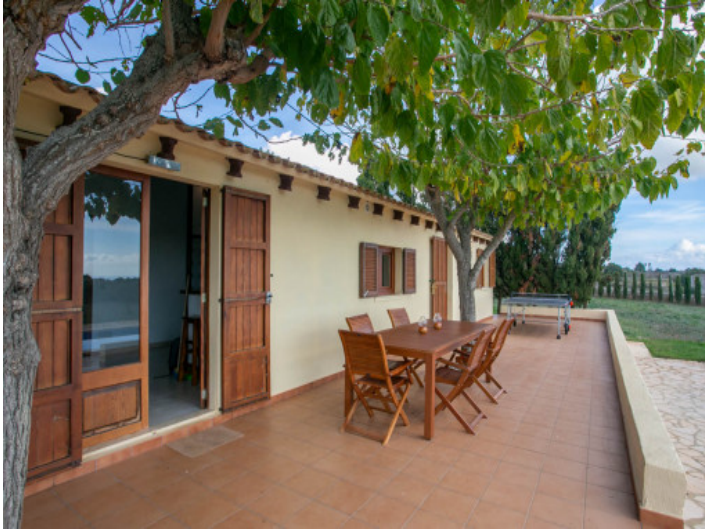
Terrace with dining area