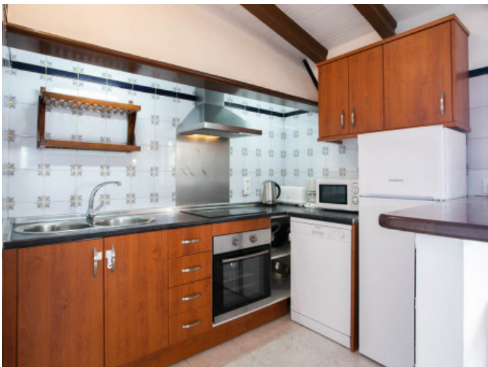
Rustic kitchen of the finca