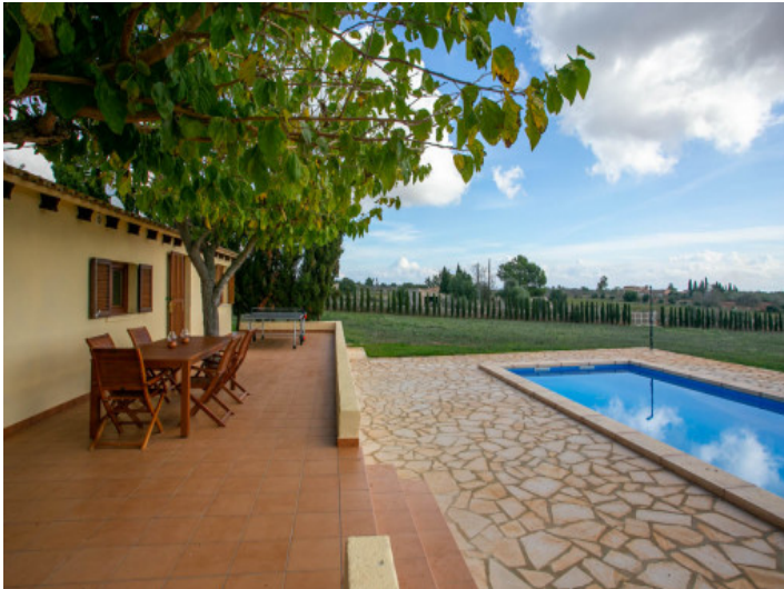
Terrace and pool