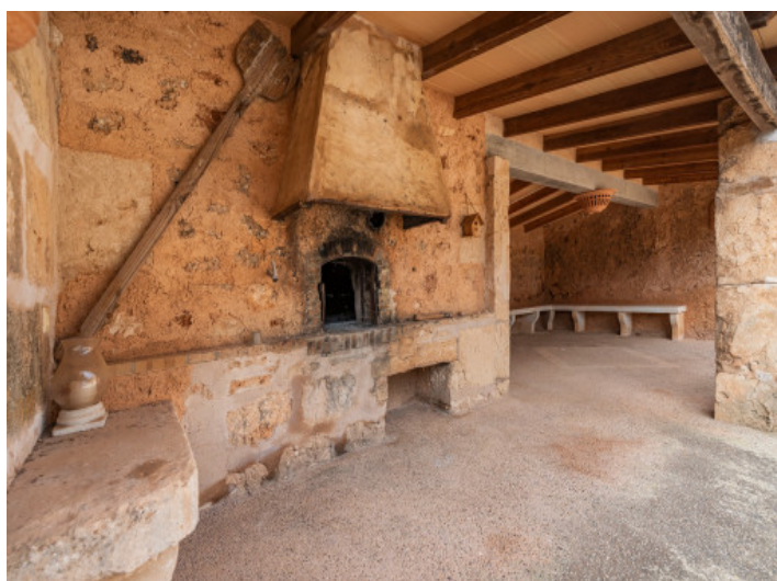
Covered outdoor kitchen