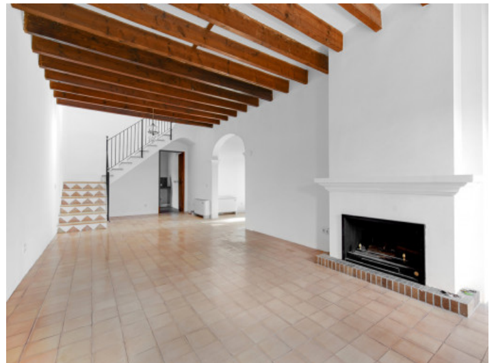
Alternative view of the living area