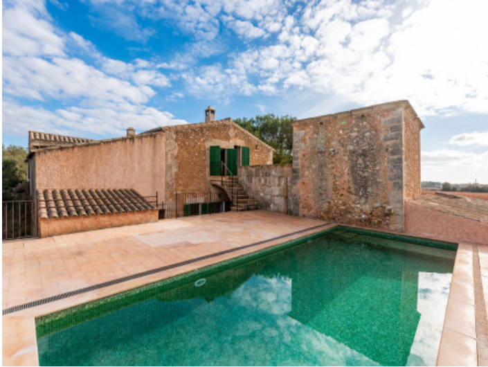
Private pool area