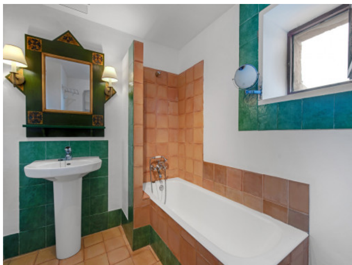
Bathroom with bath tub