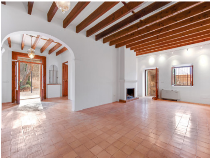
Large living area with fire place