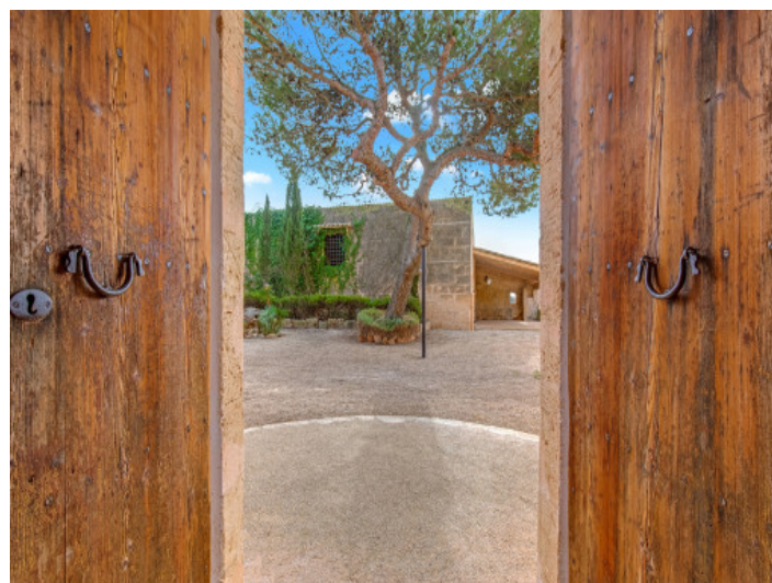
Access tot the patio