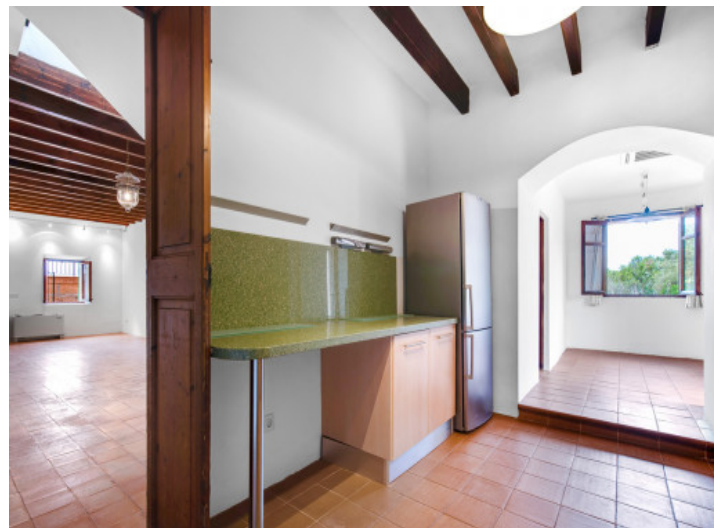
Alternative view of the kitchen

All information is correct to the best of our knowledge. Errors and prior sale excepted. This prospectus is purely for information purposes. Only the notarized deed of sale is legally binding.