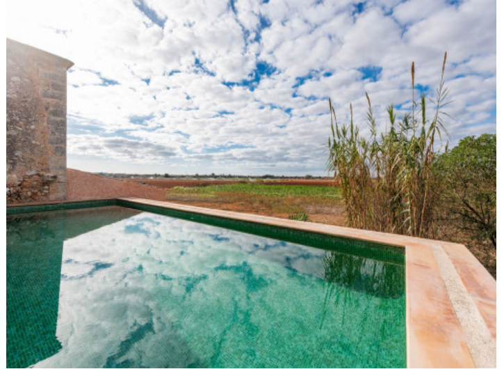
Landscape and pool views