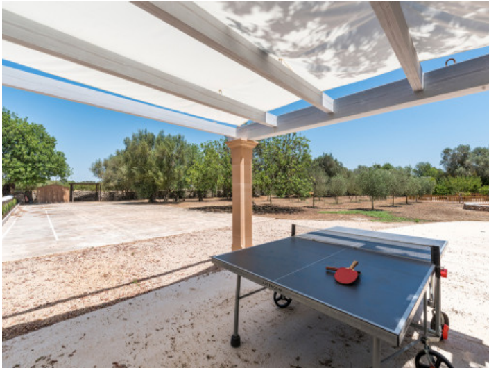
Outdoor area with many possibilities