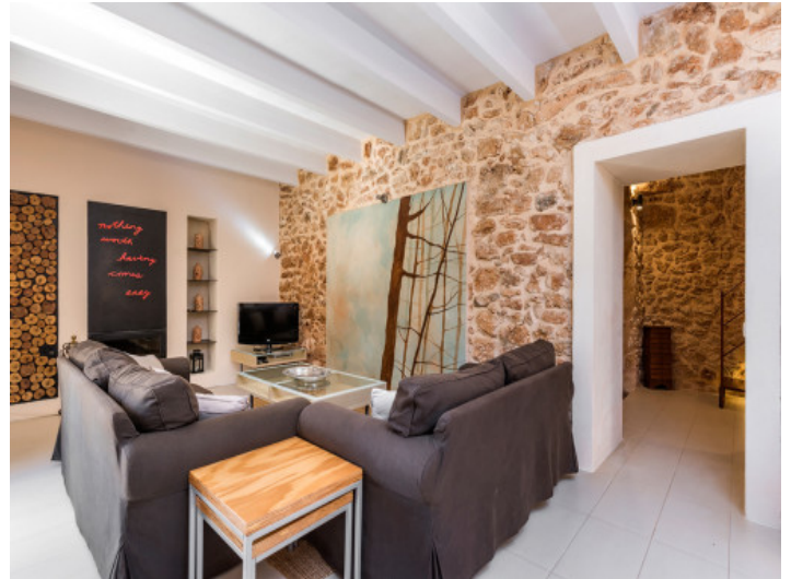
Cosy living area with natural stone wall