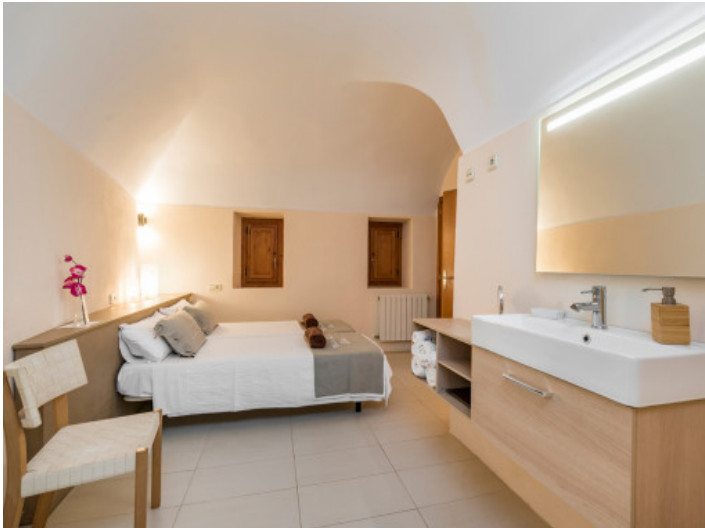
One of 3 modern bedrooms