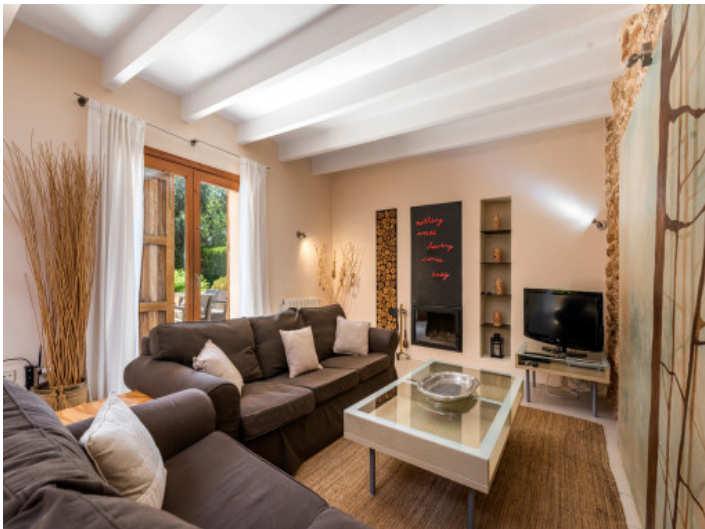
The living area provides a fireplace