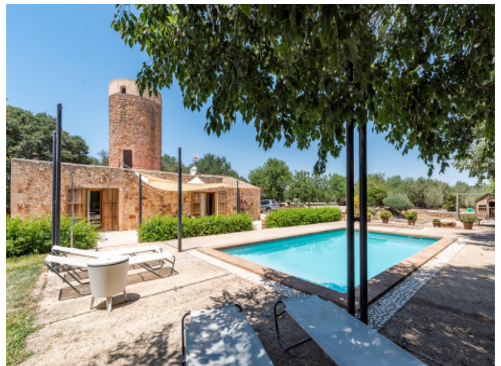
Pool area with absolute privacy

All information is correct to the best of our knowledge. Errors and prior sale excepted. This prospectus is purely for information purposes. Only the notarized deed of sale is legally binding.