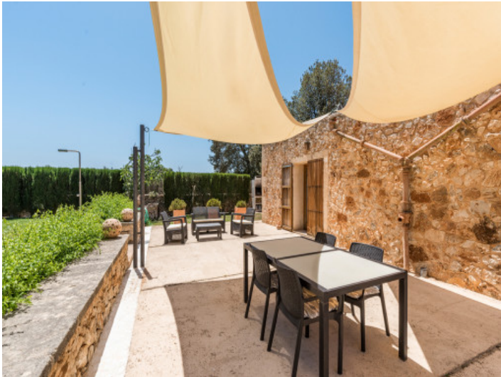
Charming dining area on the terrace