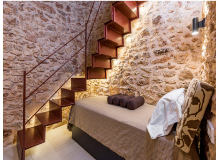
Bedroom with authentic stone wall