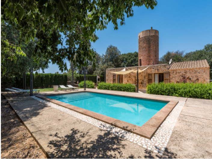
Well-tended pool area