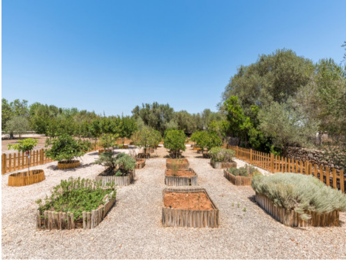
Fruit and vegetable garden