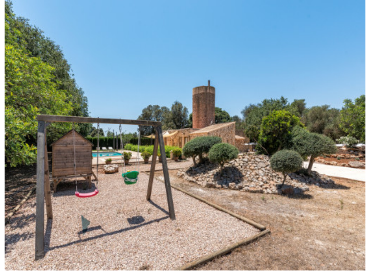
Spacious outdoor area