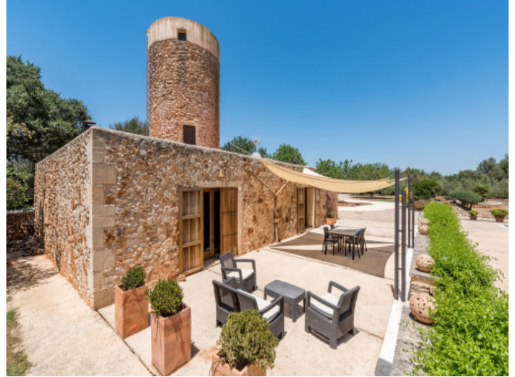
Exterior view of the beautiful stone mill finca