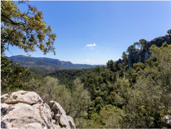
Impressive panoramic views