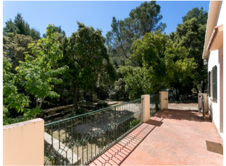
Sunny terrace on the upper floor