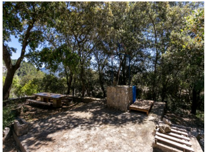
Tranquil outdoor area