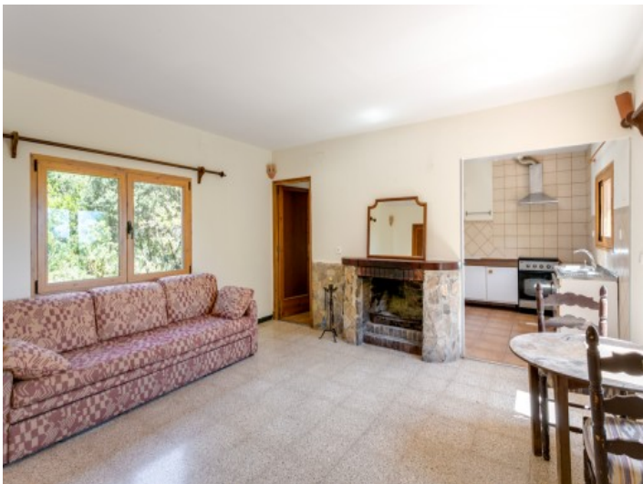
Living area with rustic fireplace