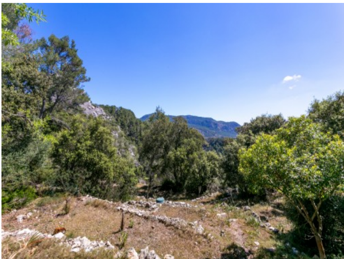
Beautiful landscape views