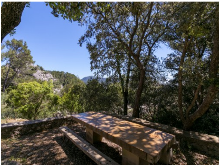
Idyllic terrace surrounded by nature