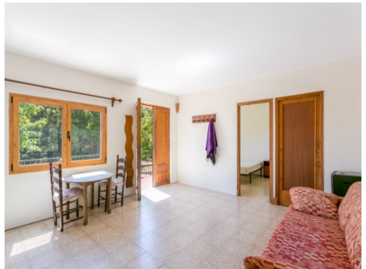
Bright and spacious living area