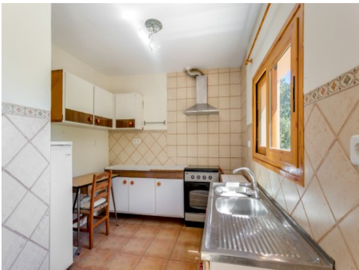
Simple and half-open kitchen