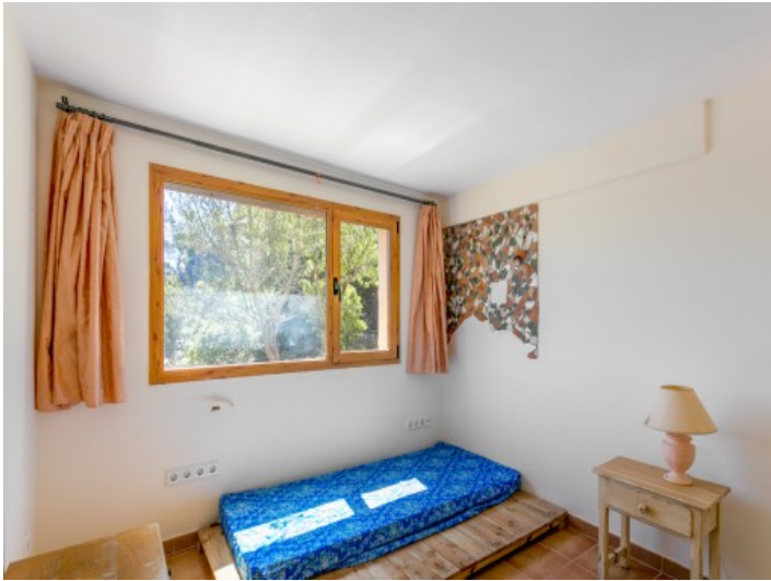
Second bedroom on the lower floor