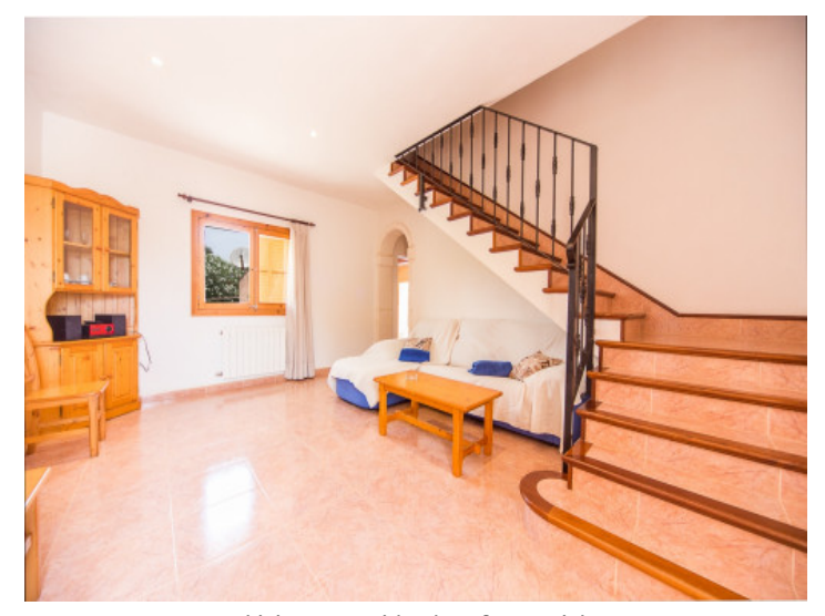
Living area with a lot of potential