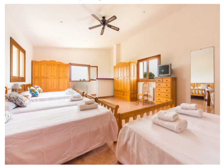
Light flooded, large bedroom