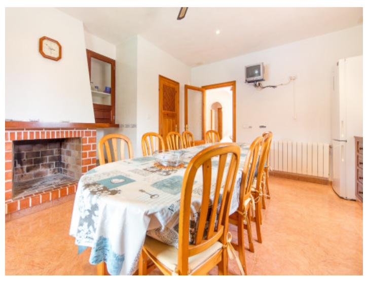
Cosy dining area with fireplace