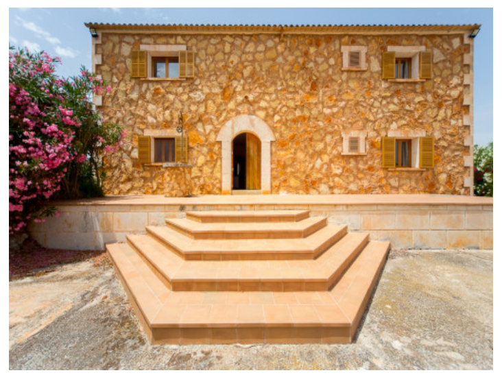
Beautiful entrance of the property