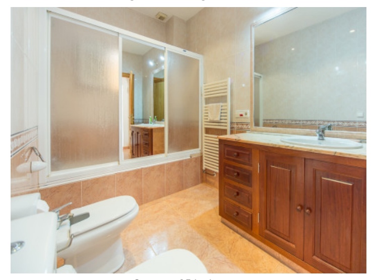
One out of 3 bathrooms