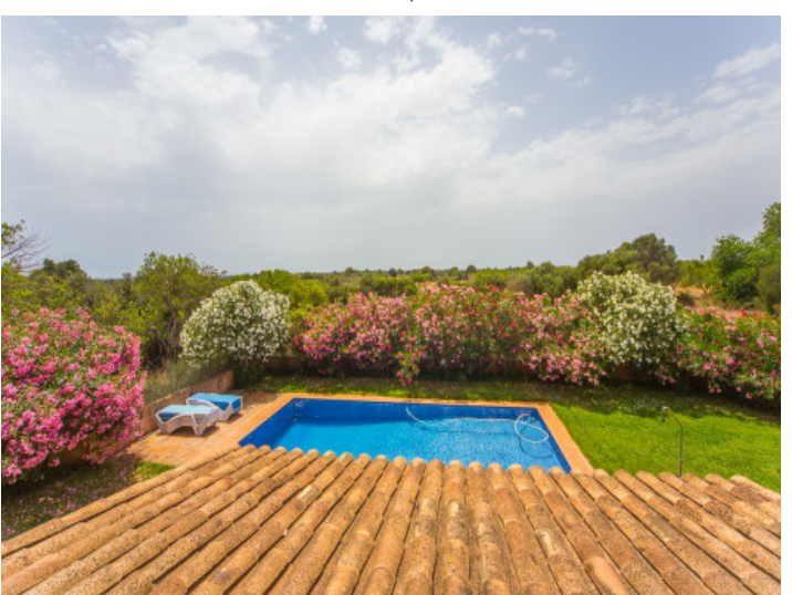
Views over the pool area and the amazing garden