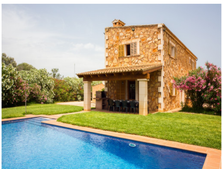
Well-tended pool area