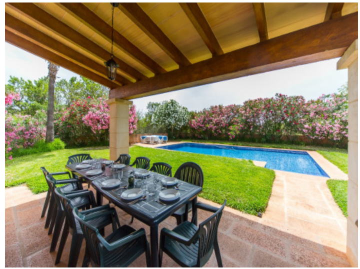
Fantastic covered terrace