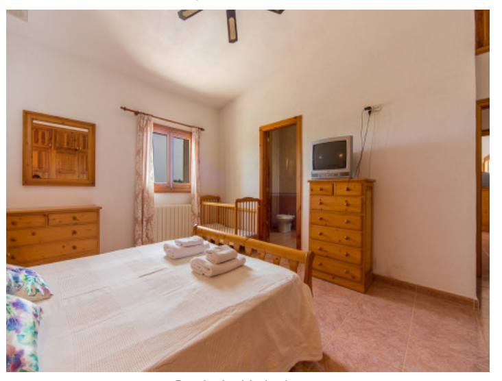
Rustic double bedroom

All information is correct to the best of our knowledge. Errors and prior sale excepted. This prospectus is purely for information purposes. Only the notarized deed of sale is legally binding.