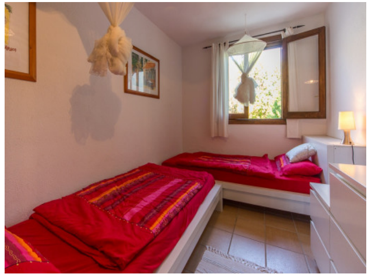
Bedroom with two single beds

All information is correct to the best of our knowledge. Errors and prior sale excepted. This prospectus is purely for information purposes. Only the notarized deed of sale is legally binding.