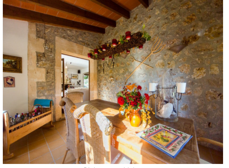
Dining area with bar

All information is correct to the best of our knowledge. Errors and prior sale excepted. This prospectus is purely for information purposes. Only the notarized deed of sale is legally binding.