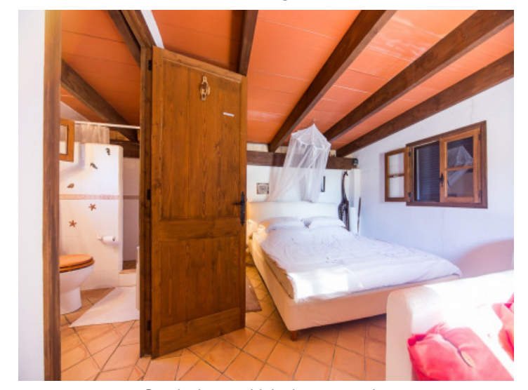
Cosy bedroom with bathroom en suite