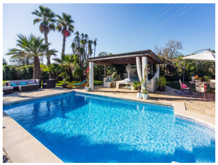
Pool area is surrounded by a terrace