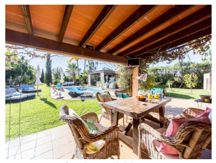
Covered terrace with dining area