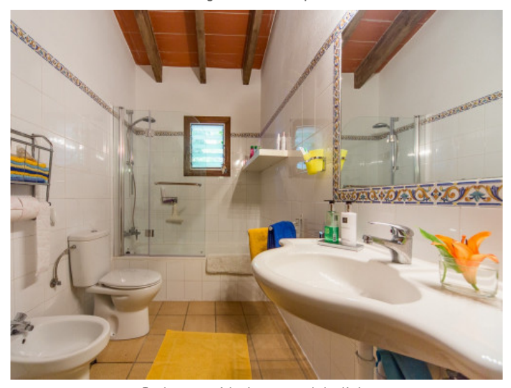
Bathroom with shower and daylight