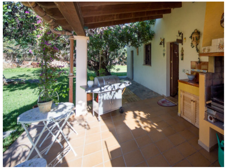
Covered terrace with barbecue