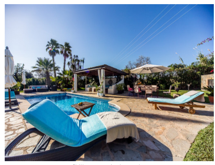
Chill-out area in the garden