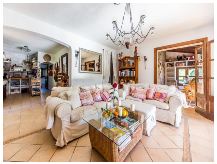
Noble living area