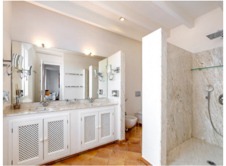
Large en suite bathroom