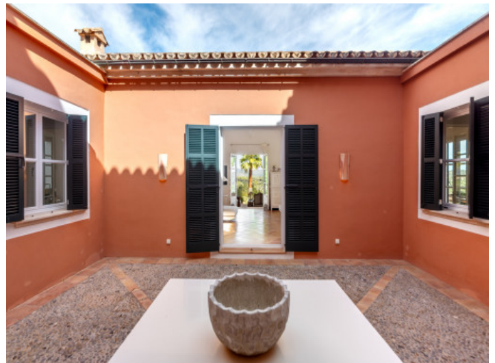
Charming mediterranean patio