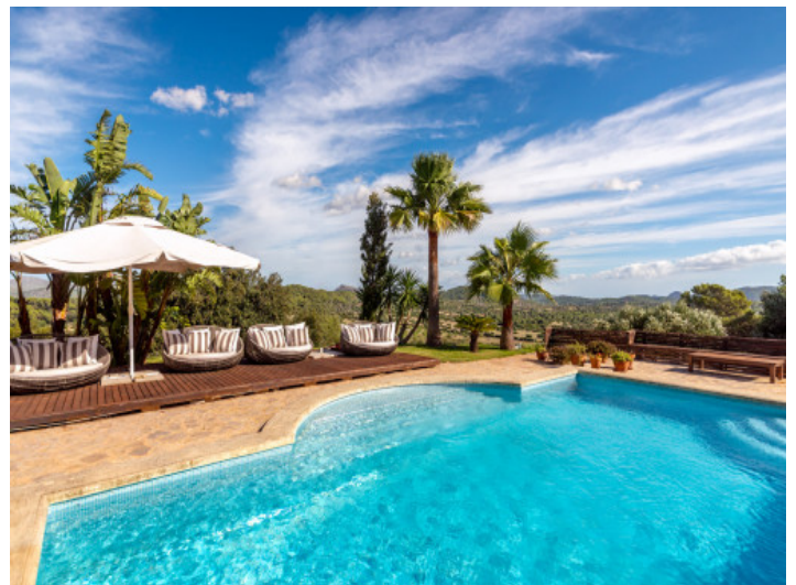
Quality furniture at the pool area

All information is correct to the best of our knowledge. Errors and prior sale excepted. This prospectus is purely for information purposes. Only the notarized deed of sale is legally binding.