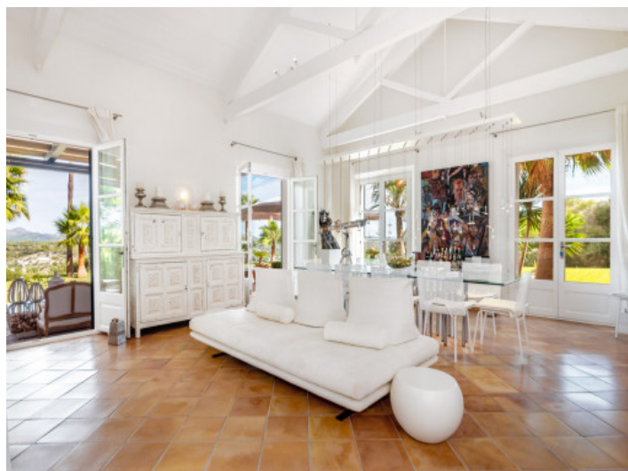
Open dining and living area

All information is correct to the best of our knowledge. Errors and prior sale excepted. This prospectus is purely for information purposes. Only the notarized deed of sale is legally binding.