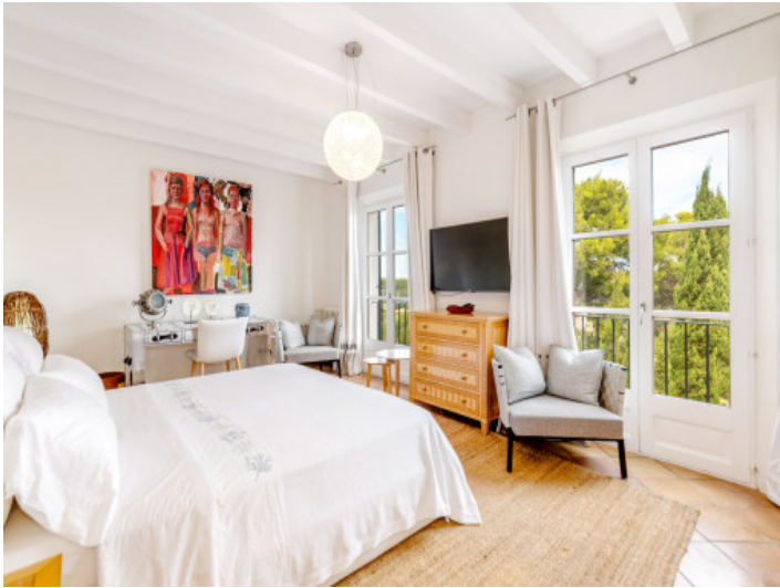
Cozy stylish bedroom