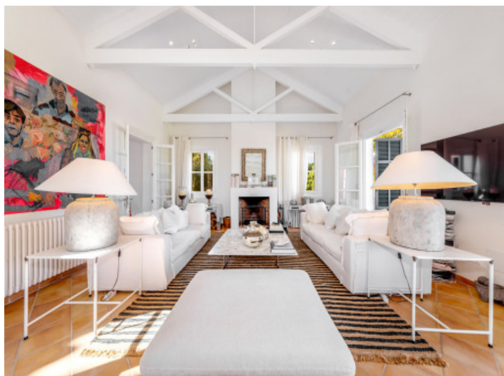
Fashion country style living area