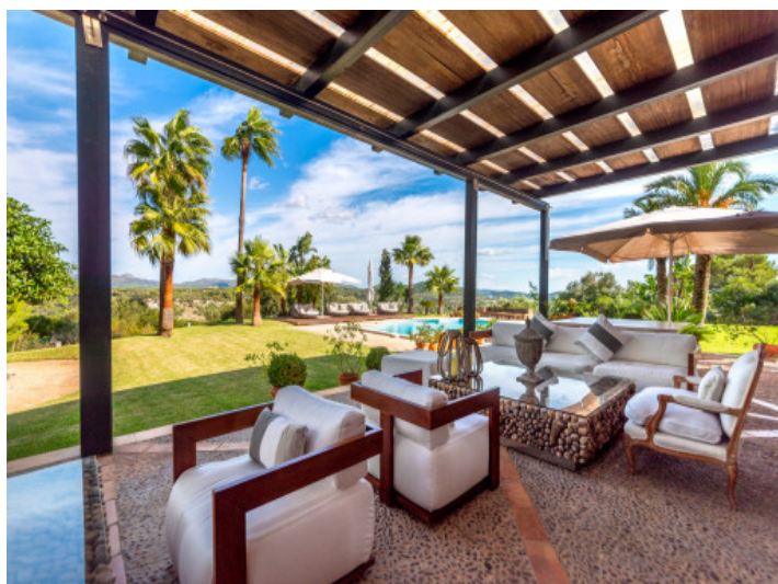
Spacious porched veranda