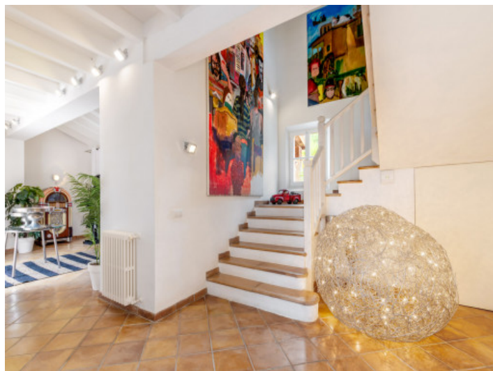
Stairs to the upper floor