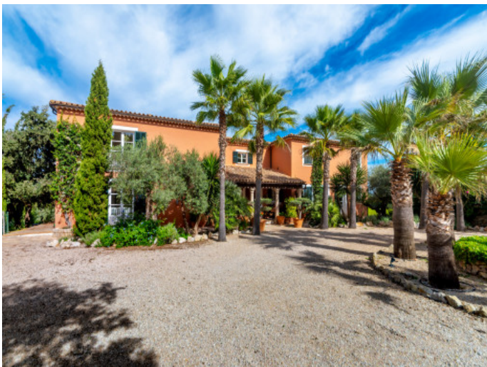
Exterior view of these amazing property