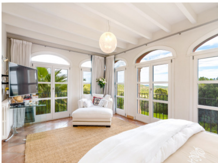
Masterbedroom with panoramic views