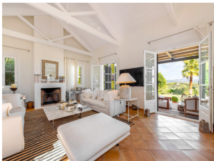
Elegant living area with fireplace