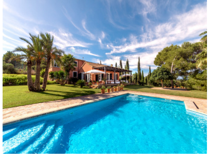
The outdoor area is a dream