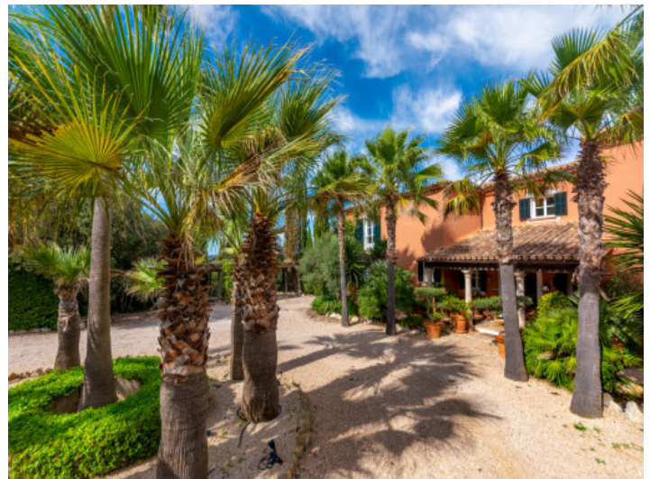
Main entrance area with palm trees