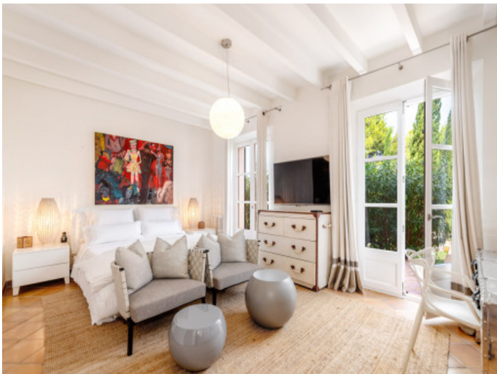
Bedroom on the ground floor