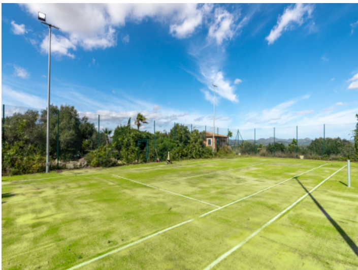
Artificial turf tennis court