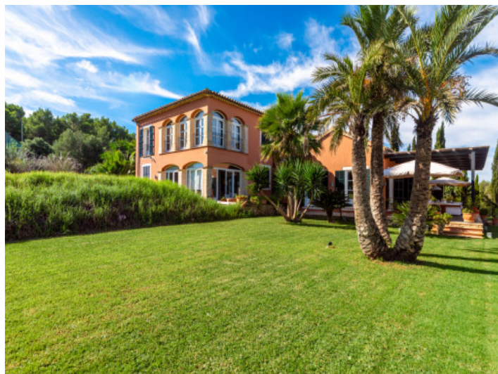
Perfect maintained mediterranean garden