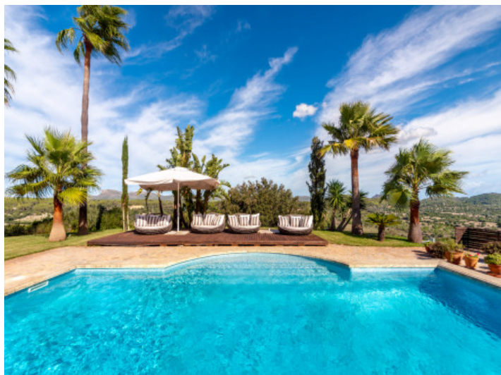
Amazing pool area