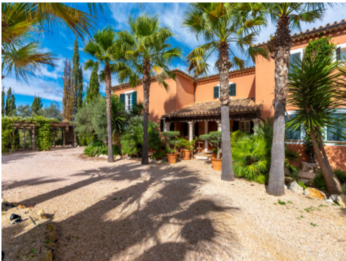
Exterior view and main entrance