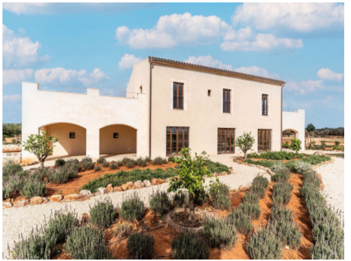
View to the finca