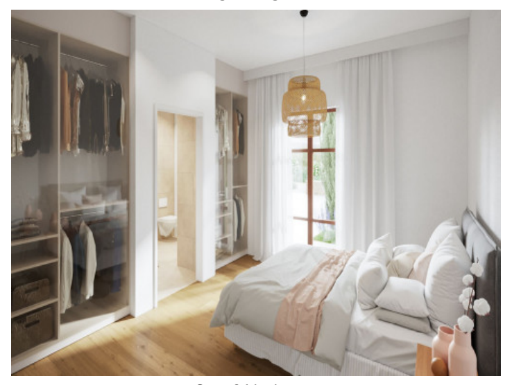
One of 6 bedrooms