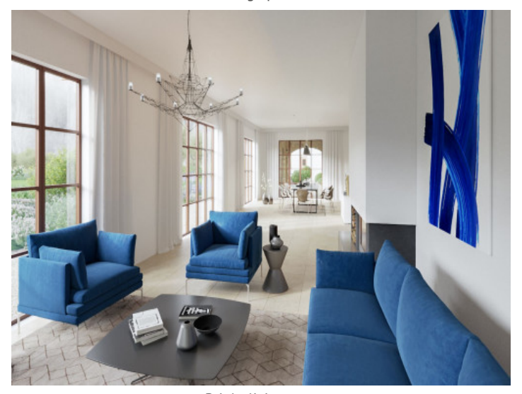
Bright living area