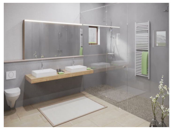
Finca with 7 bathrooms