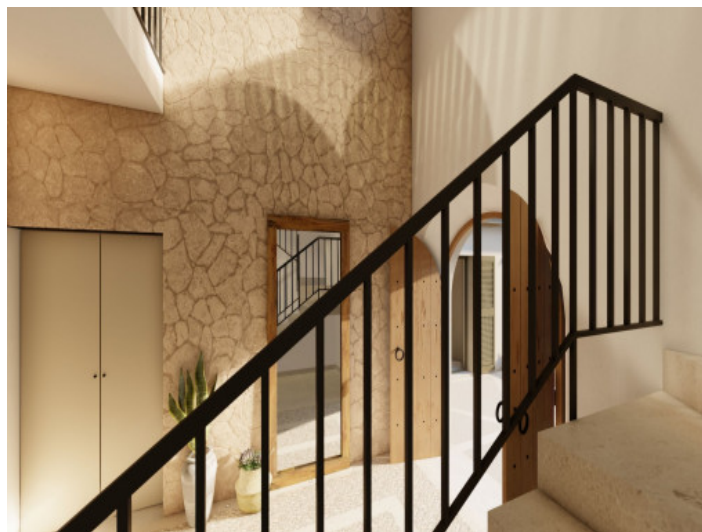
Staircase to the first floor