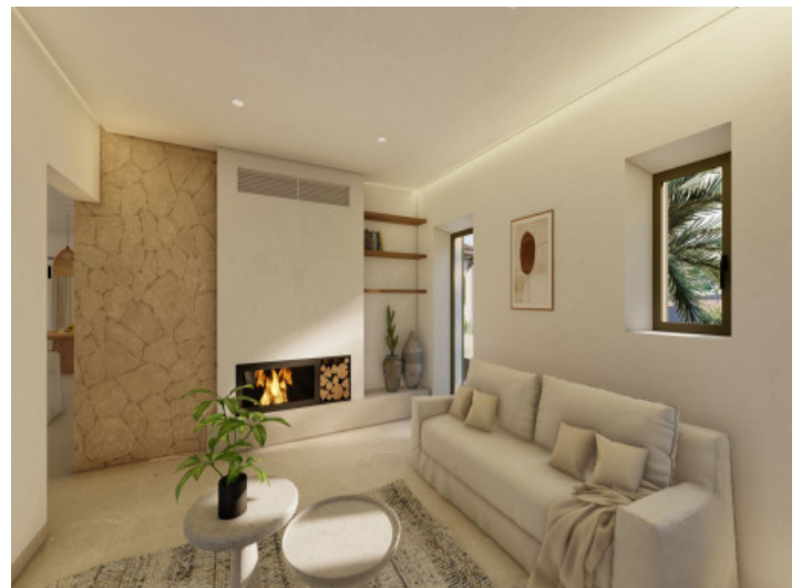
Living room with fireplace

All information is correct to the best of our knowledge. Errors and prior sale excepted. This prospectus is purely for information purposes. Only the notarized deed of sale is legally binding.