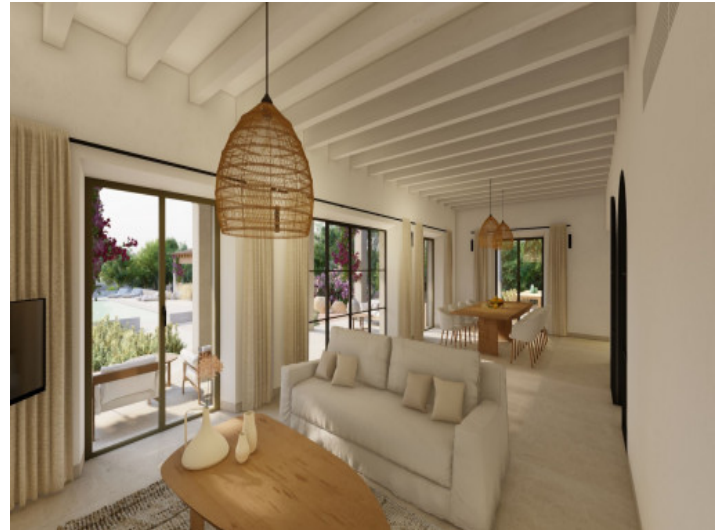
Large living room