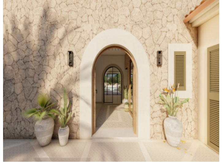
Natural stone walls