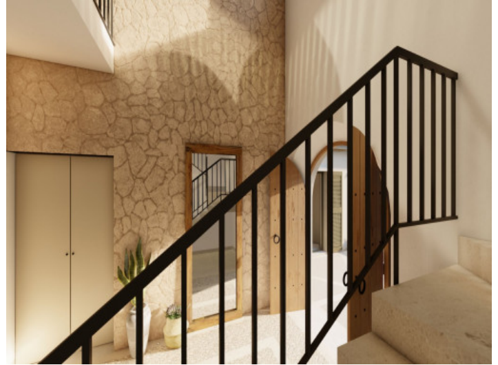
Staircase to the first floor