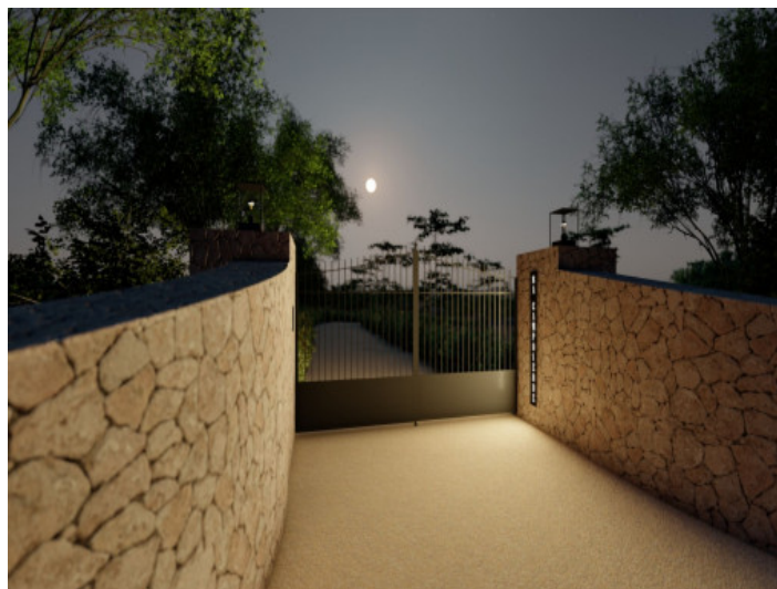
Entrance gate to the property