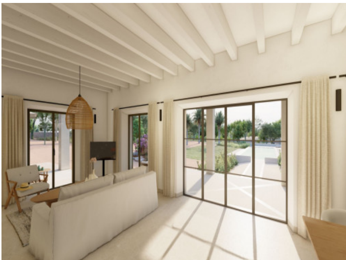
Bright living room