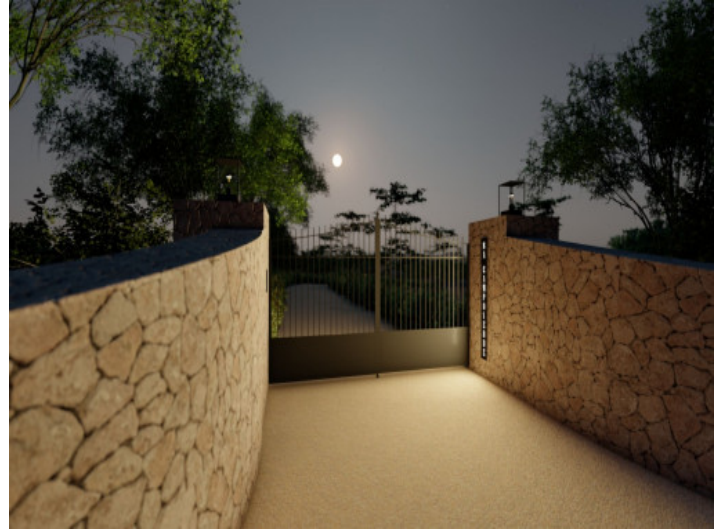
Entrance gate to the property