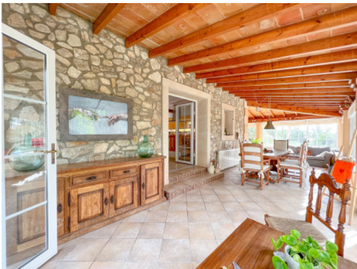
Lovely winter garden