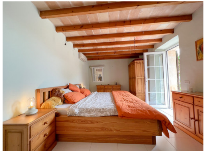
Bedroom on the ground floor