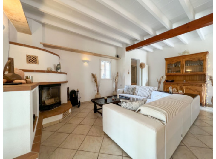
Comfortable living area with fireplace