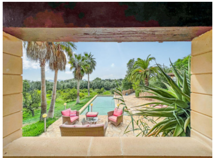
Nice pool area

All information is correct to the best of our knowledge. Errors and prior sale excepted. This prospectus is purely for information purposes. Only the notarized deed of sale is legally binding.