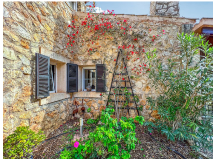
Natural stone walls