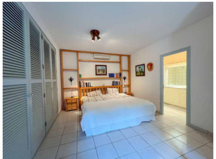
Second bedroom with bath en suite on the ground floor

All information is correct to the best of our knowledge. Errors and prior sale excepted. This prospectus is purely for information purposes. Only the notarized deed of sale is legally binding.