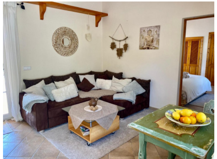
Living area guesthouse