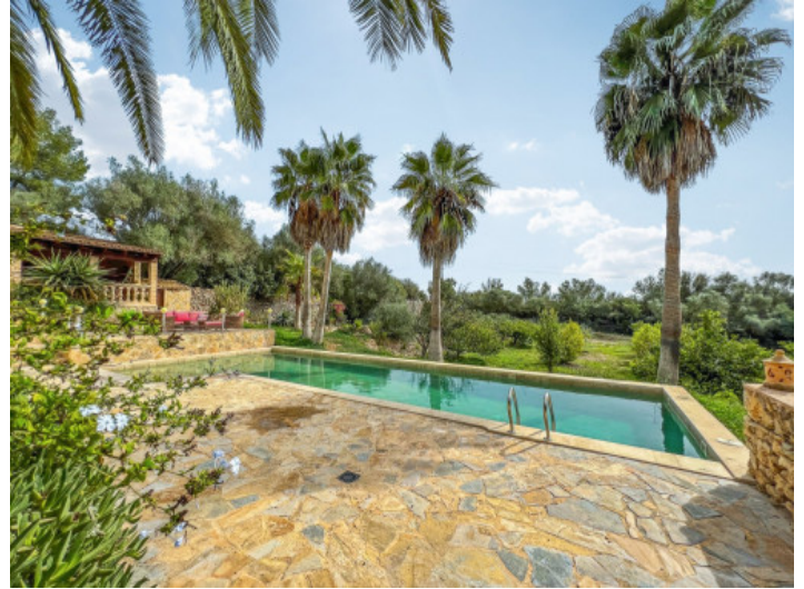
Tropical pool area