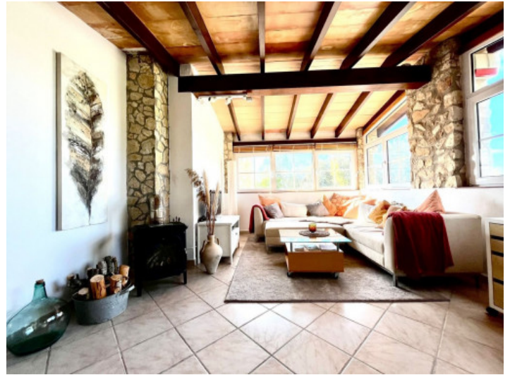
Living area studio