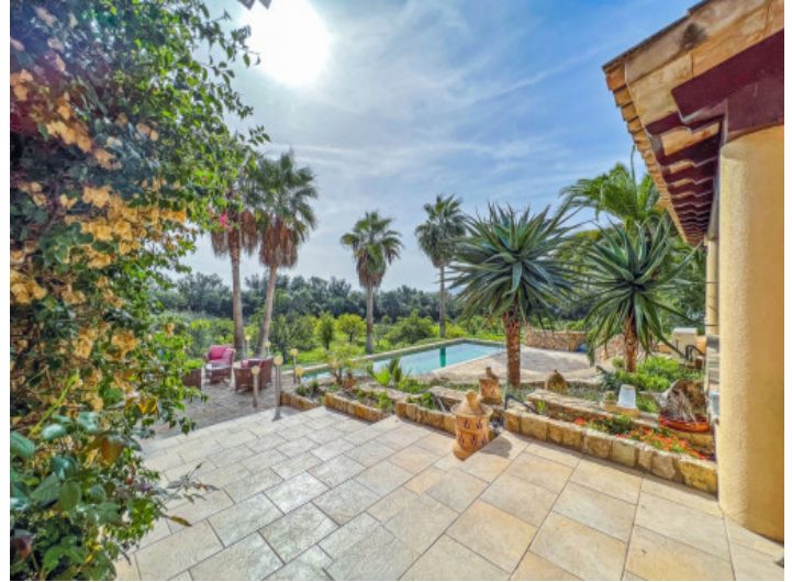
View from the wintergarden to the pool area