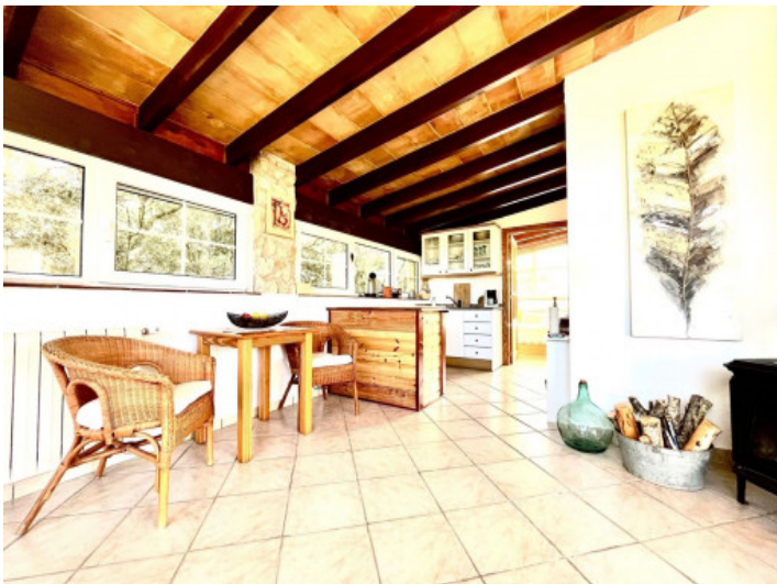
Dining area studio