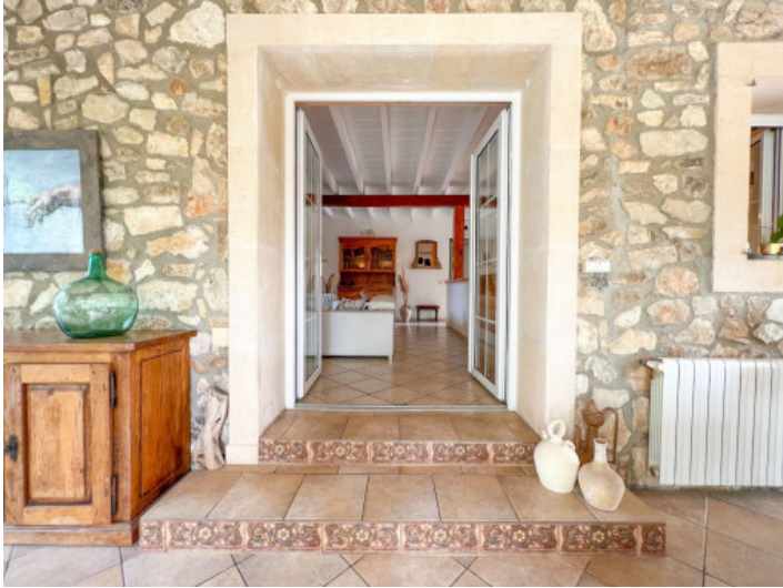
Entrance to the main house