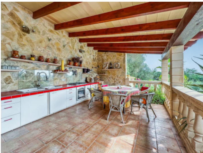
Amazing outdoor kitchen nearby the pool