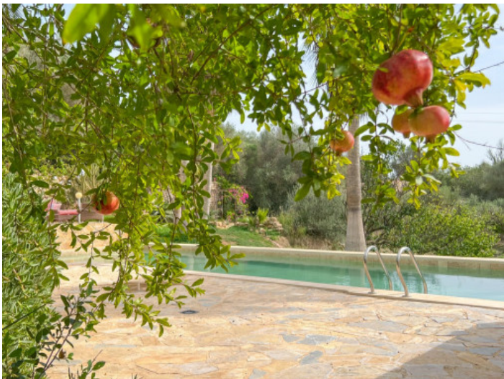
The pomegranate tree at the pool area