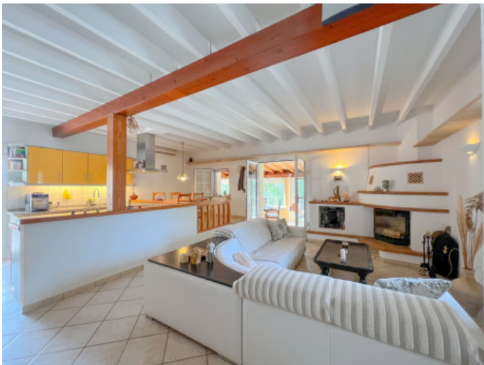
Open plan concept