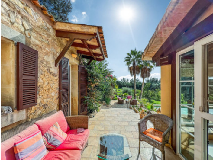
Sheltered seating area