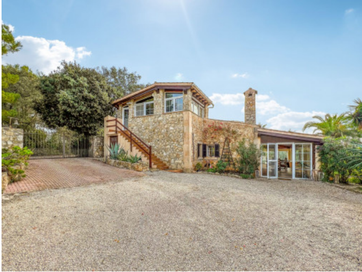
View to the facade of the main house