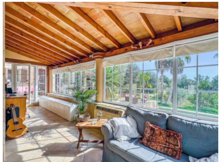
Winter garden with pool view

All information is correct to the best of our knowledge. Errors and prior sale excepted. This prospectus is purely for information purposes. Only the notarized deed of sale is legally binding.