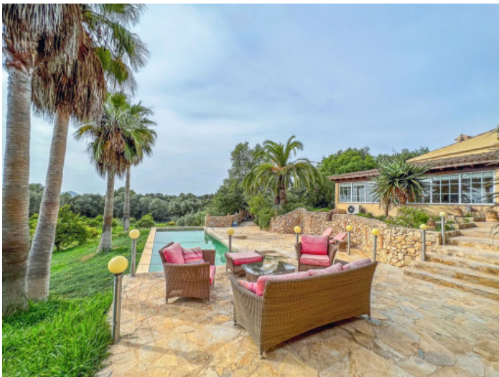
Lounge area at the pool