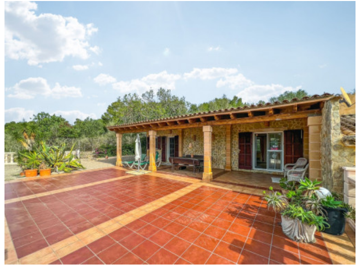
Large terrace of the guesthouse