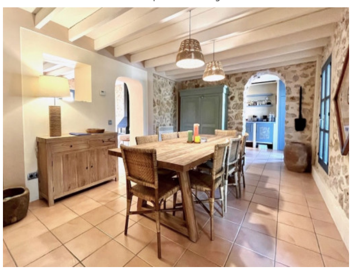
Bright and traditional dining area