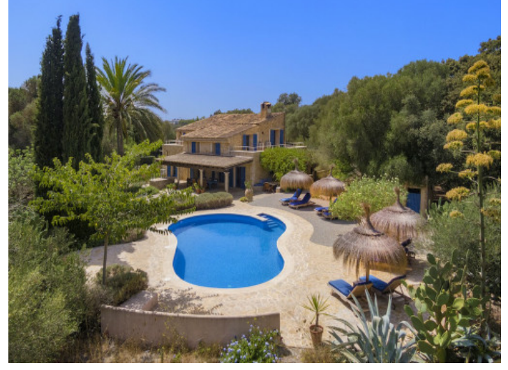
The property and its fantastic garden

PORTA MALLORQUINA® Your home. Our passion.