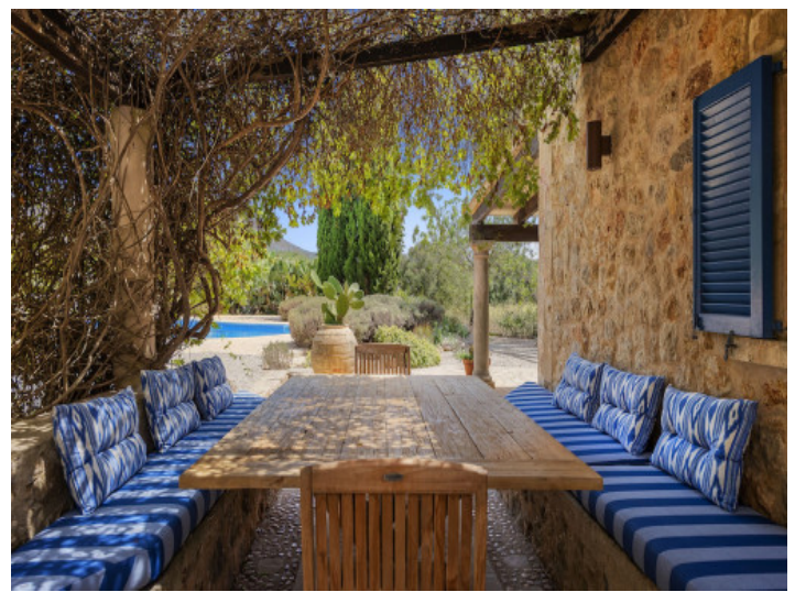
Beautiful porched dining area