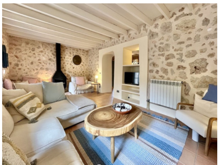
Natural stone walls and wooden beams give the property a special aura