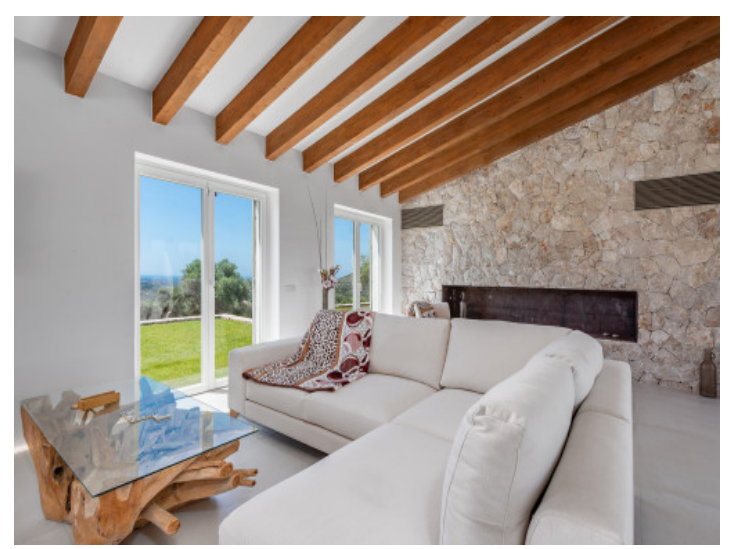
Living area Dining area All information is correct to the best of our knowledge. Errors and prior sale excepted. This prospectus is purely for information purposes. Only the notarized deed of sale is legally binding.