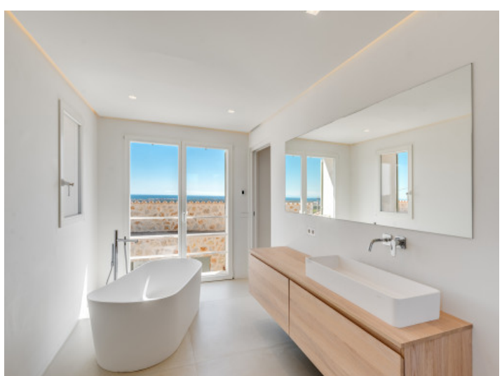
JUW_4736Finca _Nicole JUW_4760Finca _Nicole All information is correct to the best of our knowledge. Errors and prior sale excepted. This prospectus is purely for information purposes. Only the notarized deed of sale is legally binding.