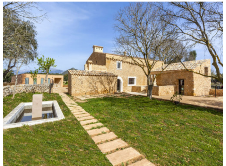
Property with extensive outdoor area