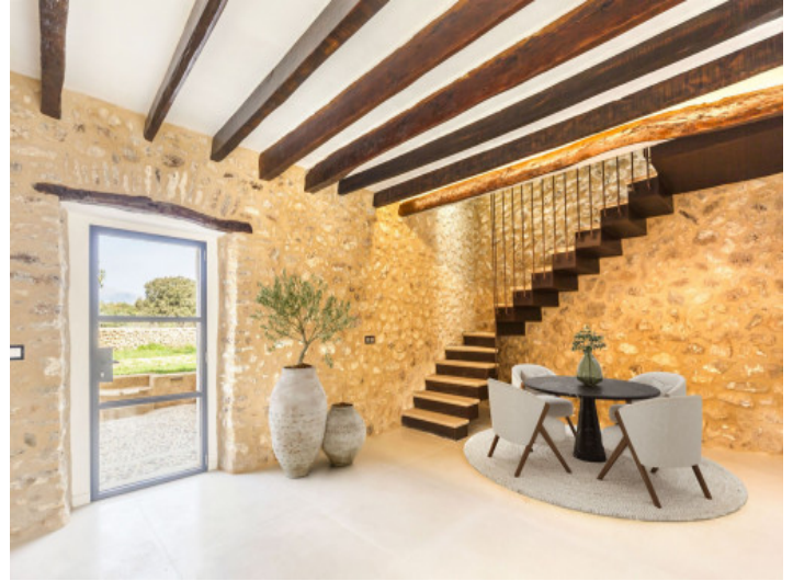
Room with natural stone wall and access from the outside