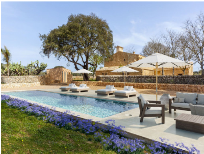
Wonderful outdoor area with pool