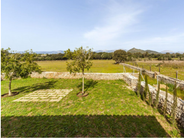
Sweeping views from the plot