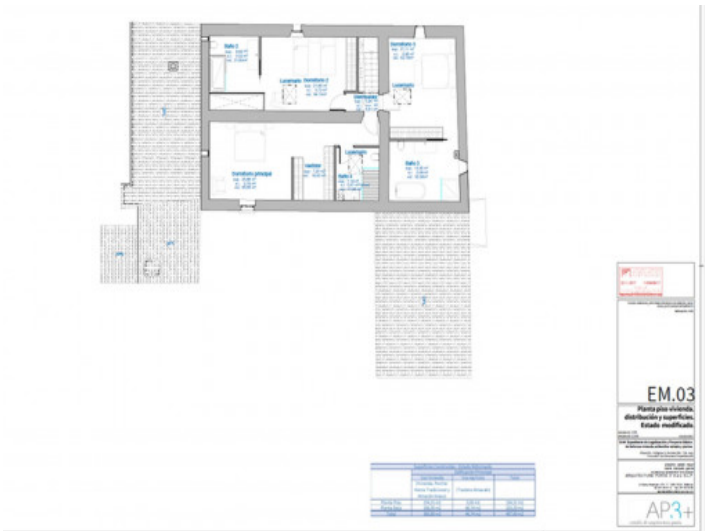
Plan first floor

All information is correct to the best of our knowledge. Errors and prior sale excepted. This prospectus is purely for information purposes. Only the notarized deed of sale is legally binding.