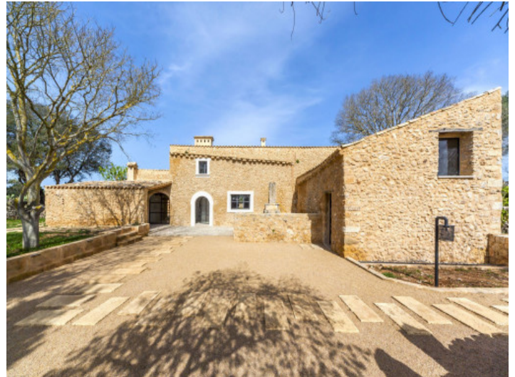
Front view and entrance to the finca