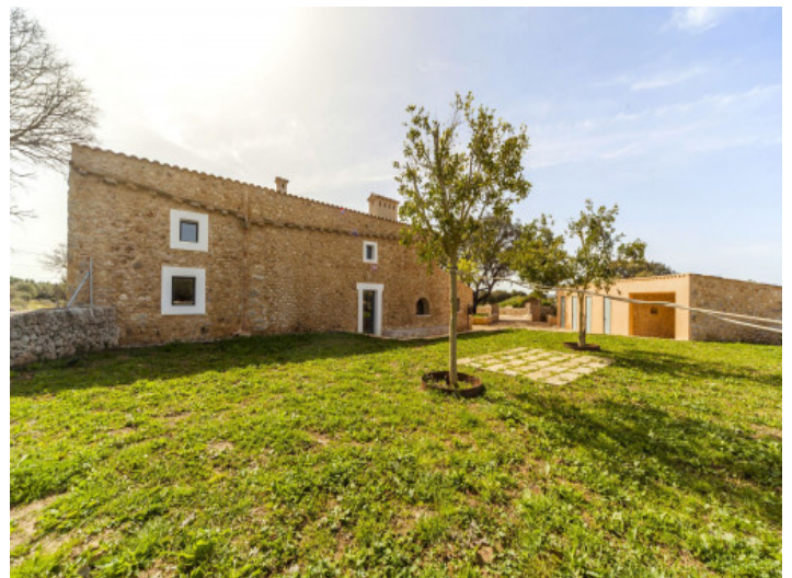
Finca and garden

All information is correct to the best of our knowledge. Errors and prior sale excepted. This prospectus is purely for information purposes. Only the notarized deed of sale is legally binding.