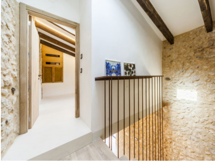
Corridor on the upper floor