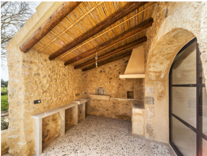
Fantastic bbq area