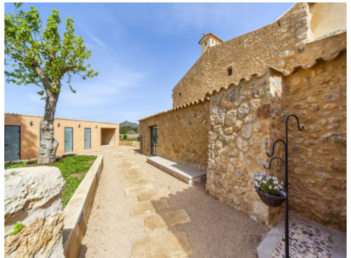
Exterior view and outdoor area